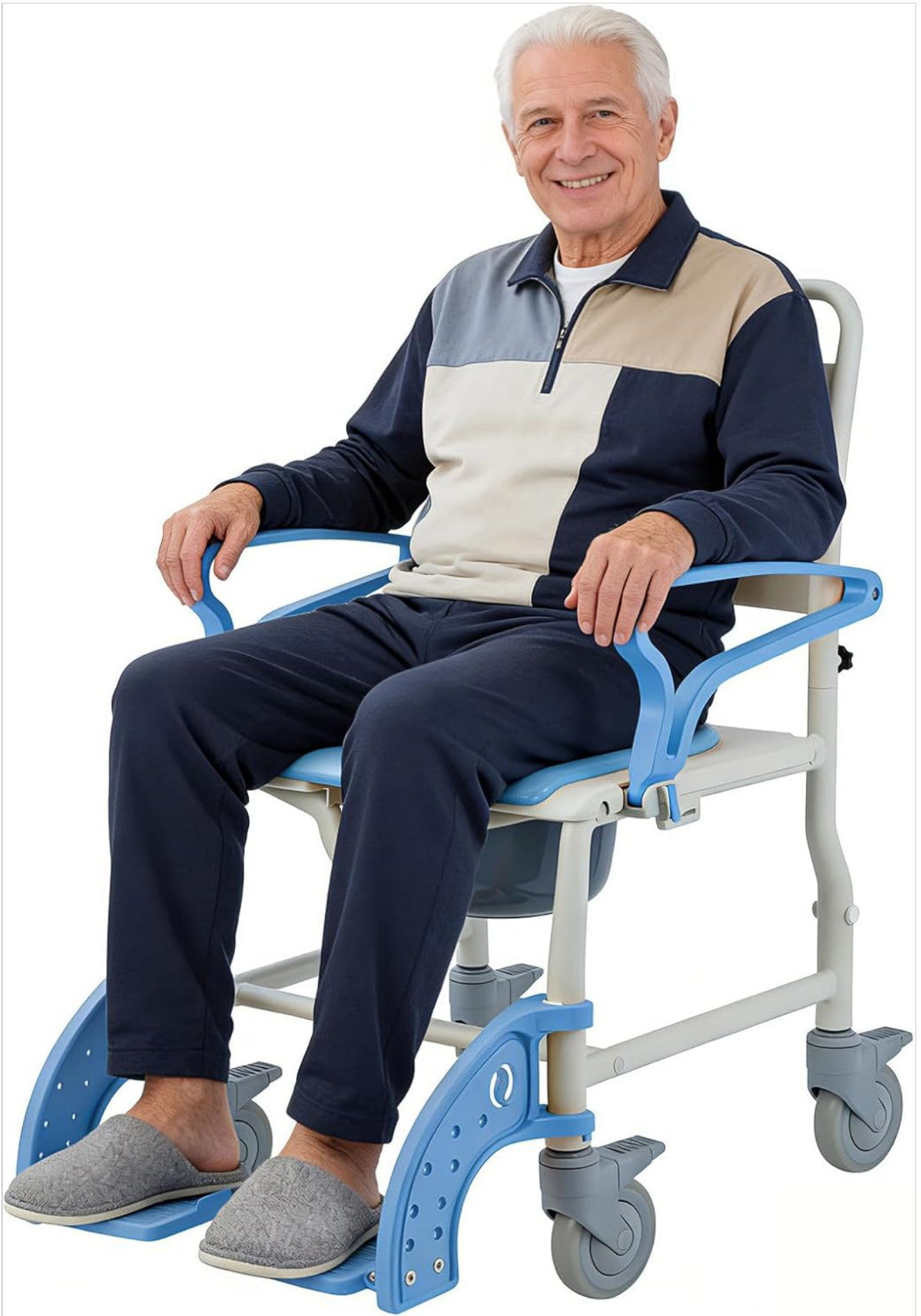
Image: Comfort Focused Design. This image emphasizes the comfortable, anti-slip seat cushion and the durable, rust-proof plastic waterproof material used in the chair's construction, ensuring both user comfort and product longevity.