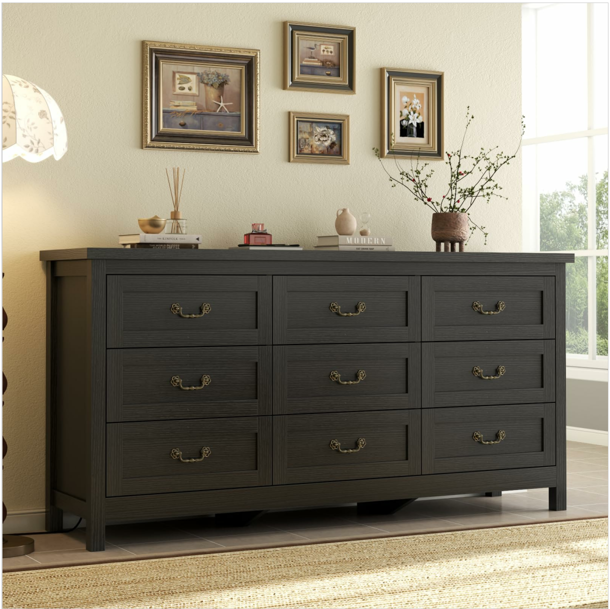
Figure 1: Loomie Upgraded 9-Drawer Dresser (Black)