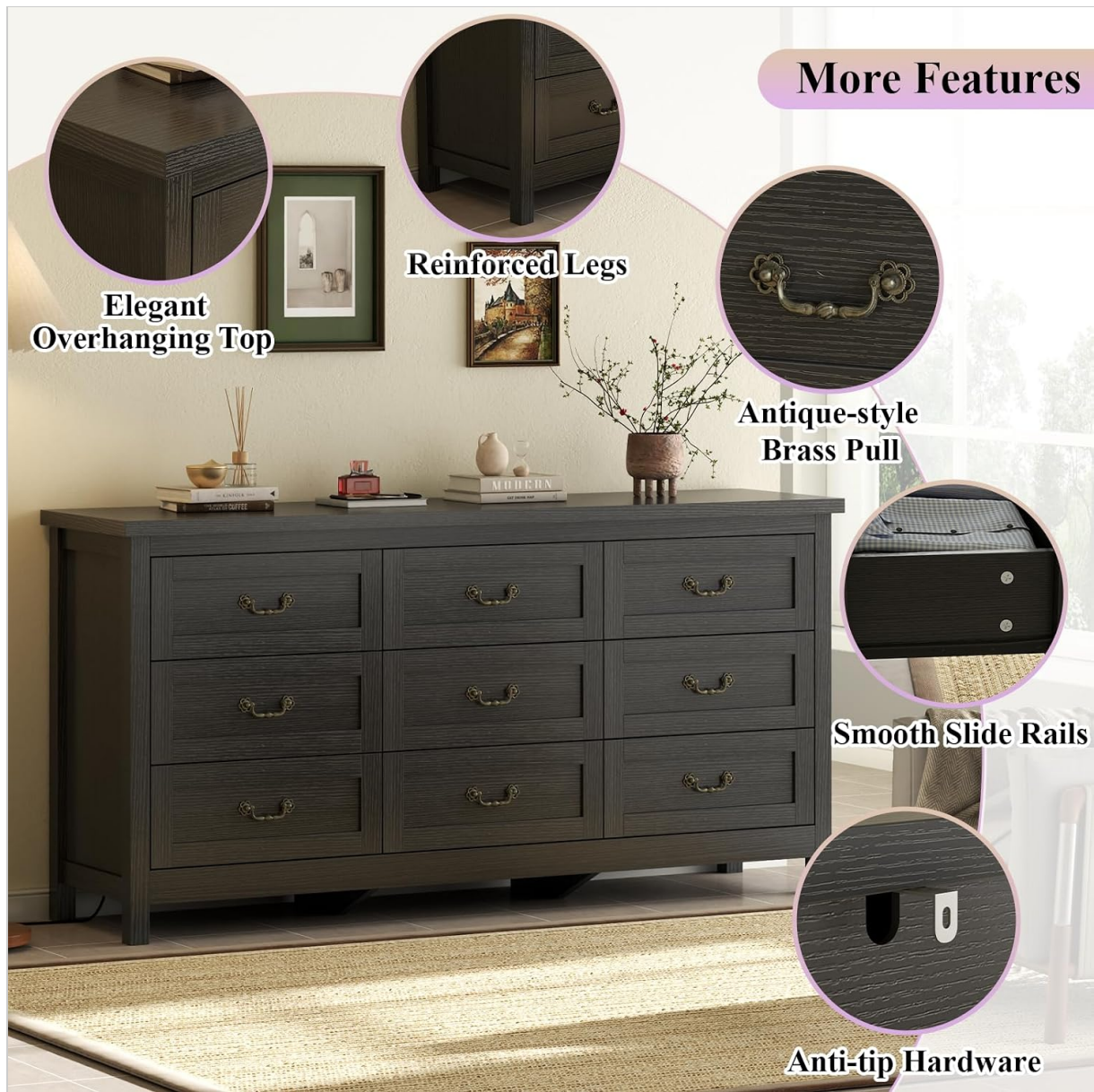
Figure 2: Detailed view of dresser features