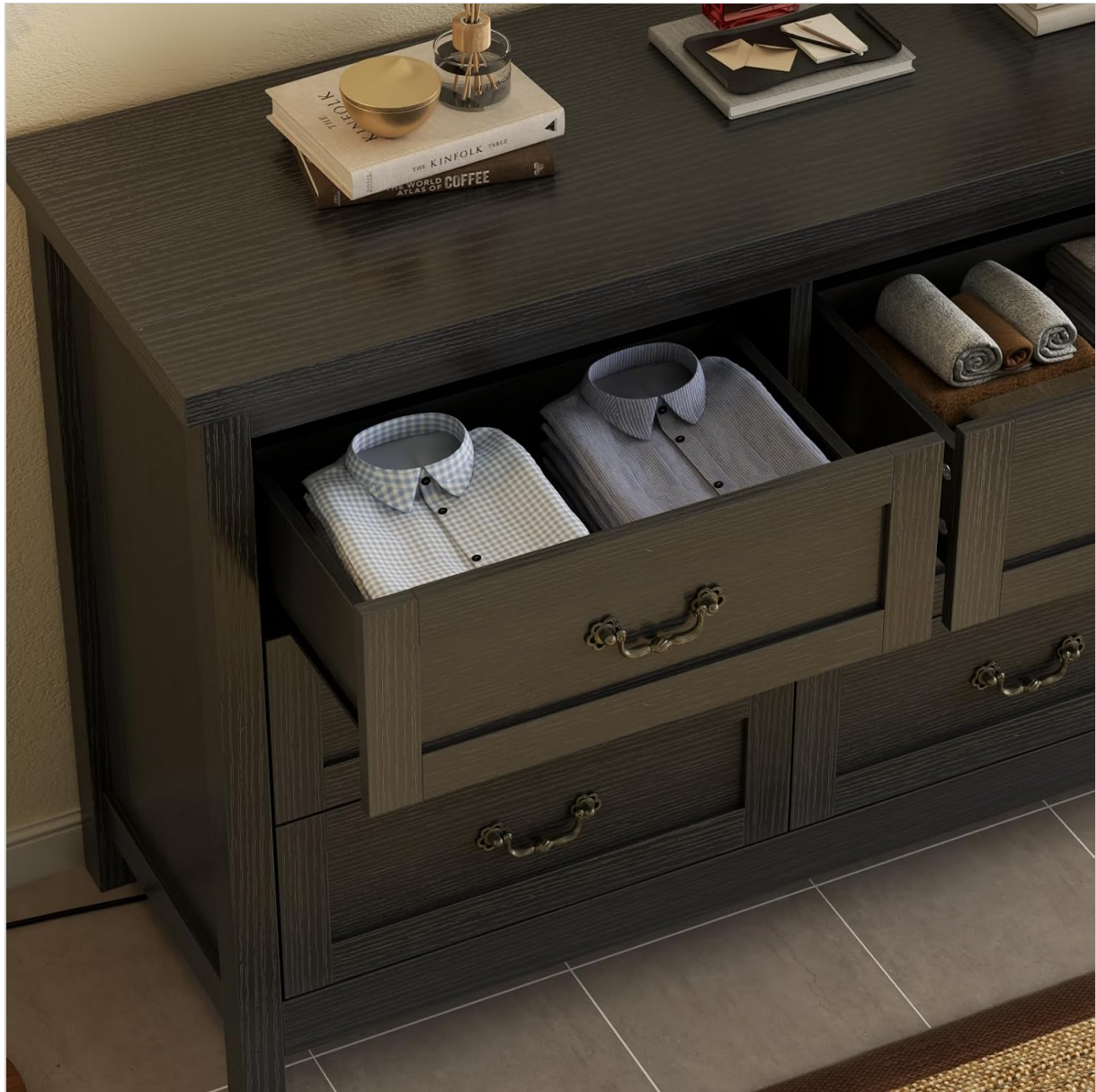
Figure 3: Example of drawer storage capacity.

The nine drawers operate on smooth-gliding rails, allowing for easy opening and closing. To ensure longevity, avoid forcing drawers open or shut. Distribute weight evenly within each drawer to prevent strain on the rails and maintain smooth operation.