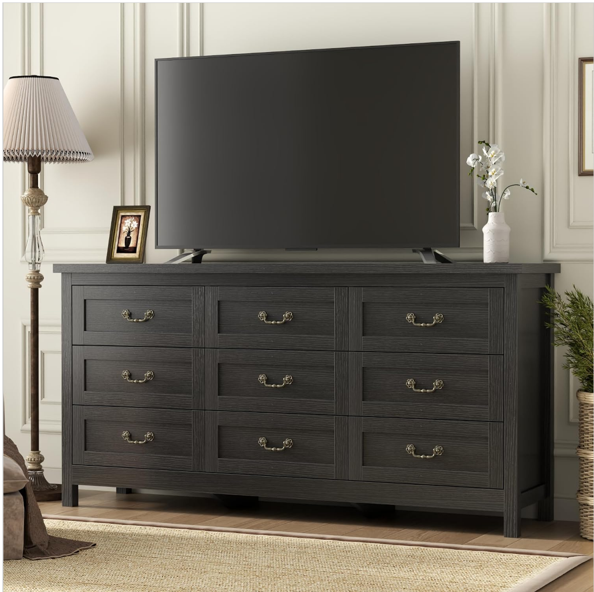
Figure 4: Dresser functioning as a TV stand.