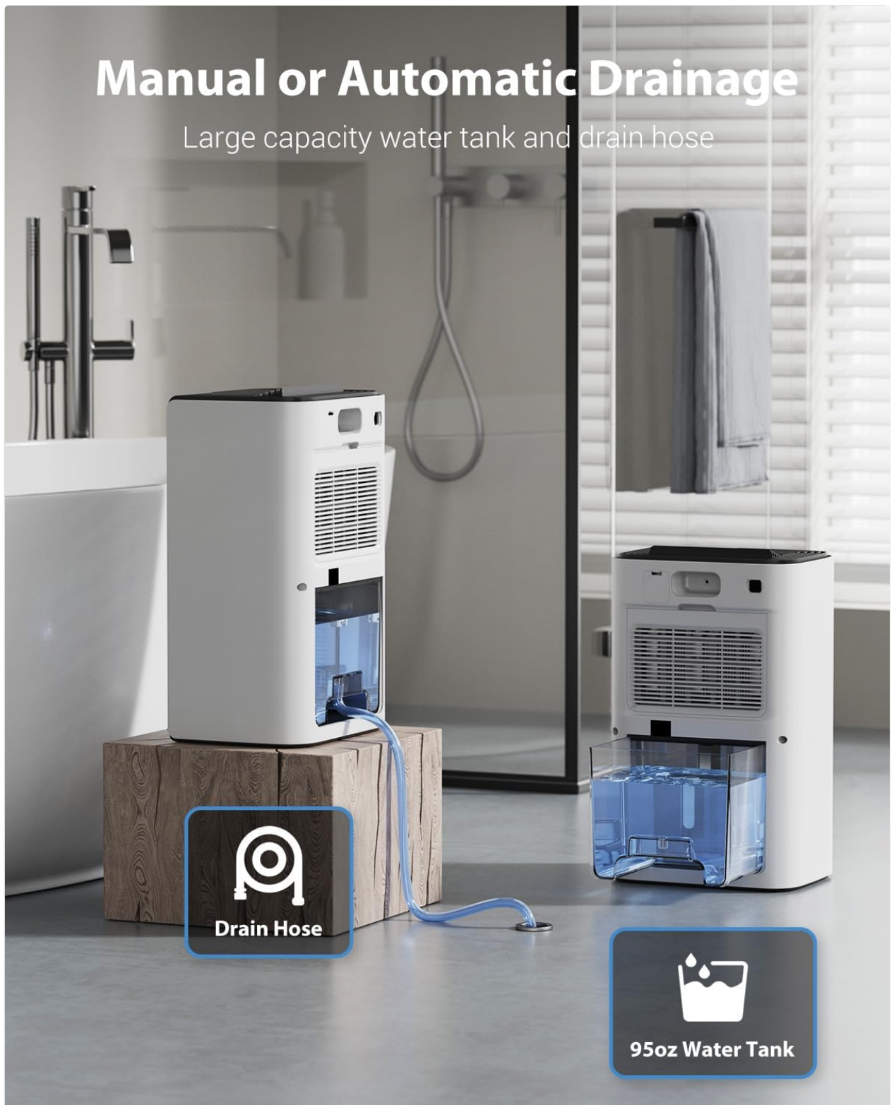
Figure 4: Removing the water tank for manual drainage.