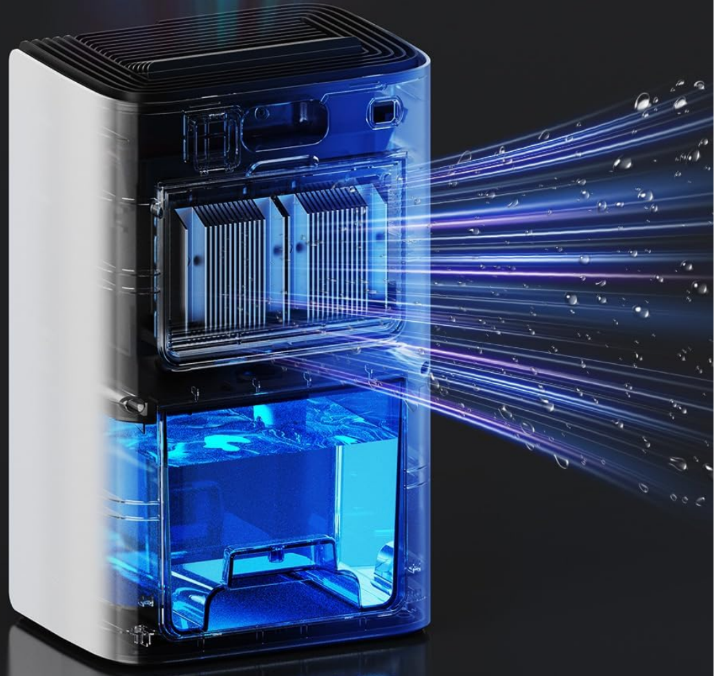
Figure 2: Side view of the ubbo Z18 Dehumidifier, highlighting the air outlet.