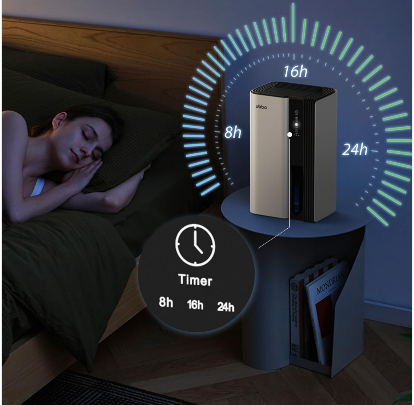
Figure 6: Control panel of the ubbo Z18 Dehumidifier.

Auto shut off when the set time is reached or the water is full