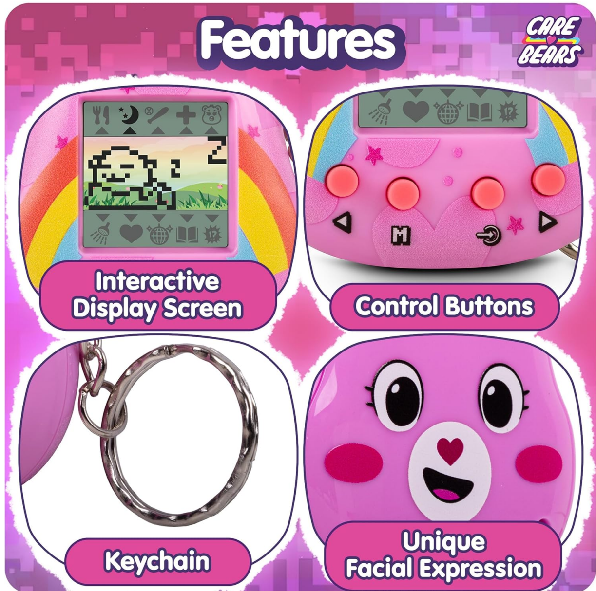
Image: A detailed view of the Cheer Bear Digital Pet, illustrating its interactive display, physical control buttons, keychain, and the unique facial expressions of the character.