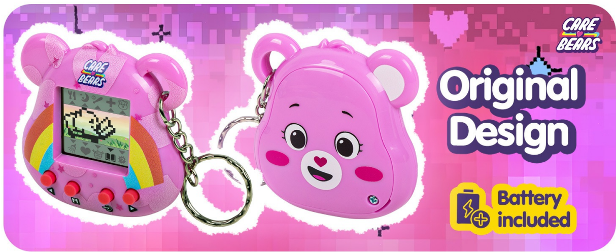
Image: The Cheer Bear Digital Pet showcasing its original design from both front and back views.