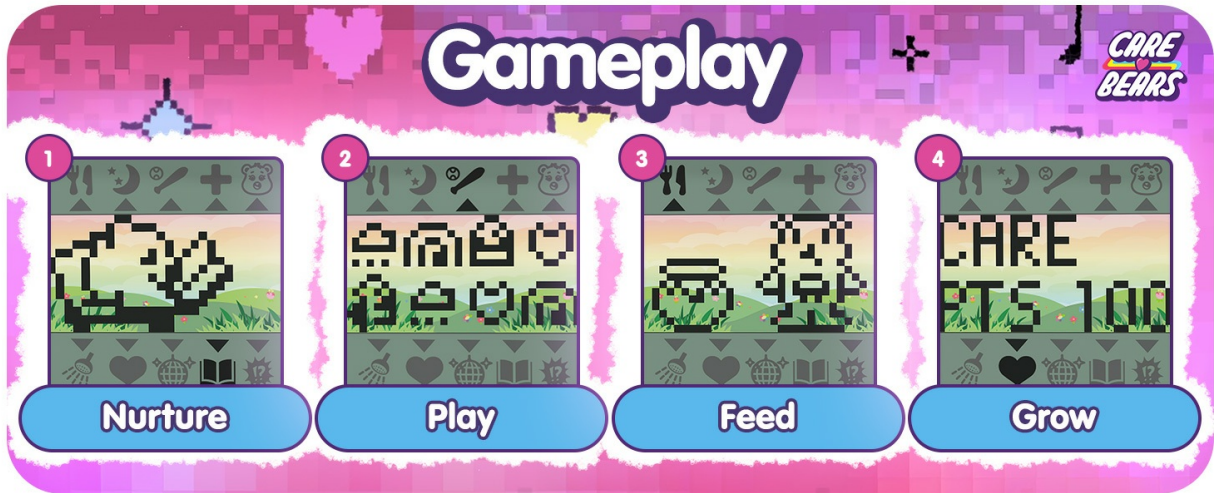
Image: A visual representation of the gameplay options on the Cheer Bear Digital Pet screen, including Nurture, Play, Feed, and Grow.