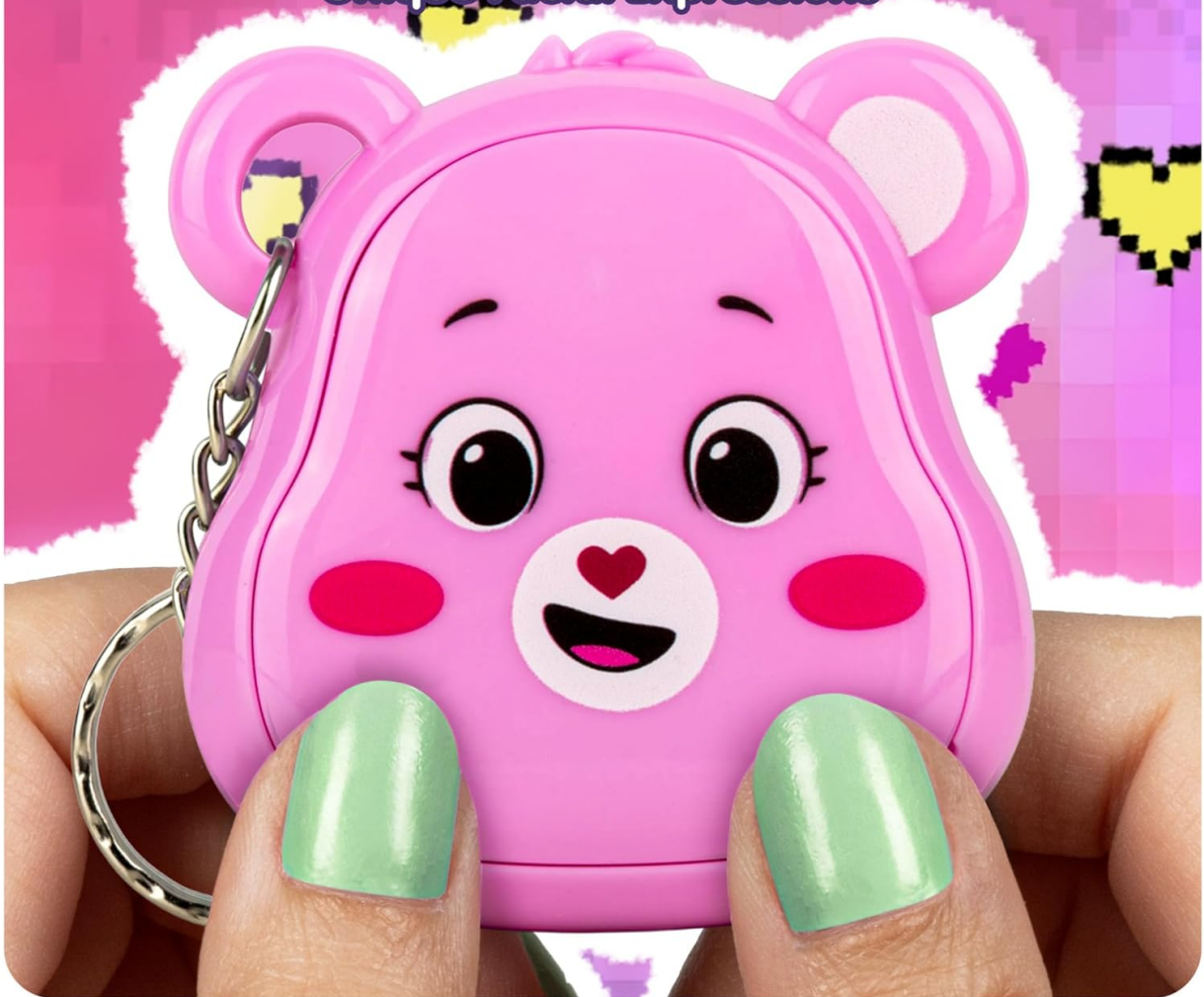
Image: The Cheer Bear Digital Pet, a bright pink device shaped like Cheer Bear's head, featuring her rainbow belly badge on the screen.