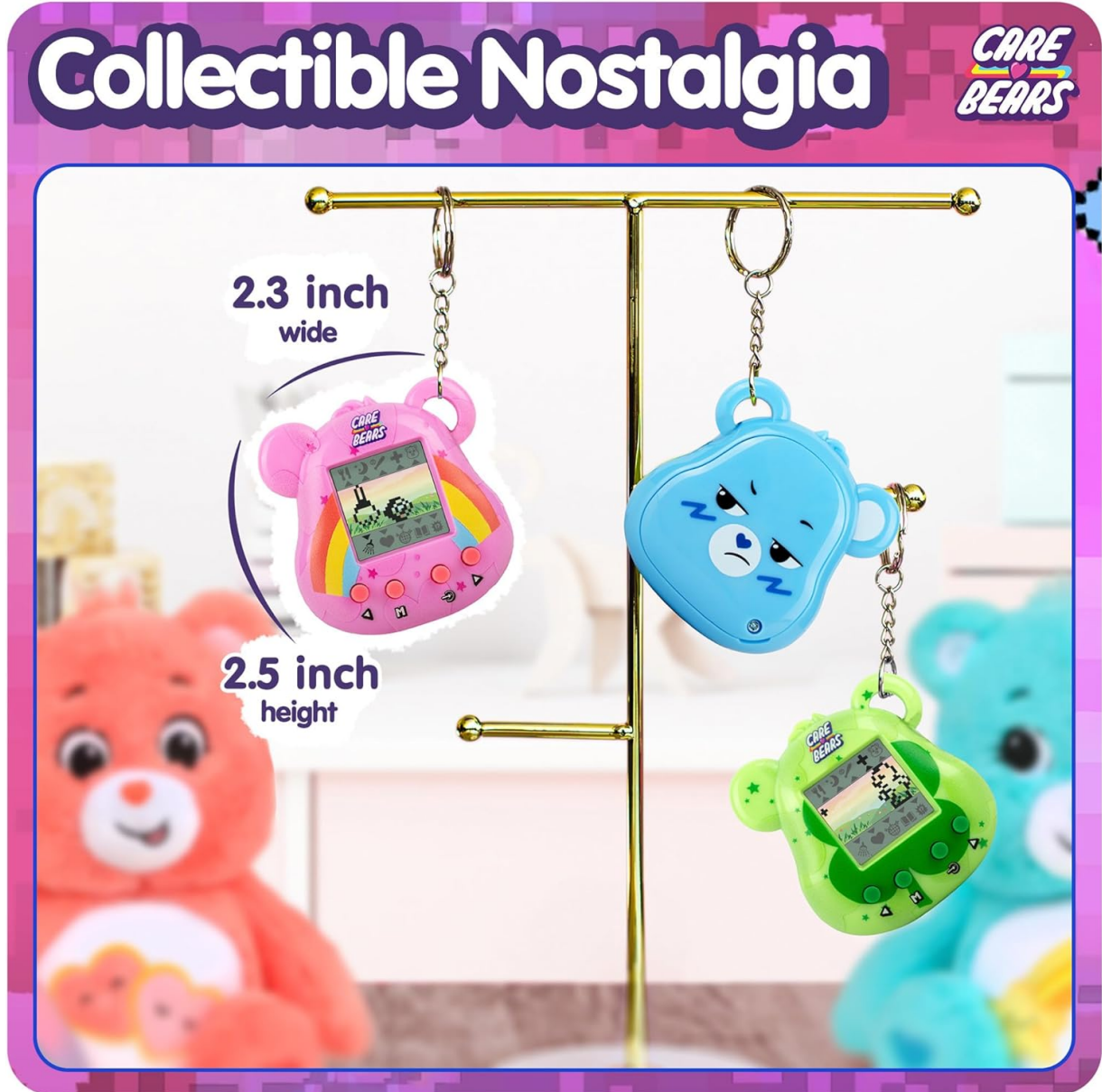
Image: A close-up of the Cheer Bear Digital Pet, highlighting its interactive display, control buttons, and keychain attachment.