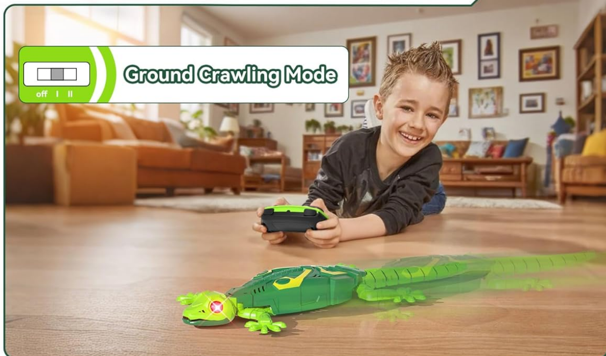
Image: The gecko demonstrating Wall Climbing Mode and Ground Crawling Mode.