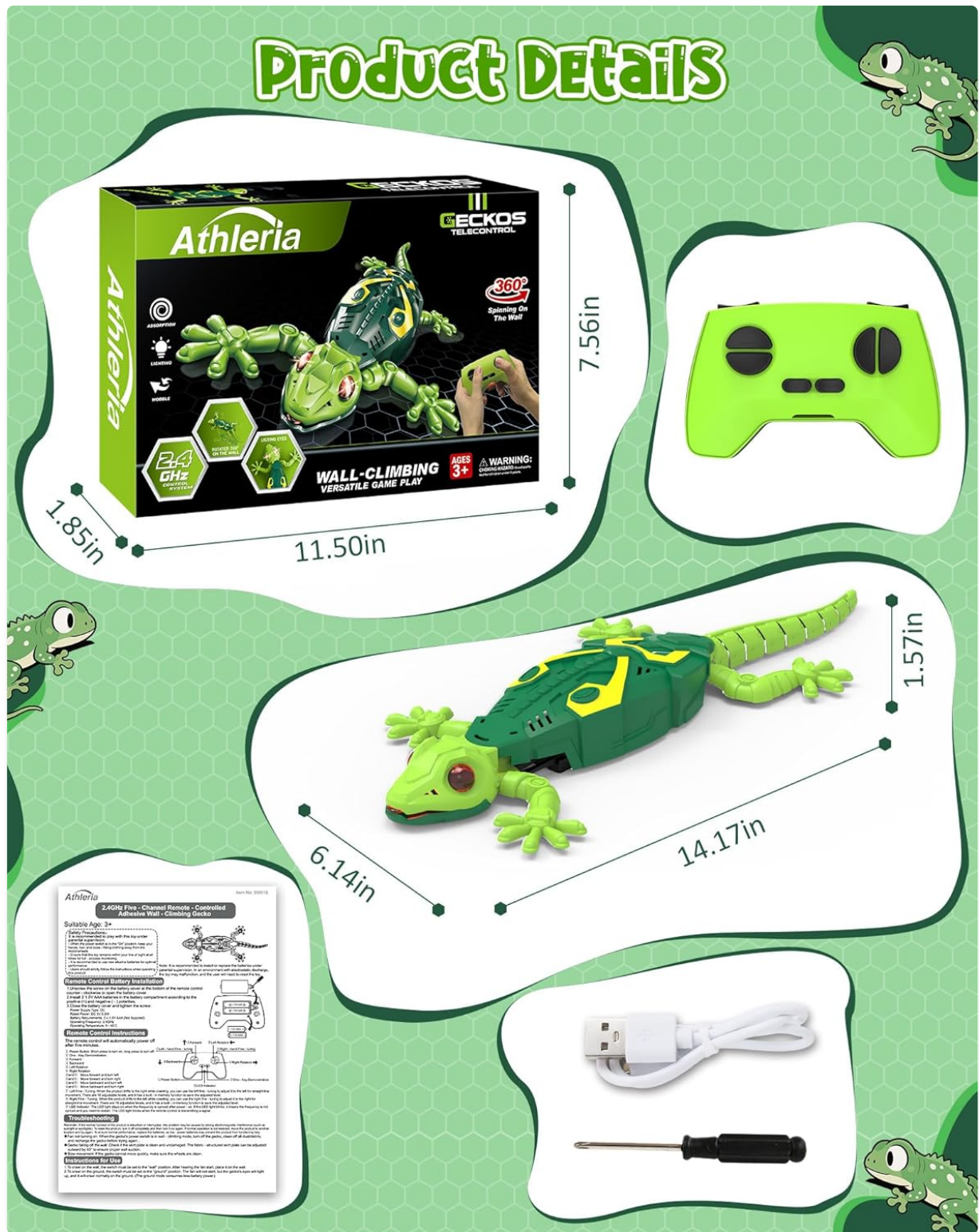
Image: Overview of the ATHLERIA Wall Climbing Robot Gecko and its included accessories.