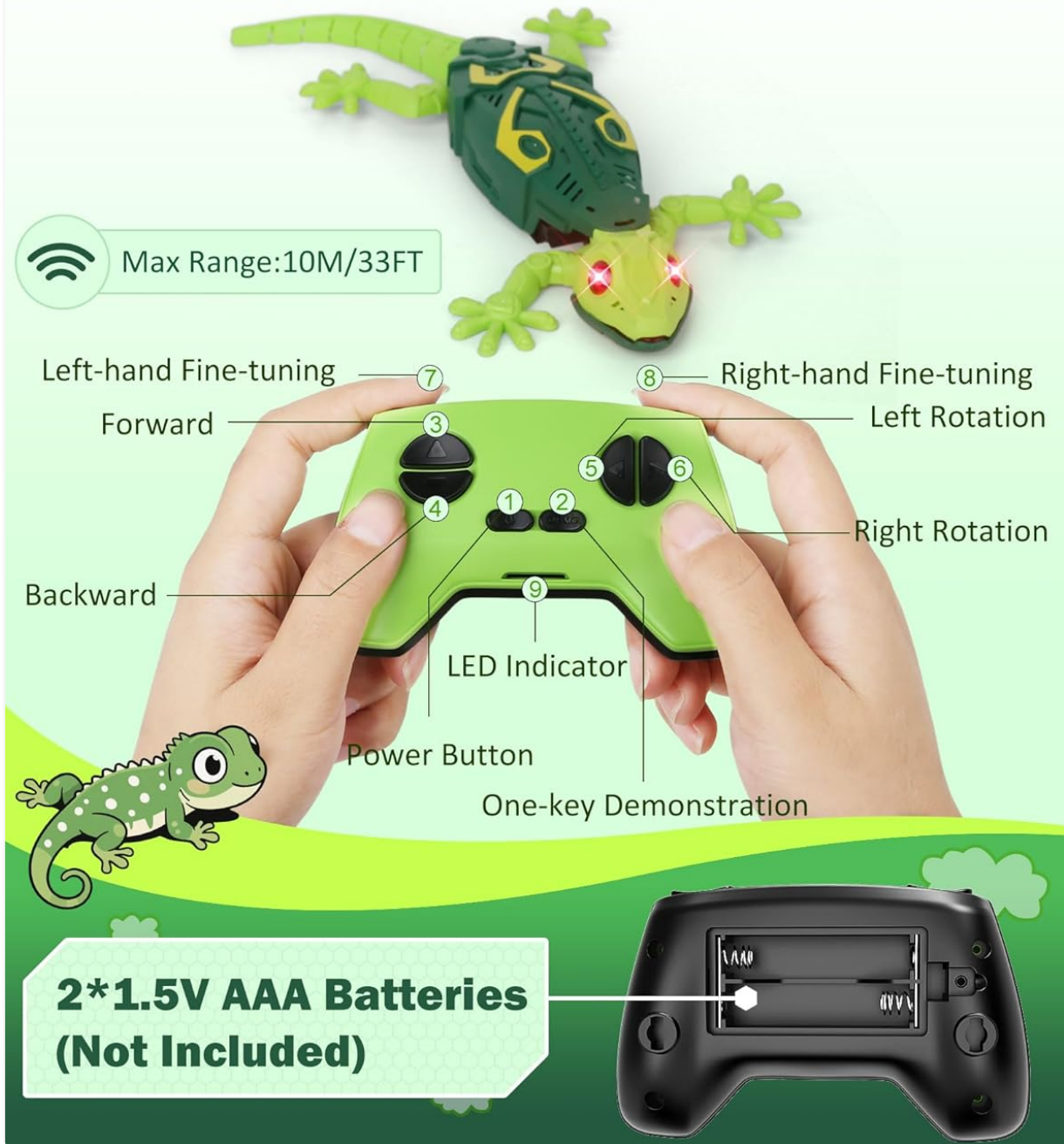
Image: Remote control layout and battery installation guide.