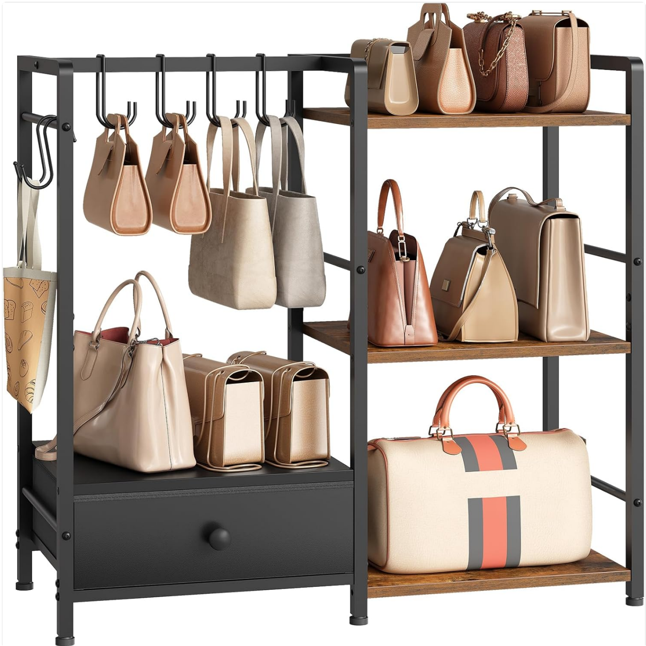
Figure 4: The organizer in use, demonstrating how bags can be stored on shelves and hung from hooks.

Position the organizer in your wardrobe, hallway, bedroom, or any area where additional storage and organization are needed. Its modern industrial design complements various interior styles.