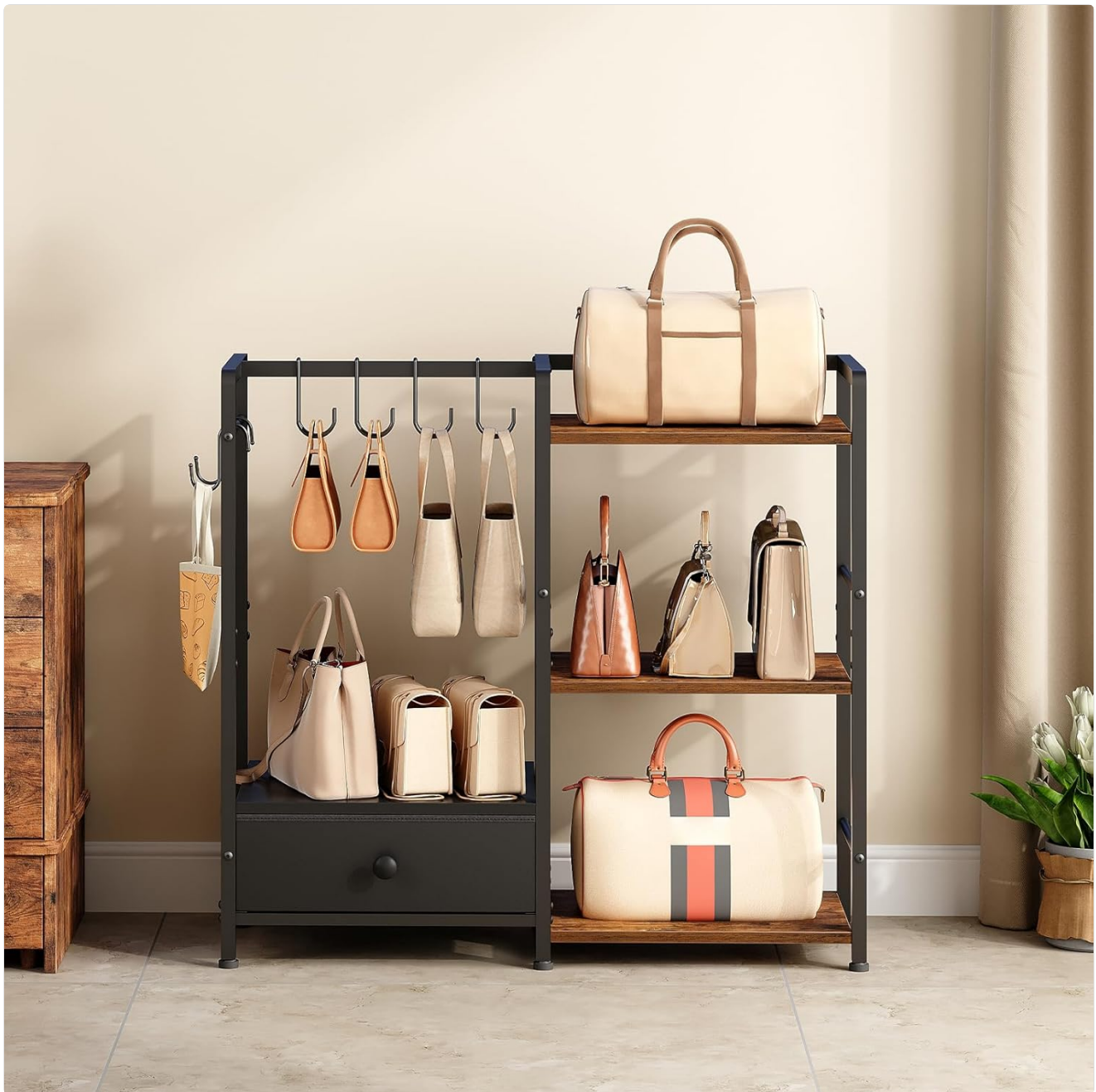
Figure 1: HOOBRO EBF28CJ01 3-Tier Hanging Organizer in a room setting, showcasing its storage capabilities for various bags.