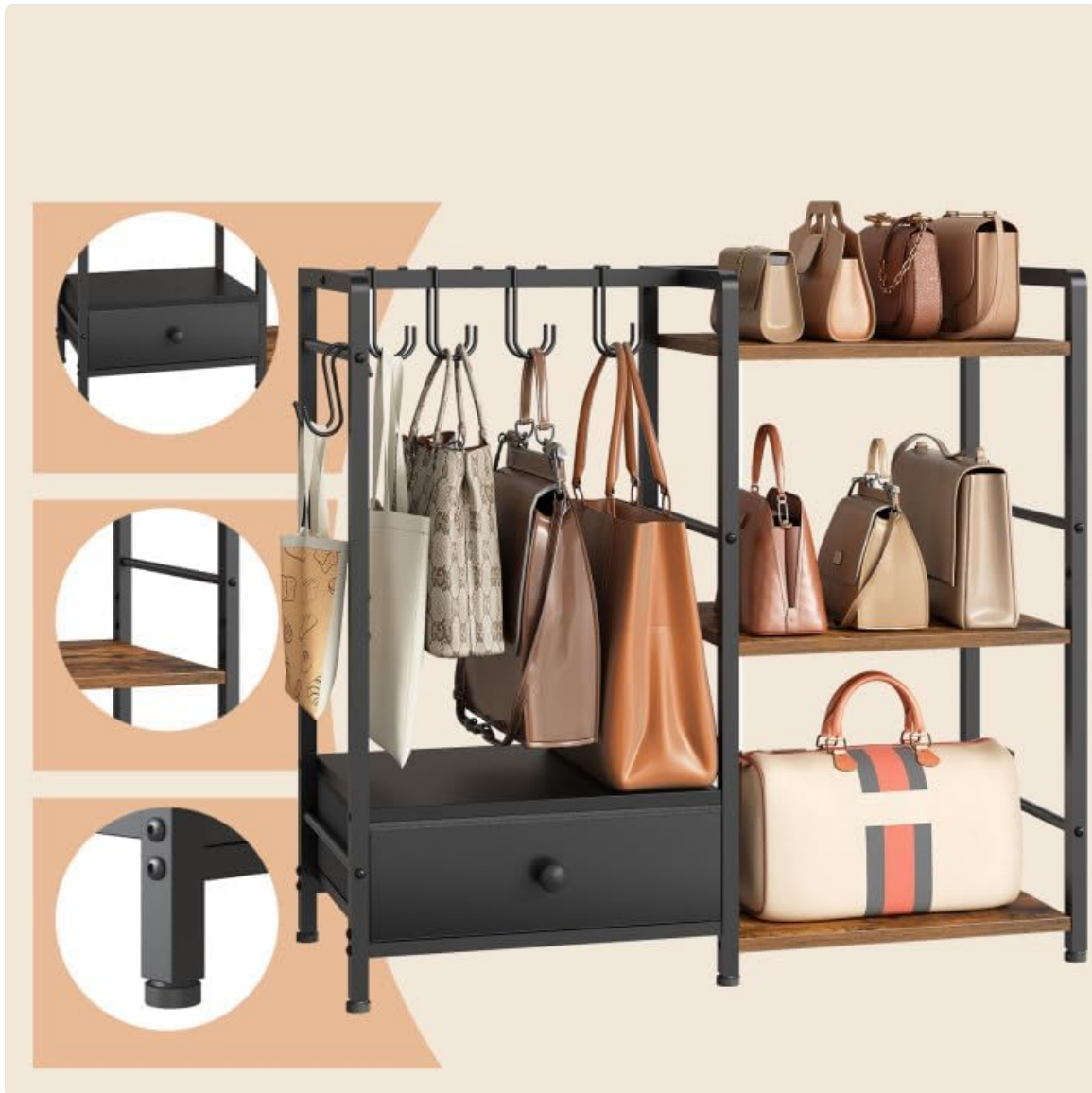
Figure 3: Close-up details of the organizer, highlighting the drawer, adjustable hooks, leveling feet, and protective shelf rails.