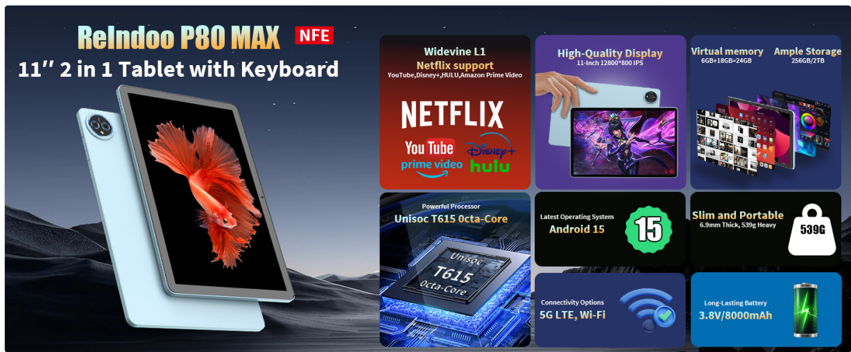
Image: ReIndoo P80 Android 15 Tablet highlighting its core specifications and included accessories.