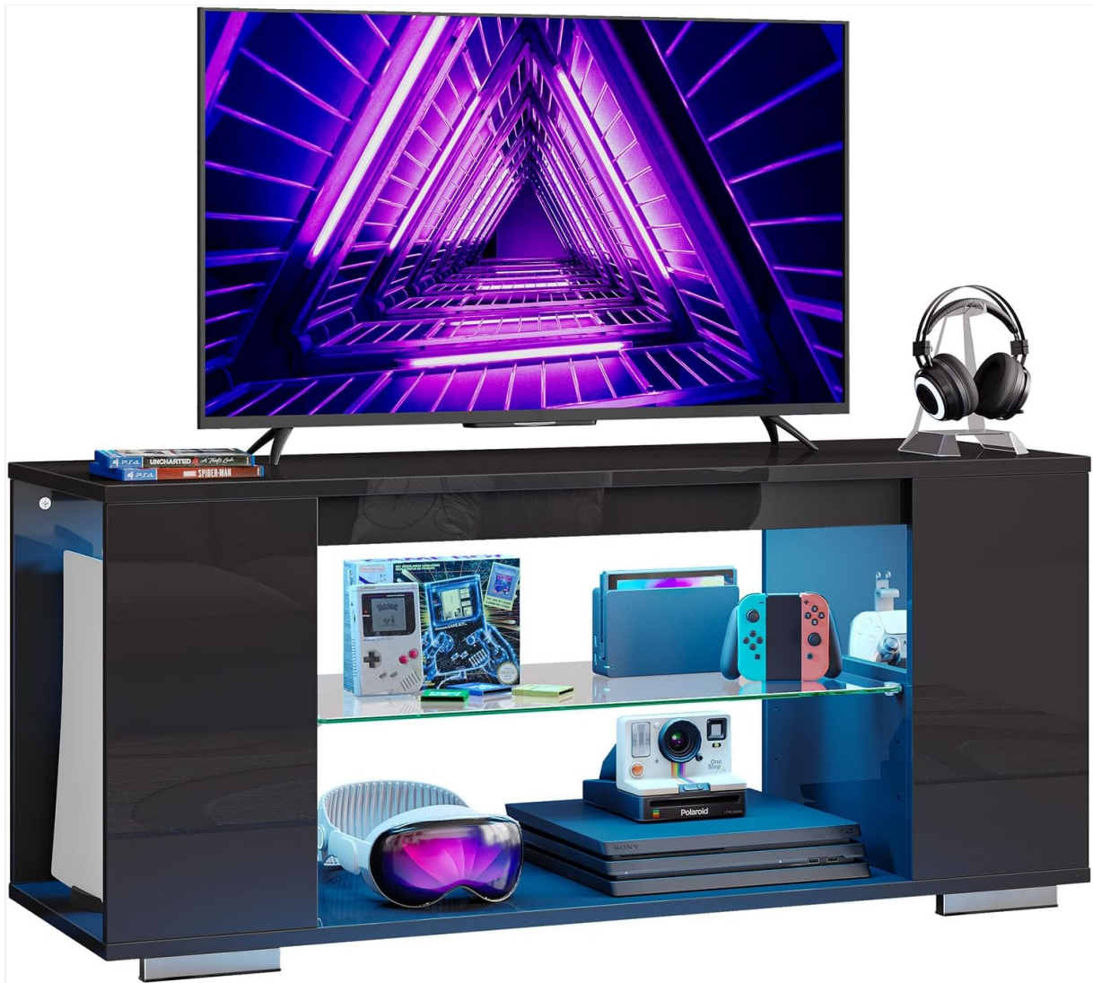
Image 1: Pinmoco 47-inch High Gloss TV Stand with LED Lights, displaying a television, gaming consoles, and various accessories neatly arranged on its shelves. The LED lights are illuminated, creating an ambient glow.