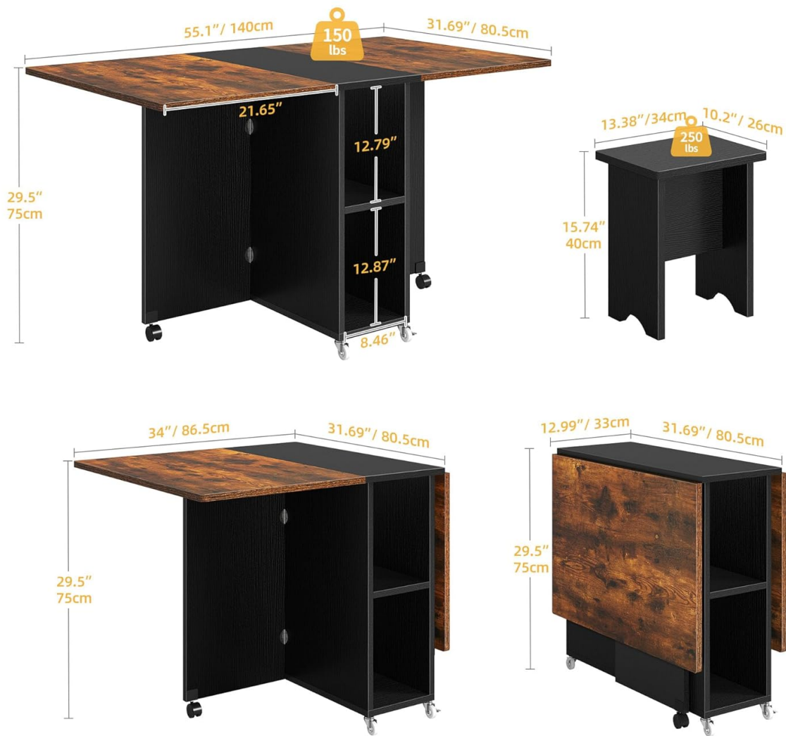
Image 2.2: Detailed product dimensions for the table (collapsed and expanded) and chairs.