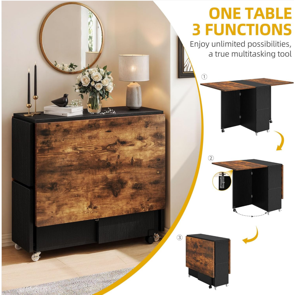
Image 4.1: The table's versatile configurations, from fully extended to compact storage.