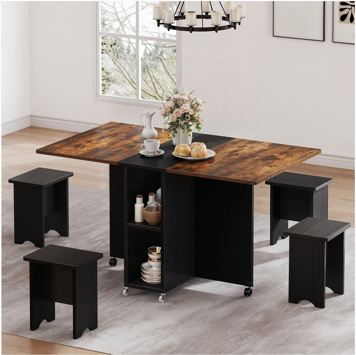
Image 2.1: The DWVO dining table set in its fully extended configuration, showcasing its capacity for dining.