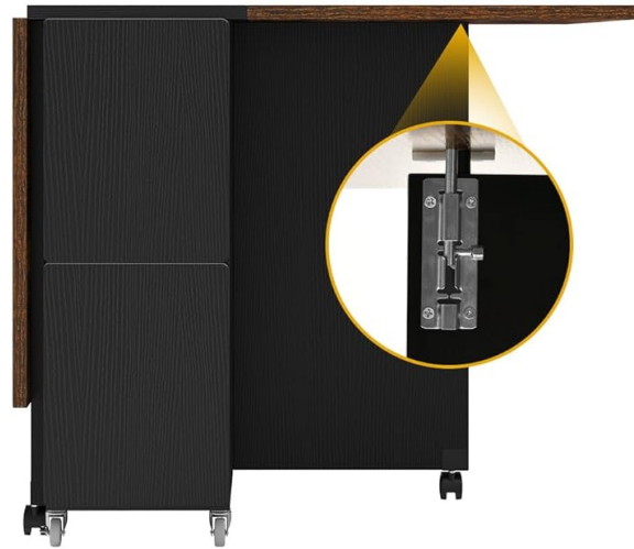
Image 5.1: Visual representation of the table's space-saving design, including stool storage and foldable desktop mechanism.

Easily foldable dining table to meet different needs, free to define your living space