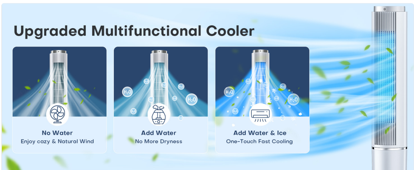
Image: A diagram illustrating the evaporative cooling process. Hot, dry air is drawn into water-soaked panels, converting it into cooler, more humid air.