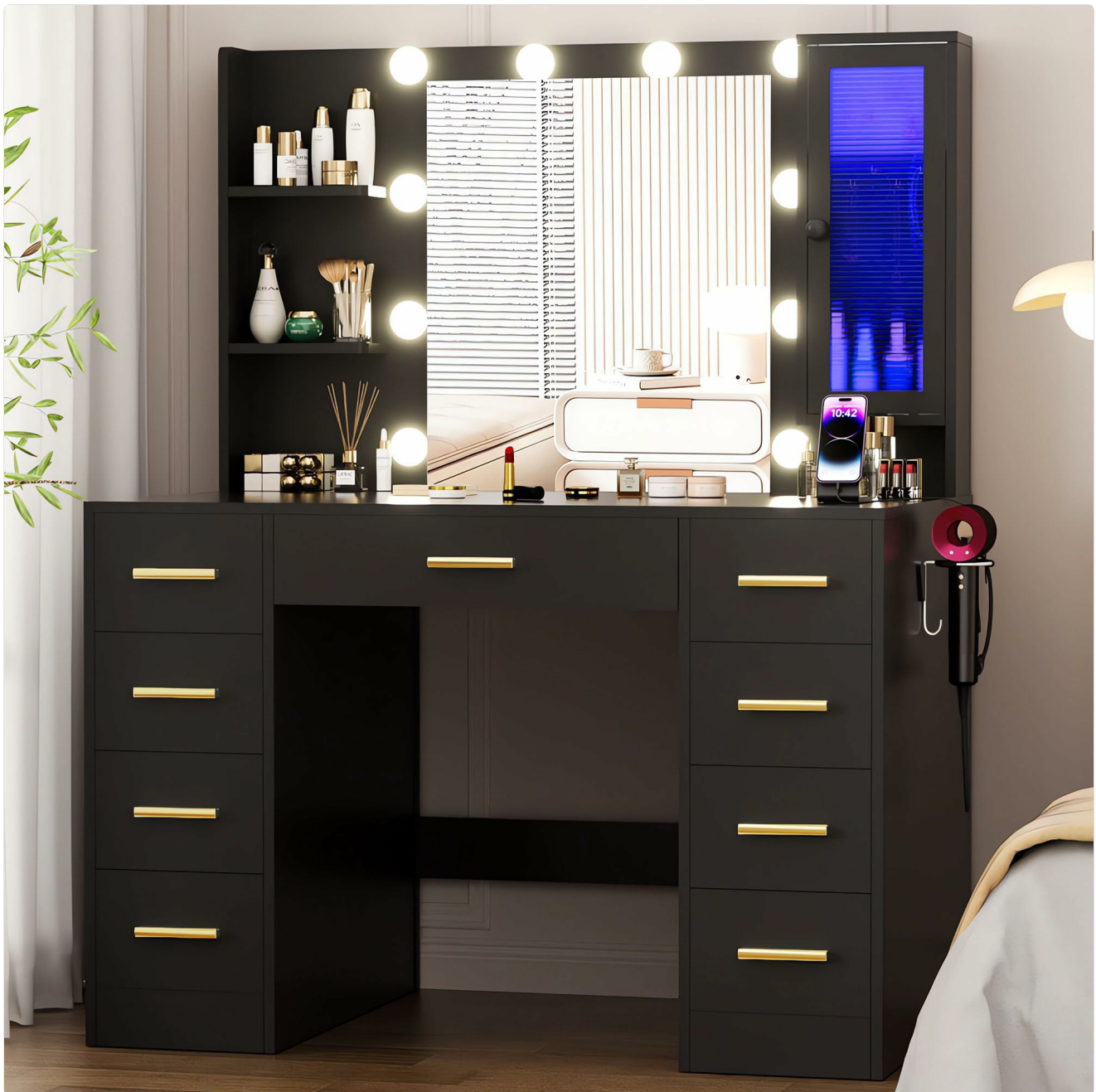
Image: ERLEJIA Vanity Desk. A full view of the black vanity desk, showcasing its large mirror with LED lights, multiple drawers, open shelves, and the overall modern design.