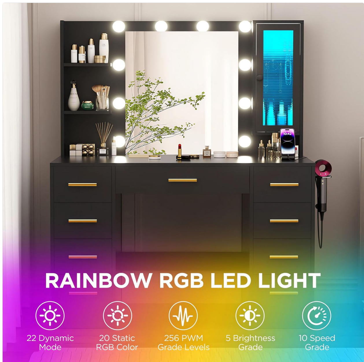
Image: RGB LED Lighting System. This image highlights the RGB LED lighting system within the vanity cabinet, offering 22 dynamic modes, 20 static RGB colors, 256 PWM grade levels, 5 brightness grades, and 10 speed grades for customizable ambiance.