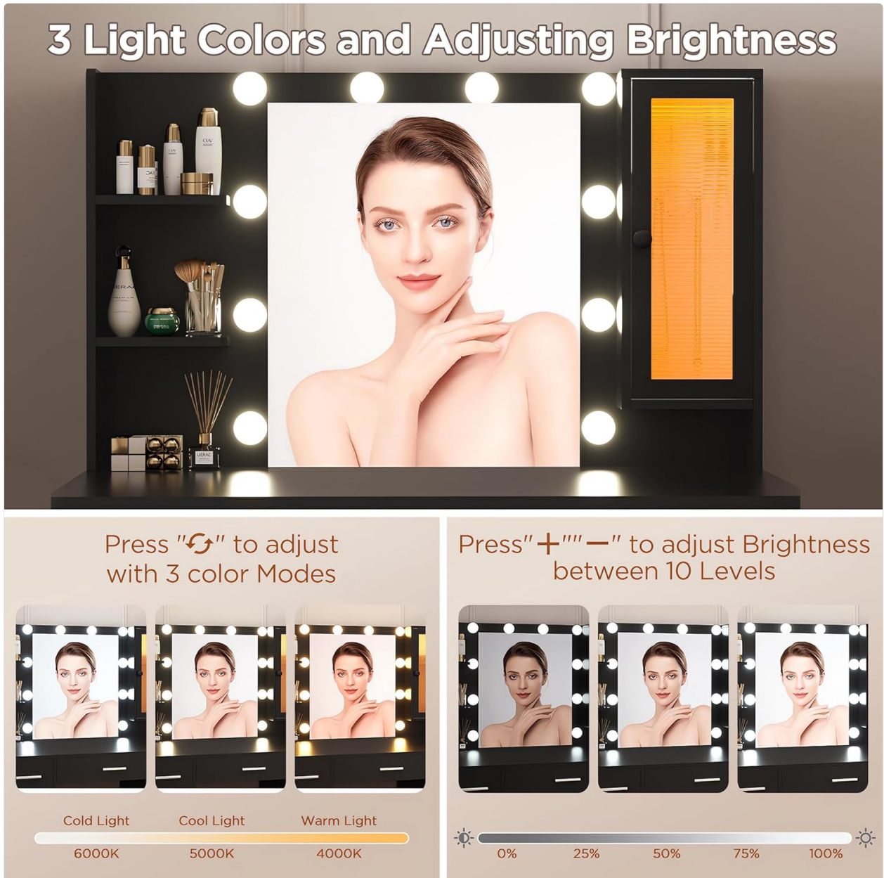
Image: LED Lighted Mirror Features. This image illustrates the three adjustable light color modes (Cold, Cool, Warm) and 10 brightness levels of the LED bulbs surrounding the mirror, controlled by a simple touch interface.

Carefully place the mirror into its designated slot. Attach the LED bulbs (Q) around the mirror and connect them to the power supply (O) using screws (F).