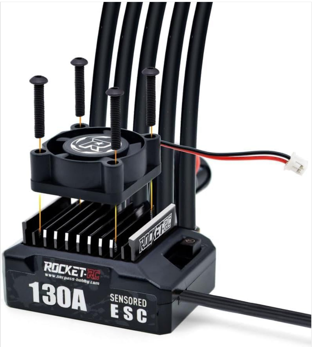
Image 8.1: An exploded view demonstrating the removable cooling fan, which facilitates cleaning and maintenance of the heatsink.