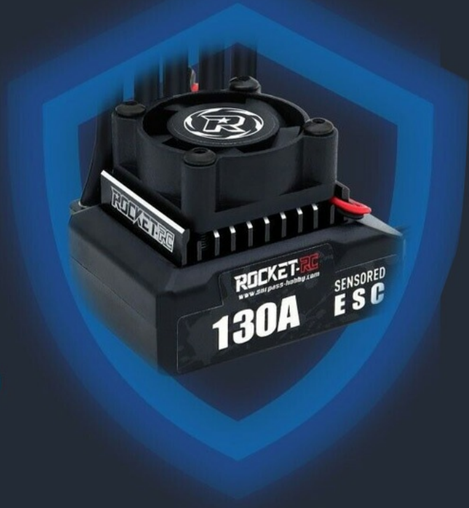
Image 3.3: The ESC features a high-performance removable cooling fan and an aluminum heatsink, designed for easy maintenance and improved durability.