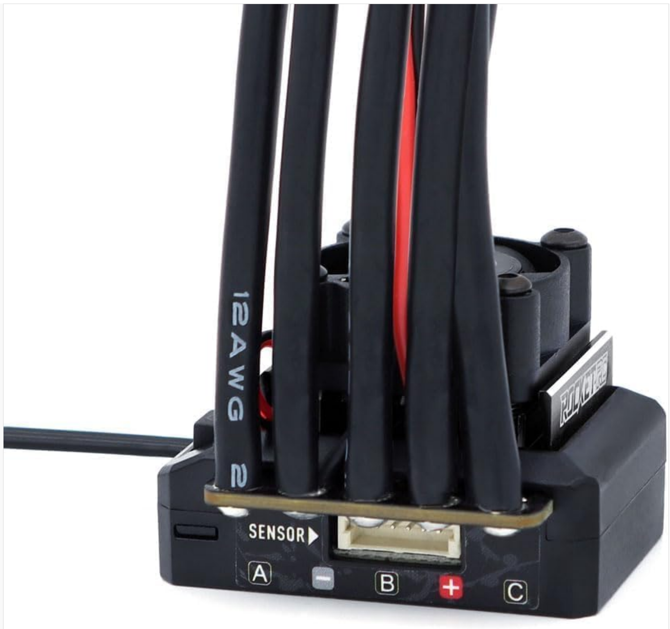
Image 6.1: Close-up view of the ESC showing the sensor port and motor phase connections (A, B, C).