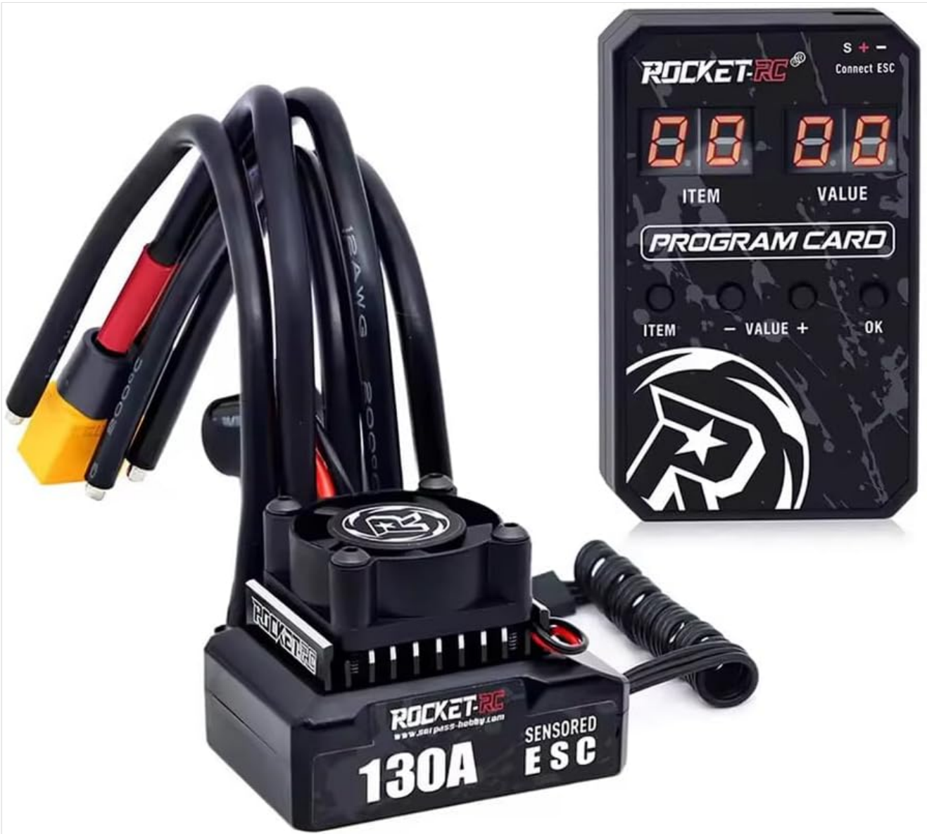
Image 4.1: The complete package including the 130A Sensored Brushless ESC and the Program Card.