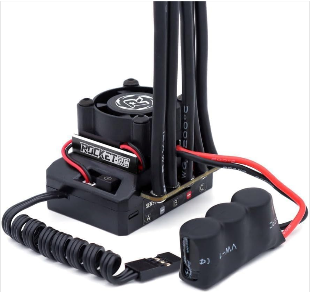
Image 6.2: The ESC connected with its capacitor pack and the receiver connection wire.