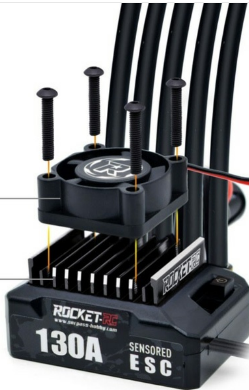
Image 3.1: Diagram illustrating the motor and ESC overheating protection features. This system helps prevent damage under high load conditions.