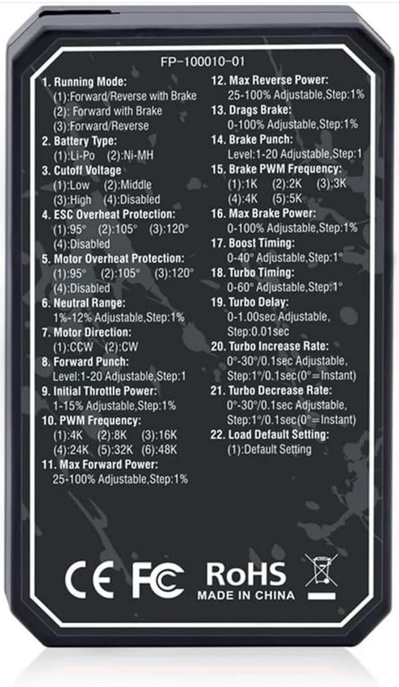
Image 7.2: The back of the Program Card detailing the list of adjustable parameters and their ranges, including Running Mode, Battery Type, Cutoff Voltage, Overheat Protection, Neutral Range, Motor Direction, and various throttle/brake settings.