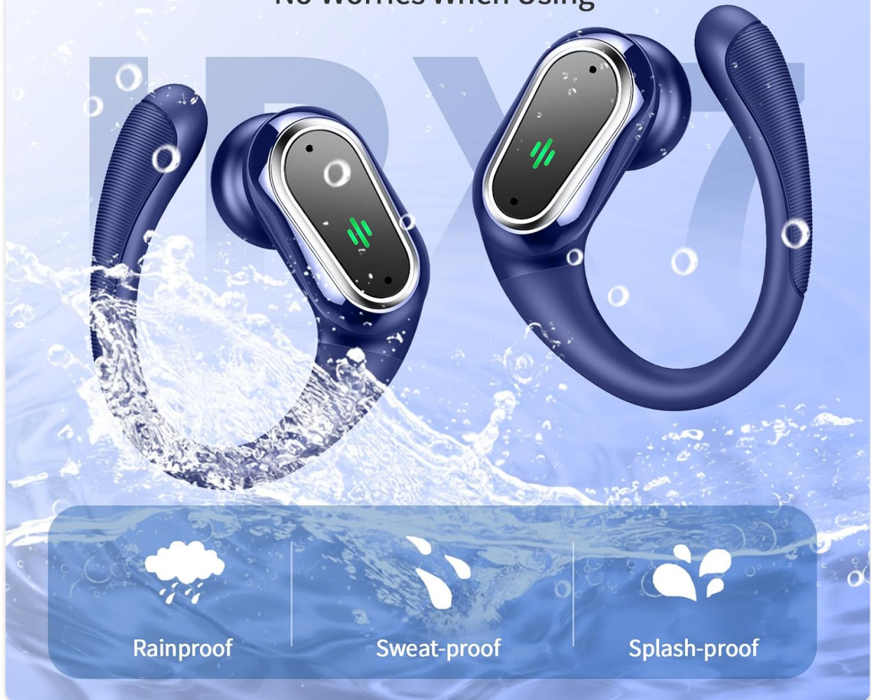
Image: Two Rolosar Q76 earbuds submerged in water, illustrating their IPX7 waterproof capability, with icons for rainproof, sweat-proof, and splash-proof features.