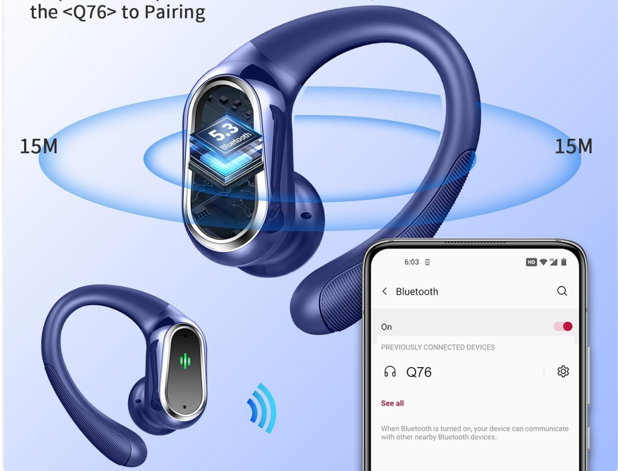
Image: A visual guide showing the one-step auto-pairing process for the Rolosar Q76 earbuds, with a smartphone screen displaying the 'Q76' device ready for connection.

Step1: Open the lid (Earbuds auto power on) Step2: After open the Phone Bluetooth, Click the <Q76> to Pairing