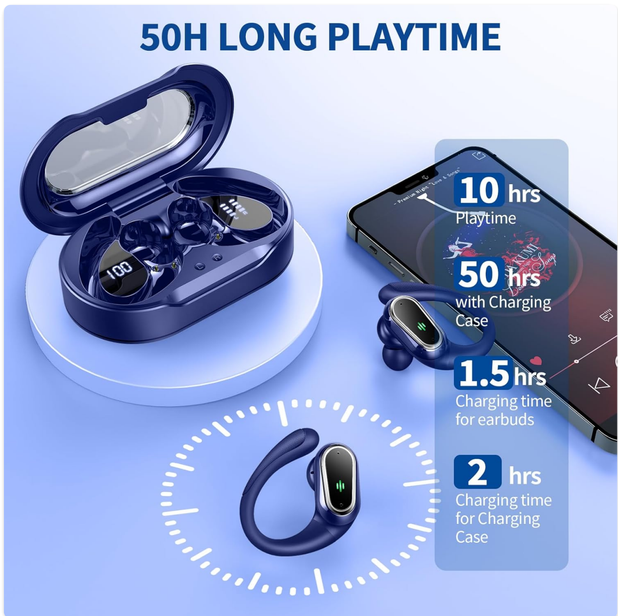
Image: The Rolosar Q76 charging case open, displaying the earbuds and their individual charge levels, along with the case's battery percentage on a dual LED screen.