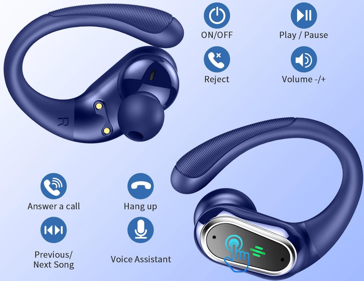
Image: An illustration detailing the smart touch control functions on the Rolosar Q76 earbuds, showing icons for play/pause, volume, call management, and voice assistant activation.

High-sensitivity smart touch brings easy operation