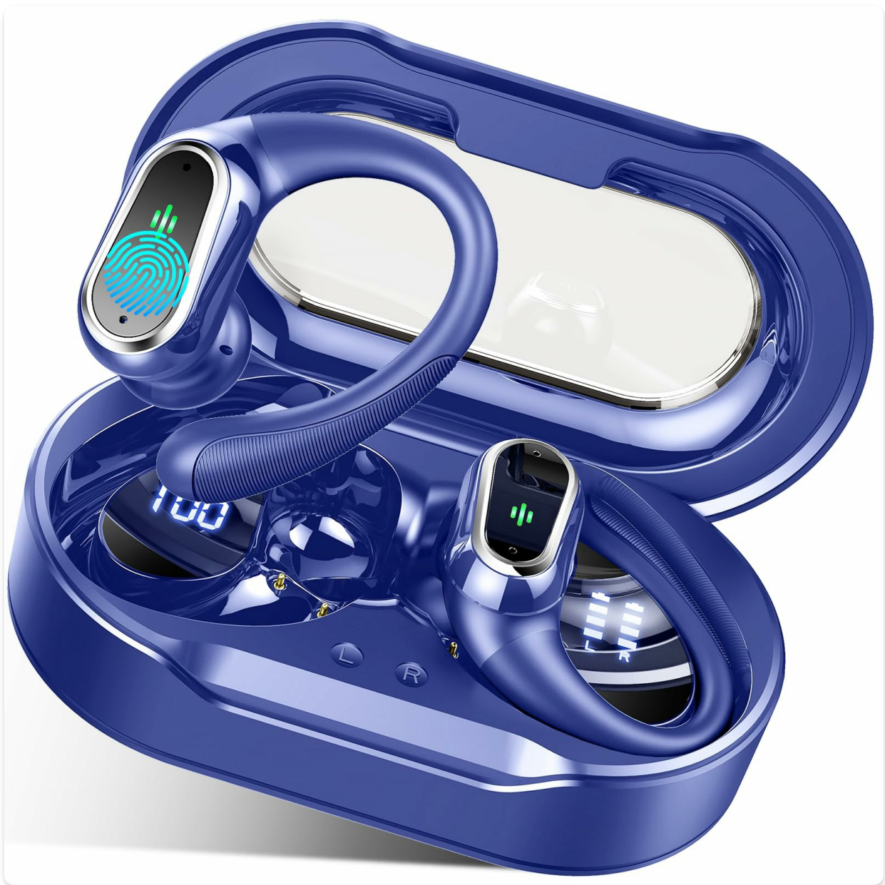
Image: Rolosar Q76 Wireless Earbuds in Gemstone Deep Blue, showcasing the sleek design and earhook feature.