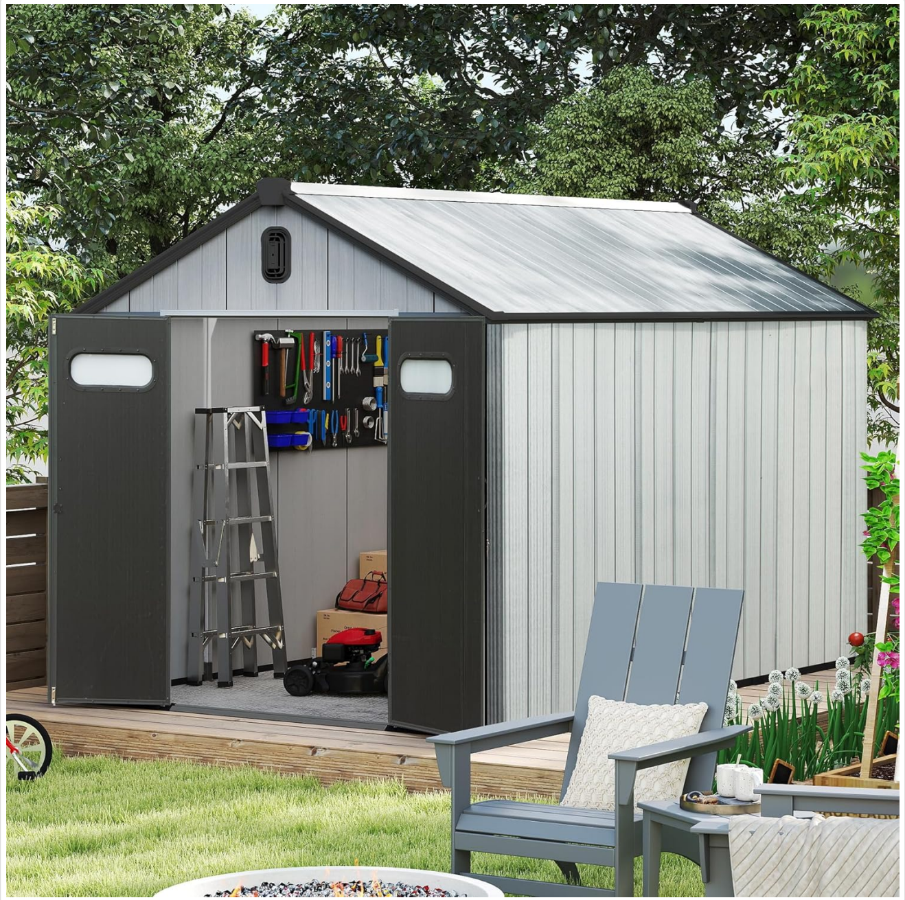
Image 2.1: The Domi 8x10FT Resin Outdoor Storage Shed with its double doors open, showcasing interior storage space and a ladder.