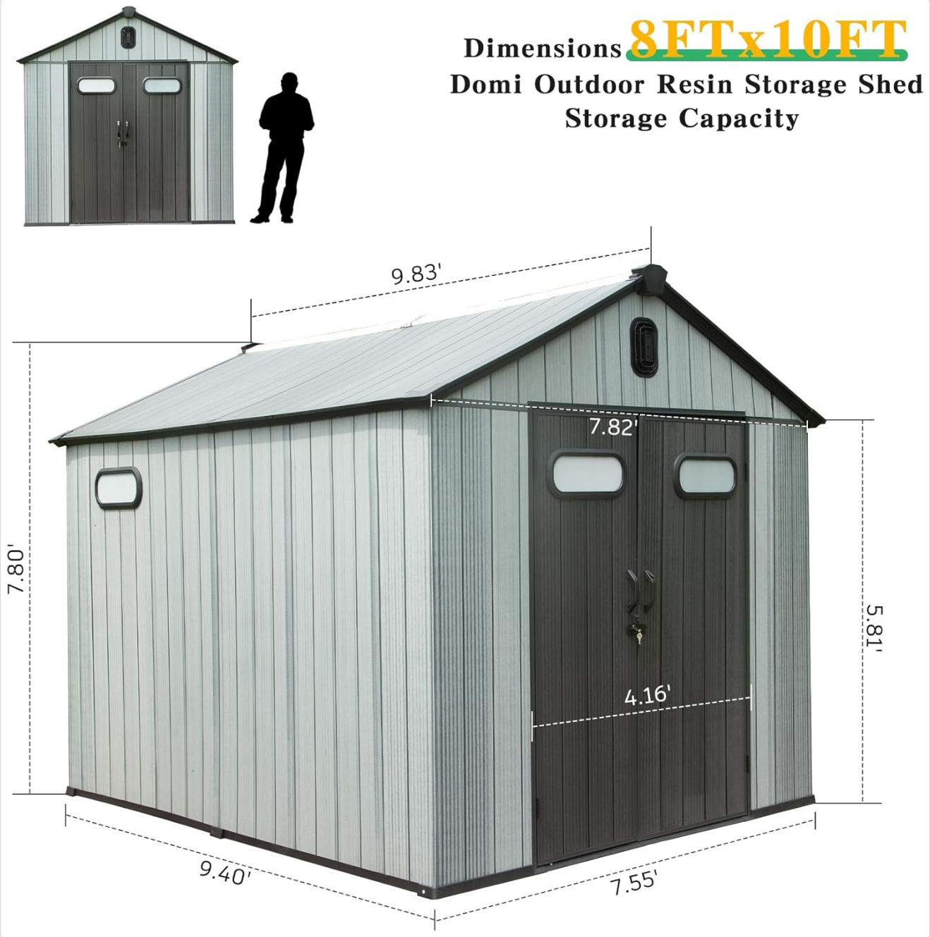
Image 3.1: Dimensional drawing of the Domi 8x10FT Resin Outdoor Storage Shed.