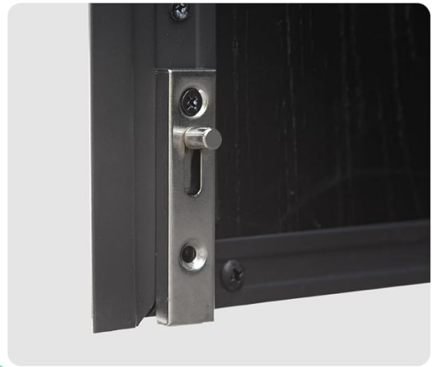
· Built-in Bolt · Keep safe and secure