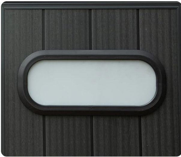
· Transparent Windows · Provide natural light