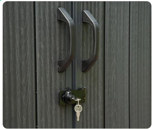
· Secure Door Lock · Guard your private property to prevent theft