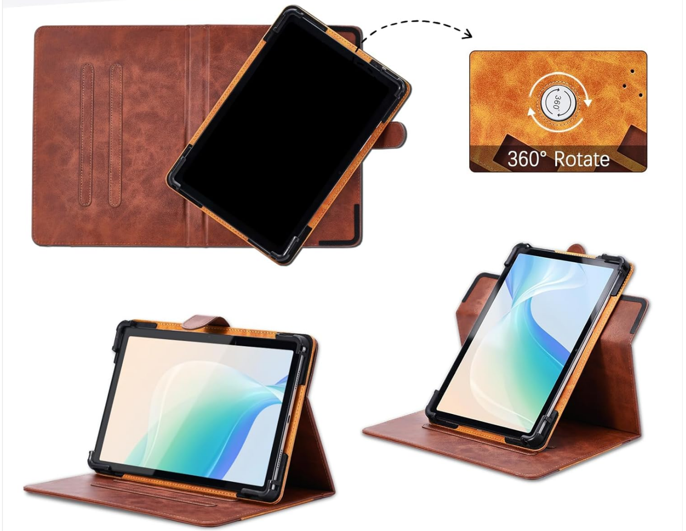
Image: An illustration demonstrating the 360-degree rotation feature of the tablet case, allowing for flexible viewing in both portrait and landscape orientations.

Supports multiple viewing angles with 360° free rotate