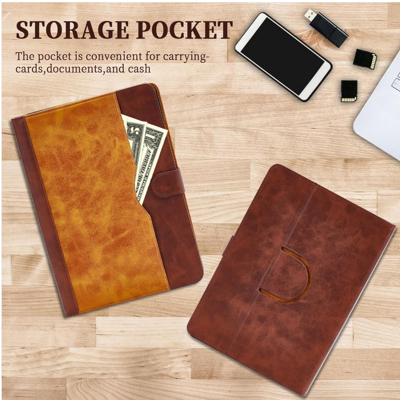
Image: The tablet case is shown with its integrated storage pocket open, revealing cash and cards stored inside, demonstrating its utility.

The pocket is convenient for carrying cards, documents, and cash