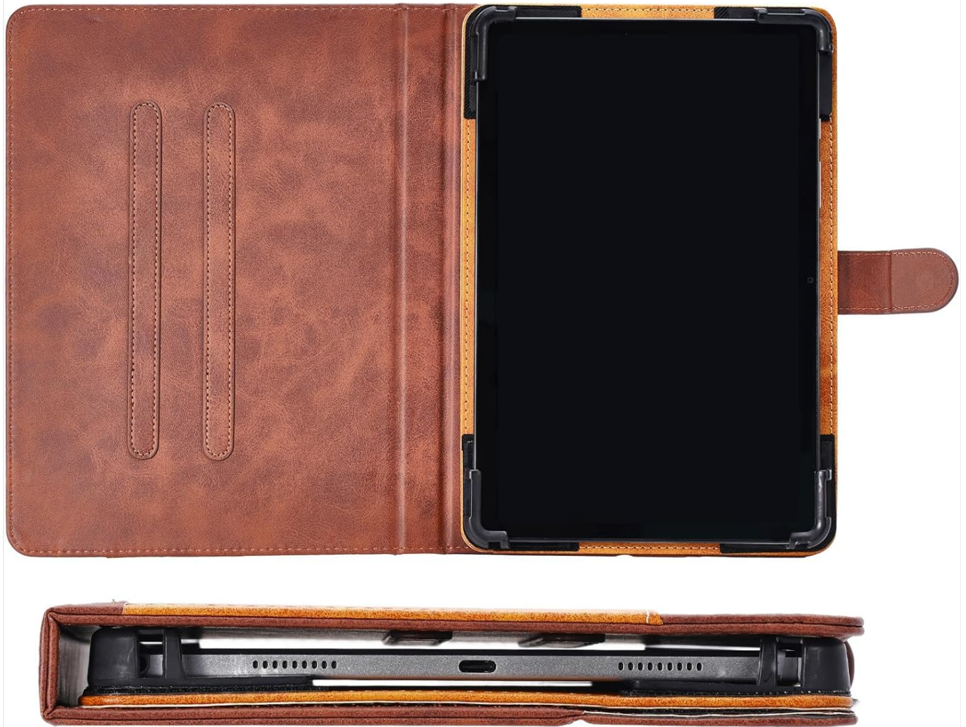
Image: A G-Tide Gtide V1 tablet is shown securely fitted into the brown Kinetijy folio case, with a clear view of the tablet's side profile and accessible ports.

Please kindly check your tablet size before purchase as shown