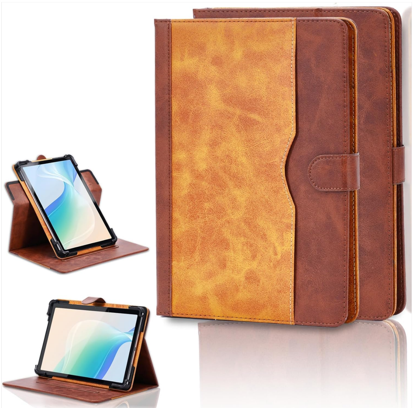
Image: The Kinetijy G-Tide Gtide V1 Tablet Case in brown, displayed both in its closed state and open with a tablet positioned in its integrated stand.