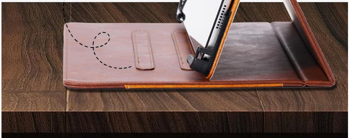
Image: The tablet case is shown in a standing position, with a close-up view of the anti-slip strip designed to provide stable support for various viewing angles.