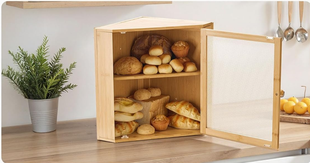
Image 5.1: The bread box featuring its wave acrylic door panel, which allows visibility of contents and adds to its aesthetic.