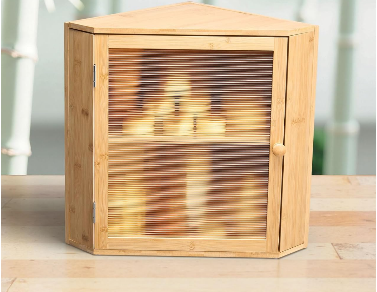
Image 3.3: Highlights the natural bamboo wood material, emphasizing its sturdy, waterproof, shock-resistant, and ventilated properties.