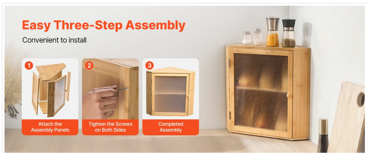
Image 4.1: Visual guide for the easy three-step assembly process: 1. Attach the Assembly Panels, 2. Tighten the Screws on Both Sides, 3. Completed Assembly.