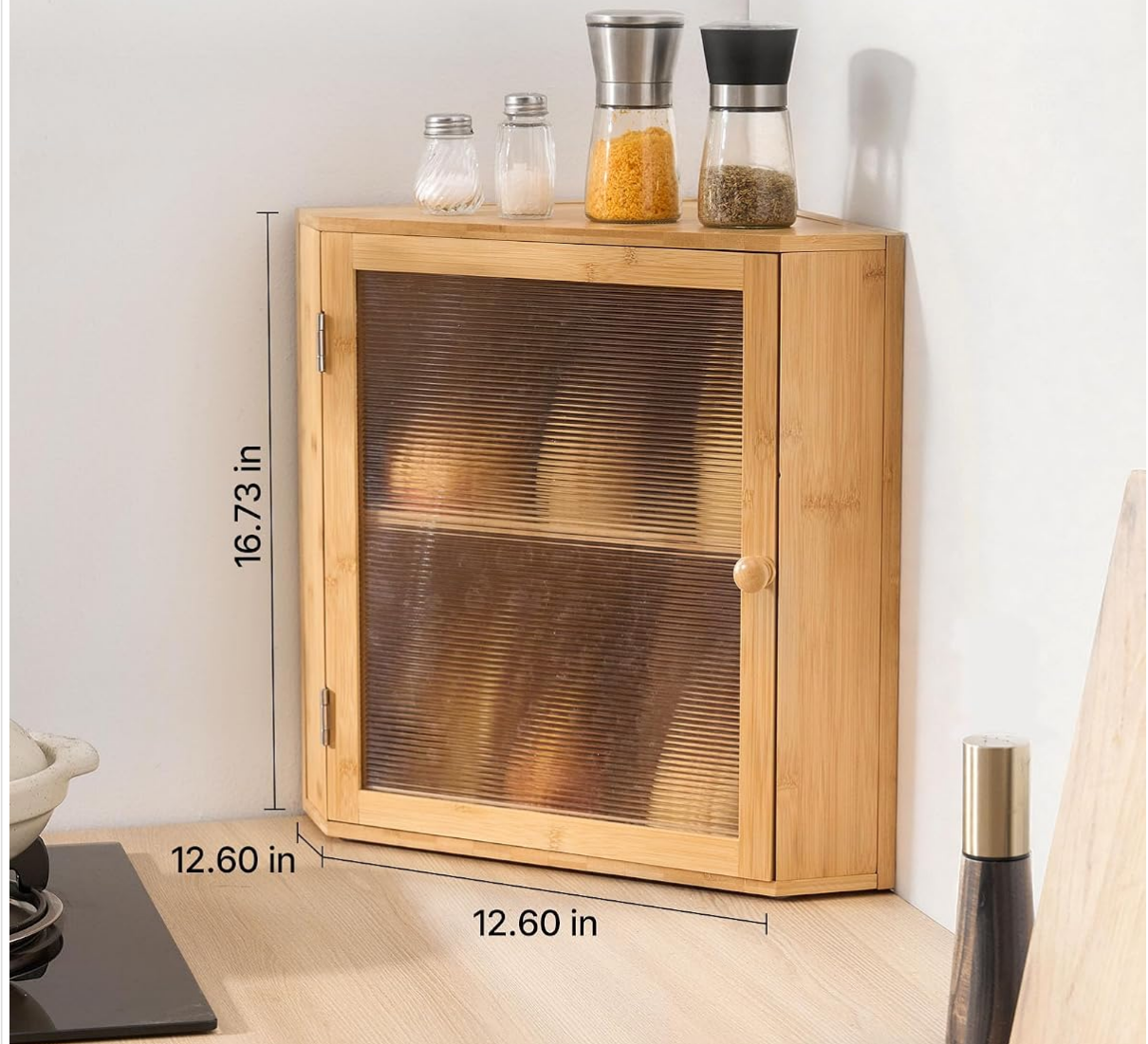
Image 3.1: VEVOR Corner Bread Box showcasing its dimensions (12.60 in x 12.60 in x 16.73 in) and corner-fitting design.

Smart use of corners for storing bread and other items