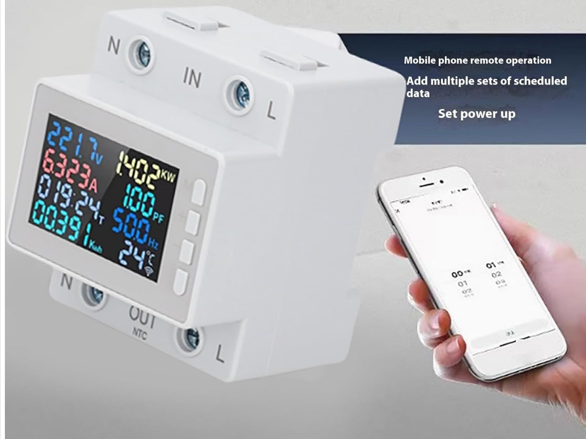
Figure 8: The mobile application's "Timing switch" function, allowing users to add multiple sets of scheduled data for power-up or power-off.