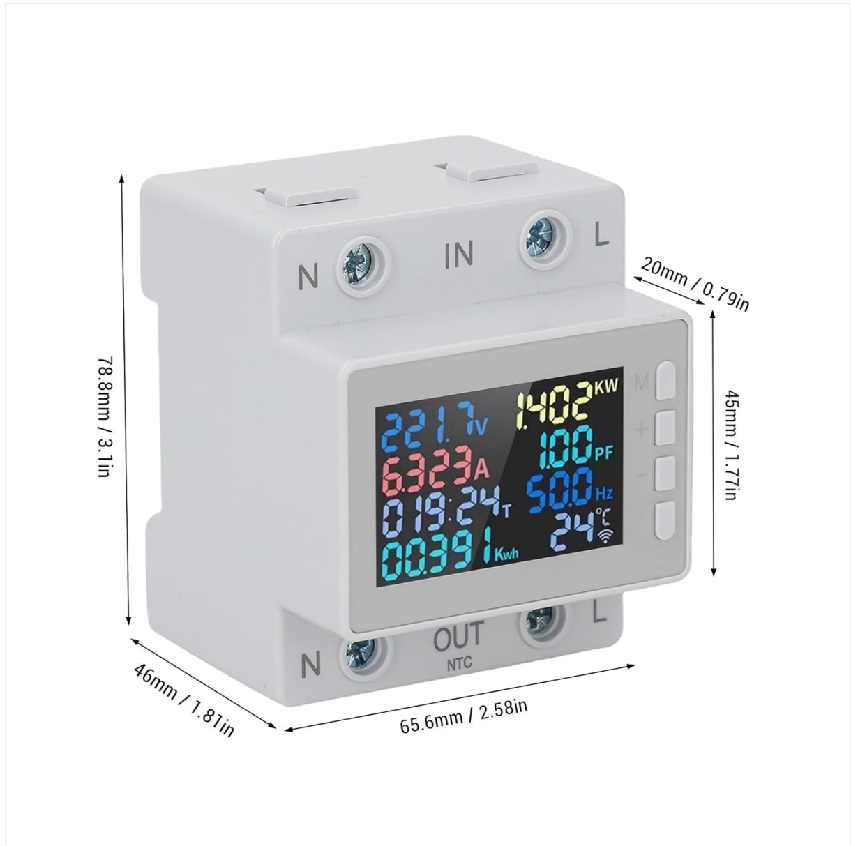
Figure 4: Dimensional drawing of the KWS-302WF Energy Meter.