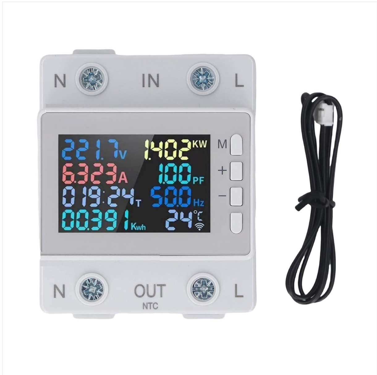
Figure 1: Front view of the KWS-302WF Energy Meter. The display shows voltage (V), current (A), power (KW), energy (KWh), power factor (PF), frequency (Hz), and temperature (°C). Input terminals (IN) and output terminals (OUT) are labeled N and L. Control buttons are on the right side. An NTC temperature sensor cable is also shown.

Below is an illustration of the KWS-302WF energy meter, highlighting its main components and display.