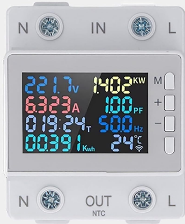
Figure 5: The meter's display features power-off memory, a high-definition color screen, and high-precision multi-display capabilities.