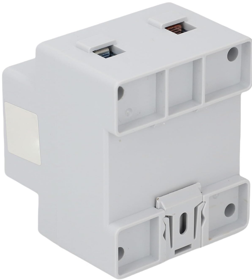
Figure 3: Side and bottom view of the KWS-302WF meter, illustrating the integrated clip for DIN rail mounting.