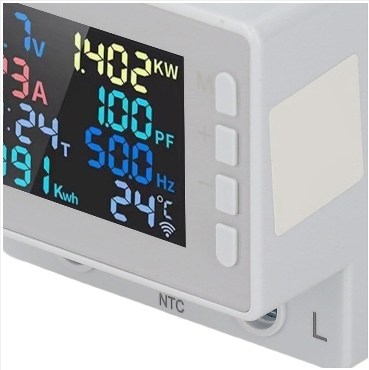
Figure 2: Close-up view of the meter's display, showing detailed readings and the three control buttons (+, M, -) on the right side.