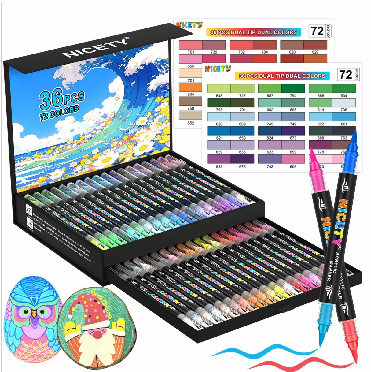
A detailed view of a NICETY dual-tip acrylic paint marker, highlighting its flexible brush tip, transparent ink window, and the recommended 'Shake & Paint' preparation steps for consistent ink flow.