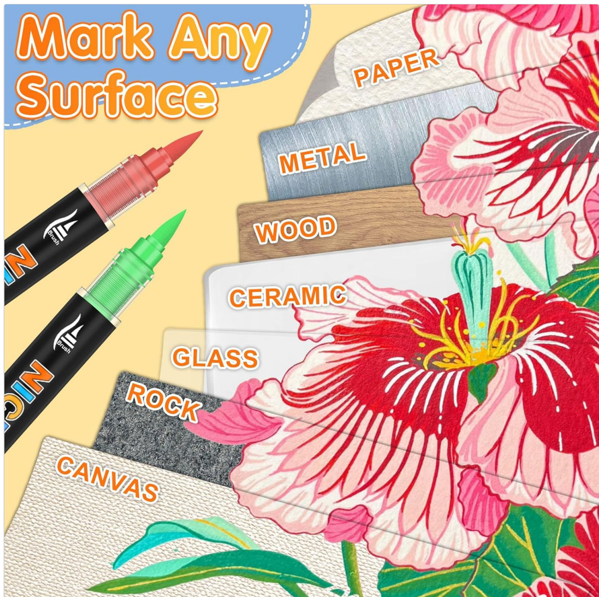
Illustration demonstrating the versatility of NICETY acrylic markers on diverse materials, including paper, metal, wood, ceramic, glass, rock, and canvas.