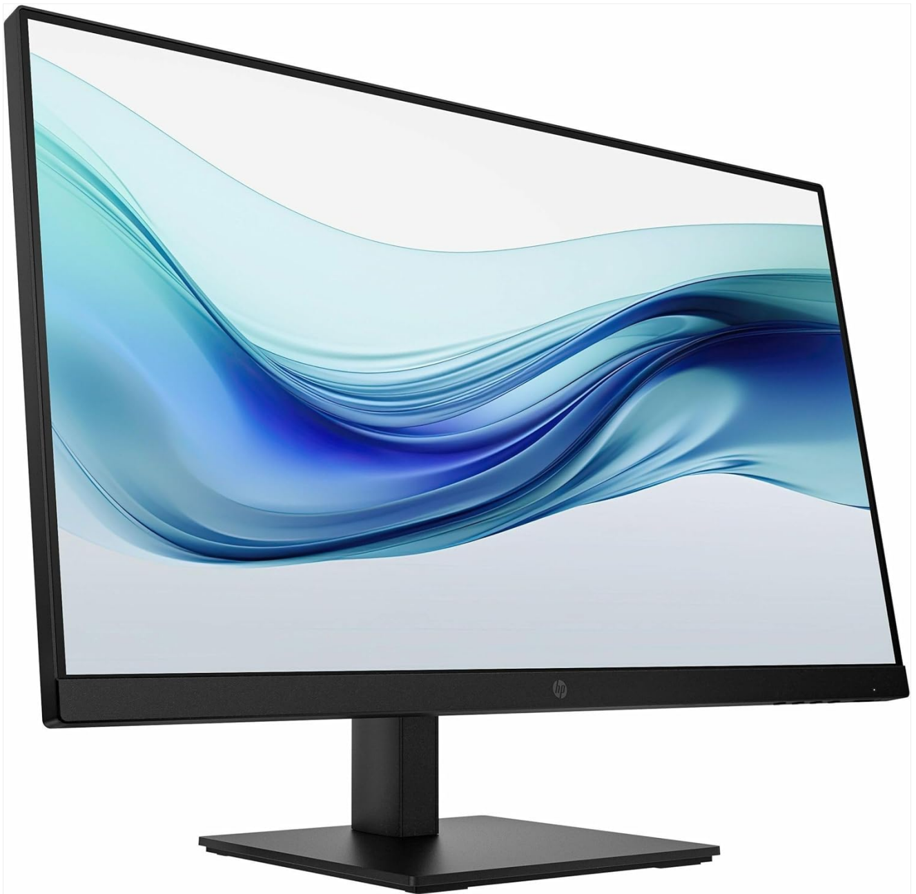
Figure 1.1: Front angled view of the HP 324pe monitor, showcasing its slim bezels and stand.