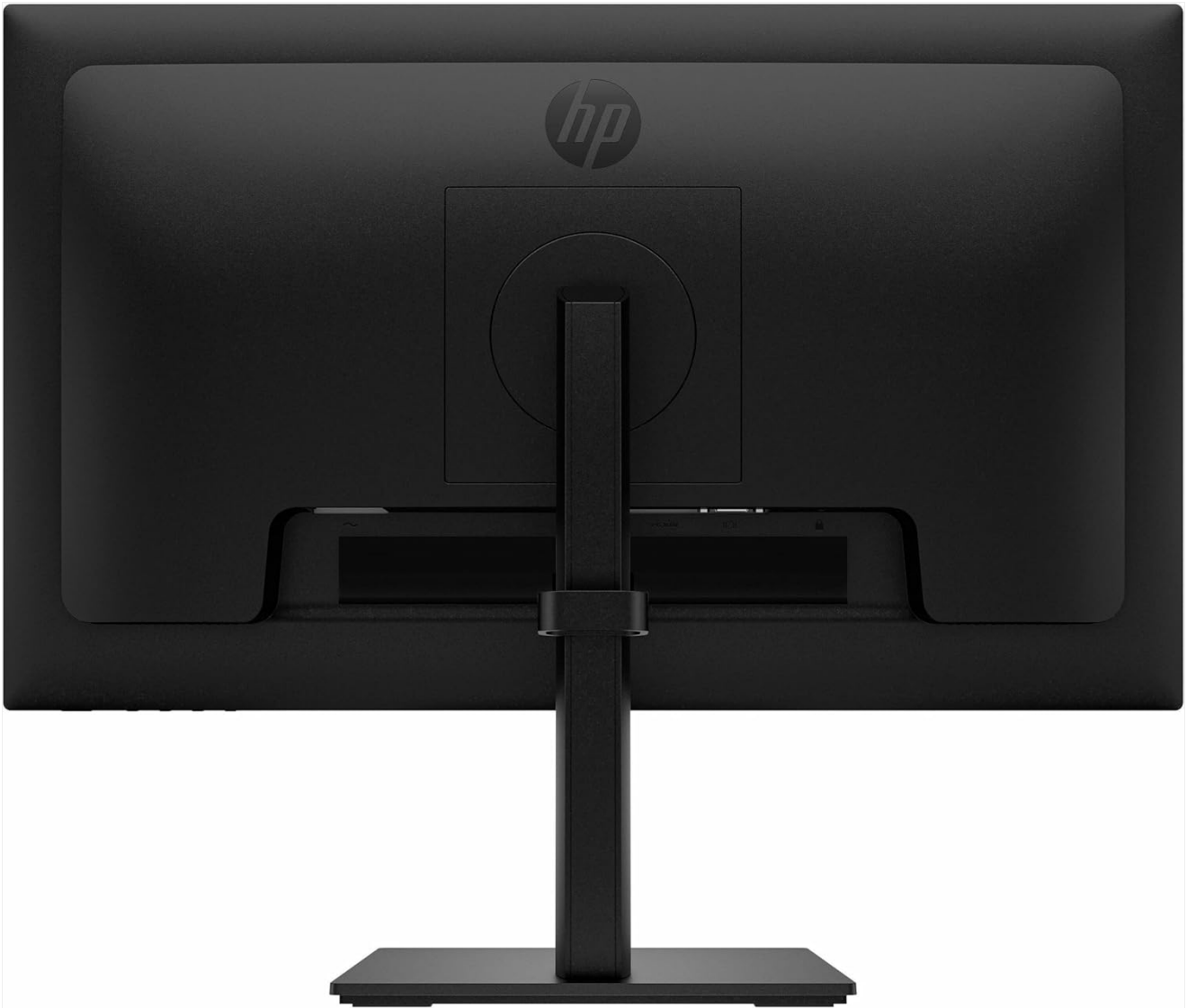
Figure 3.1: Rear view of the HP 324pe monitor, showing the stand attachment point and input ports.

attach the assembled stand to the back of the monitor panel. Ensure all connections are secure.