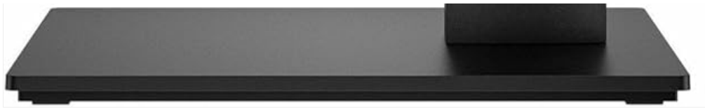
Figure 3.2: Side view of the HP 324pe monitor, illustrating its adjustable stand for ergonomic positioning.