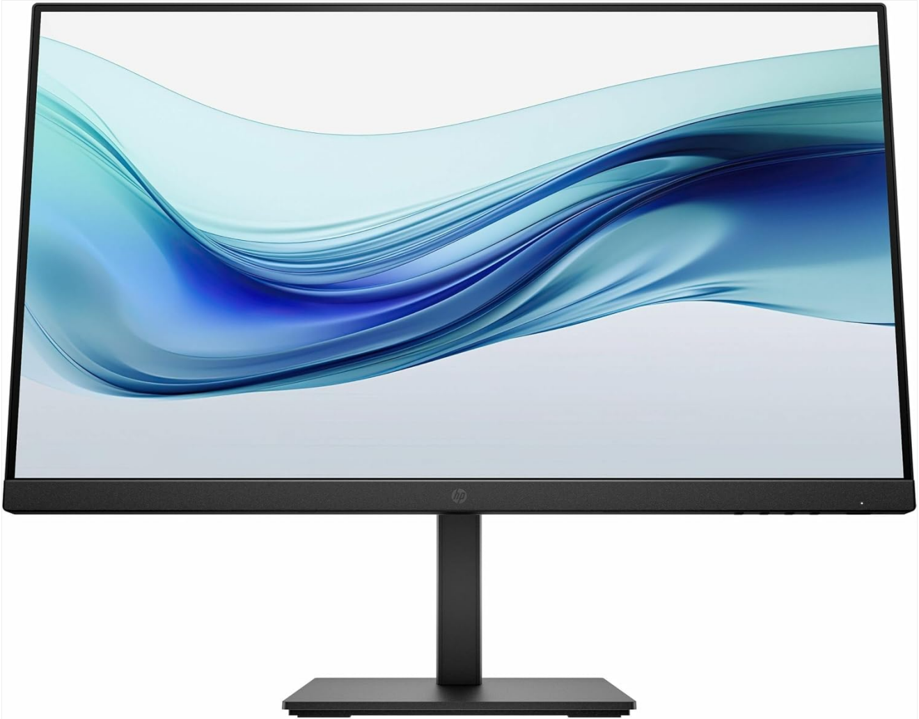
Figure 5.1: Front view of the HP 324pe monitor, highlighting its borderless design and integrated HP logo.