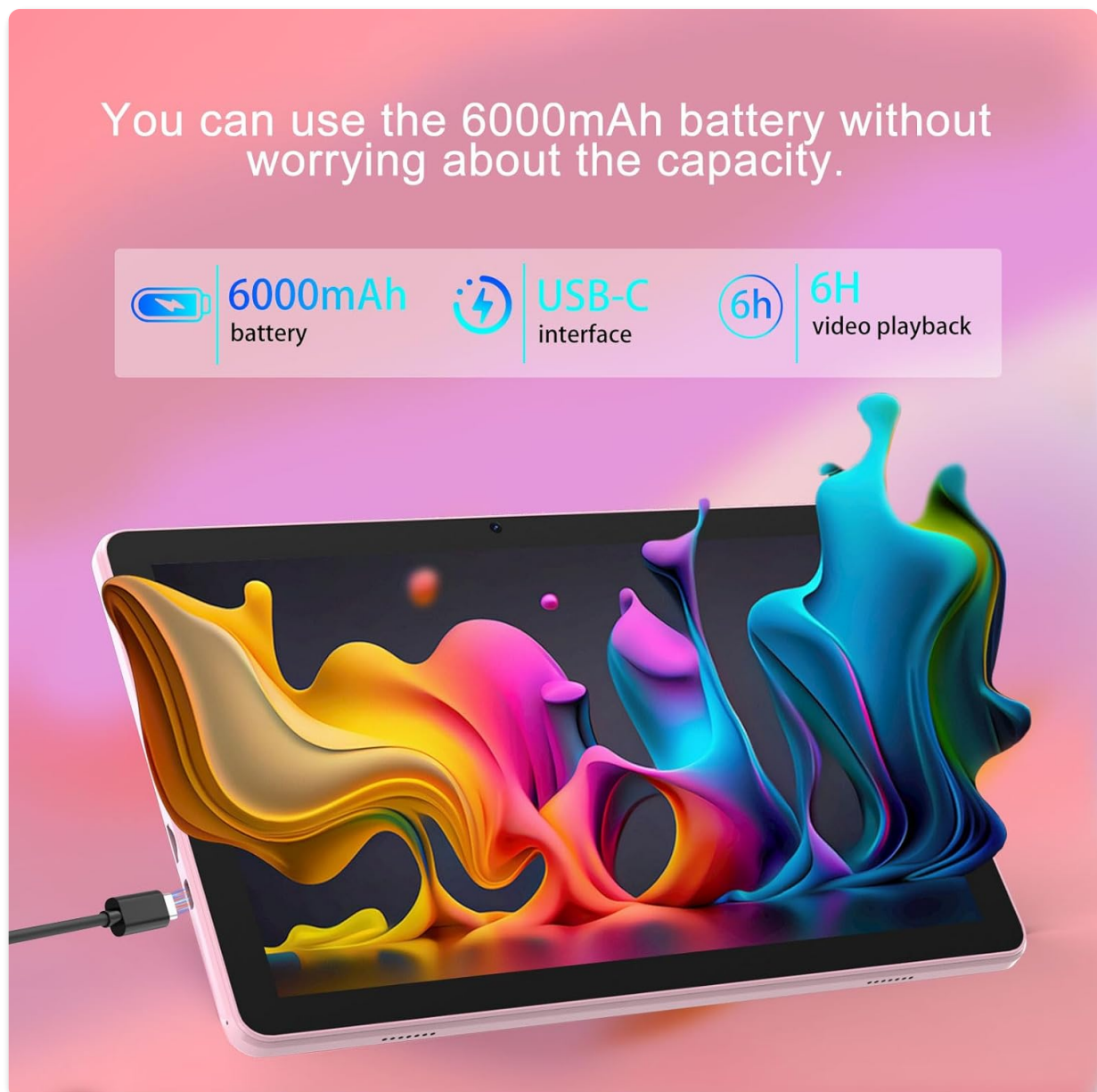
Figure 2: Labeled diagram of the Bnegyng Android 15 Tablet's external features.

Familiarize yourself with the physical components of your tablet: