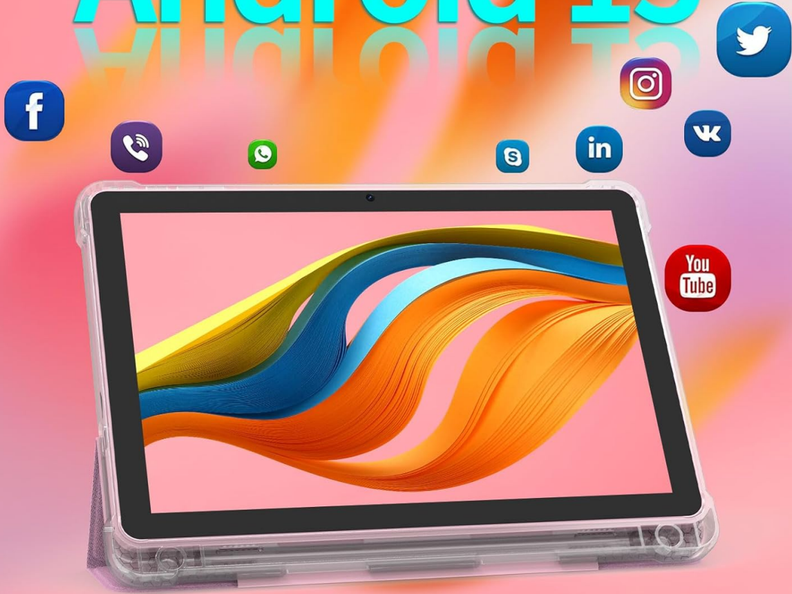
Figure 1: Bnegynng Android 15 Tablet with its operating system interface.