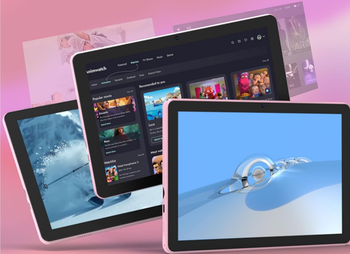
Figure 5: Tablet screen showing high-definition video streaming.