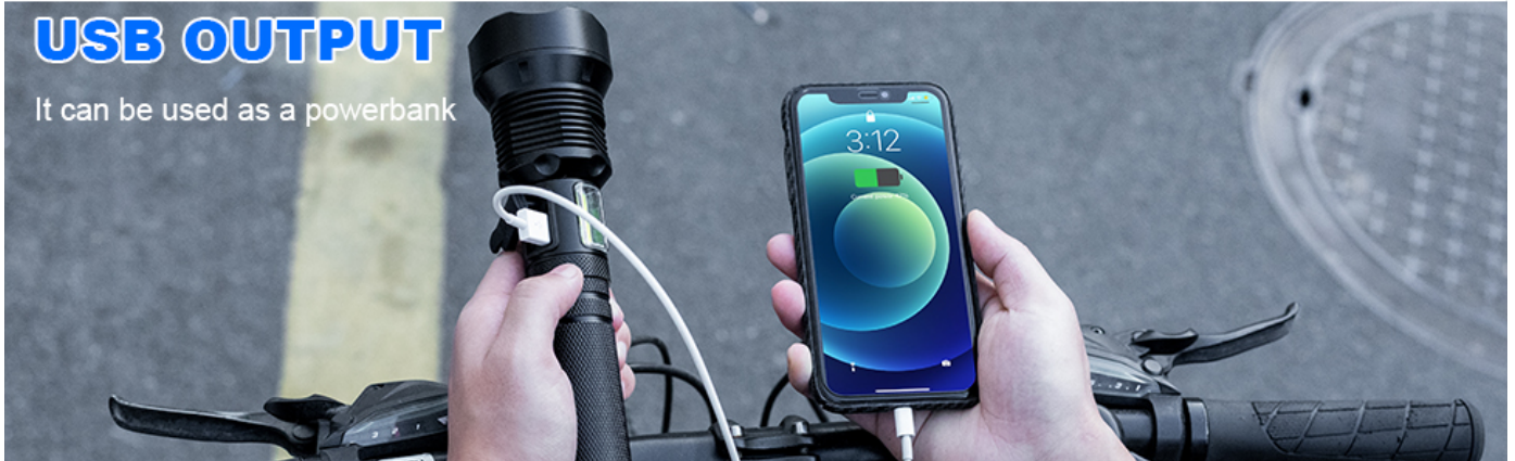
Image: The flashlight's USB output port being used to charge a smartphone, highlighting its power bank capability.