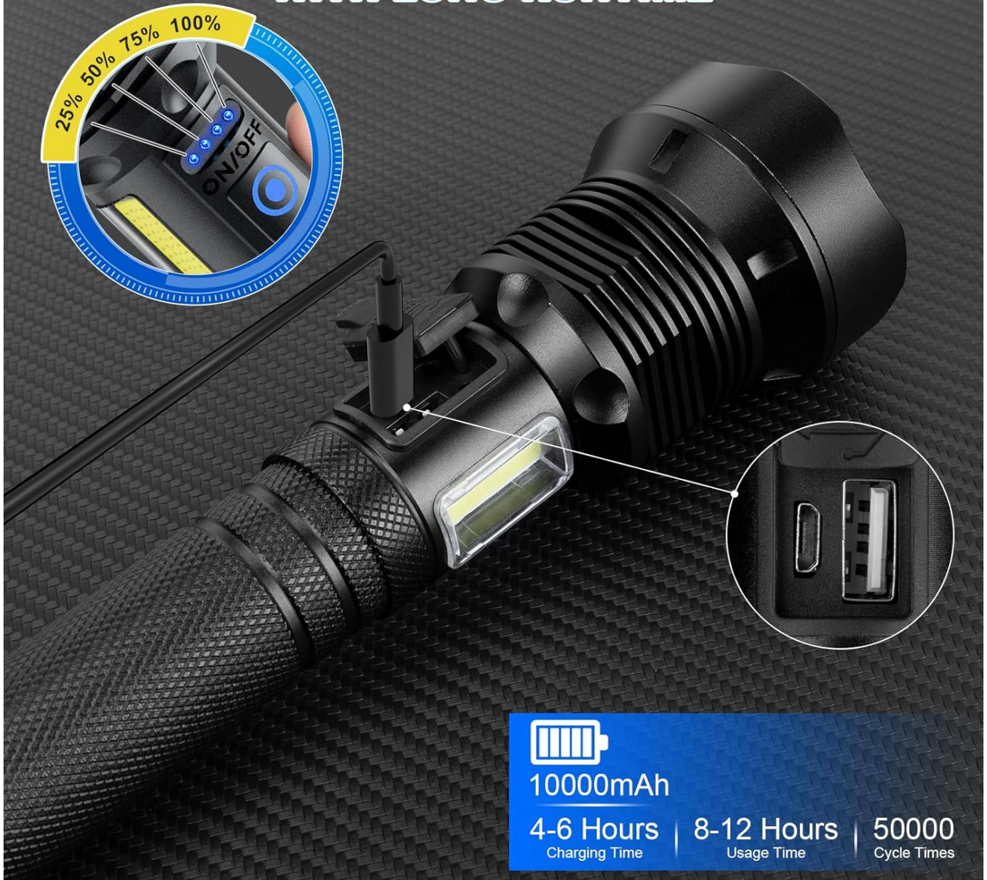
Image: The flashlight being charged via USB, with the power display showing battery level. Charging typically takes 4-6 hours.