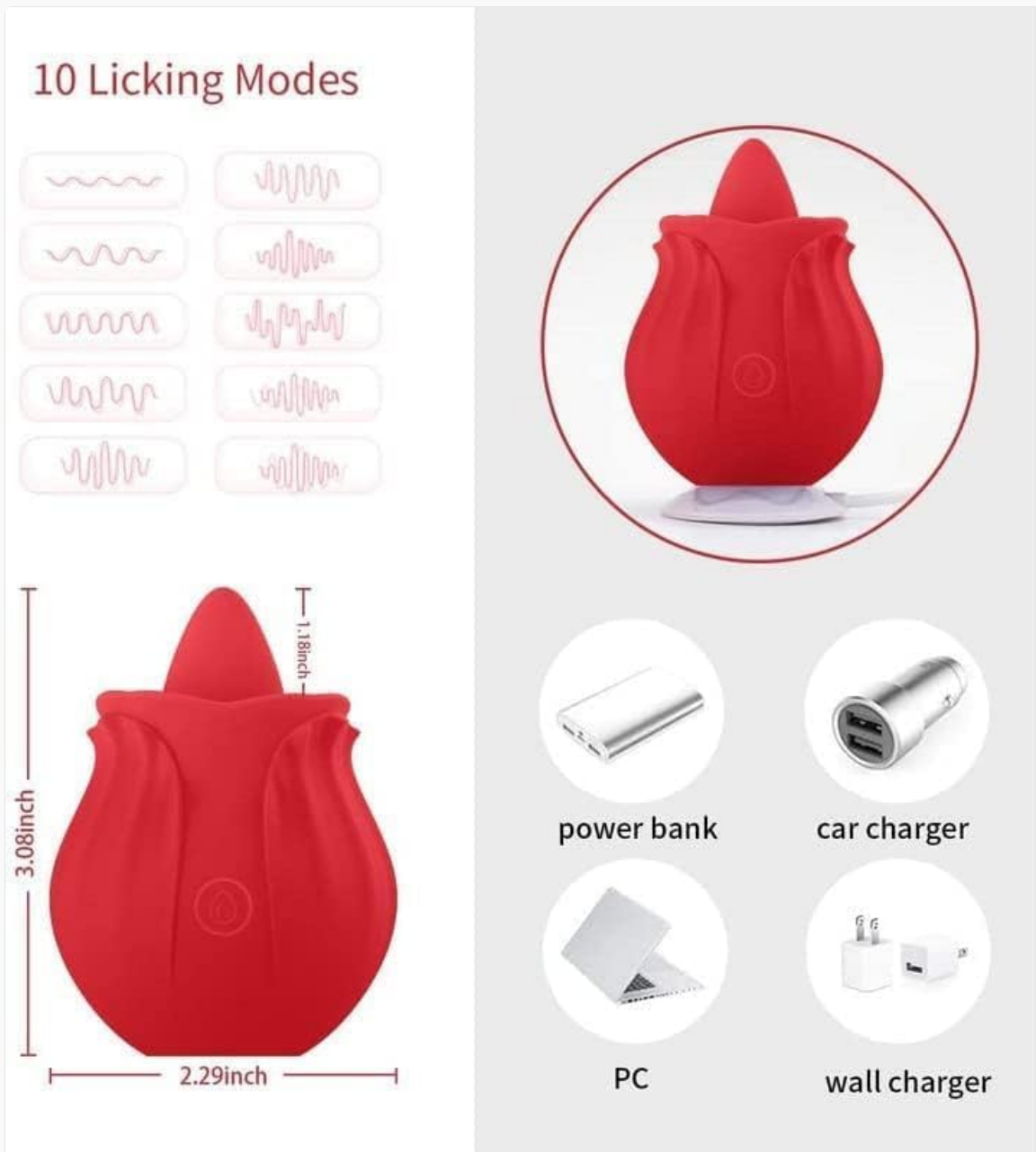
Figure 3: Illustration of the 10 distinct vibration patterns.