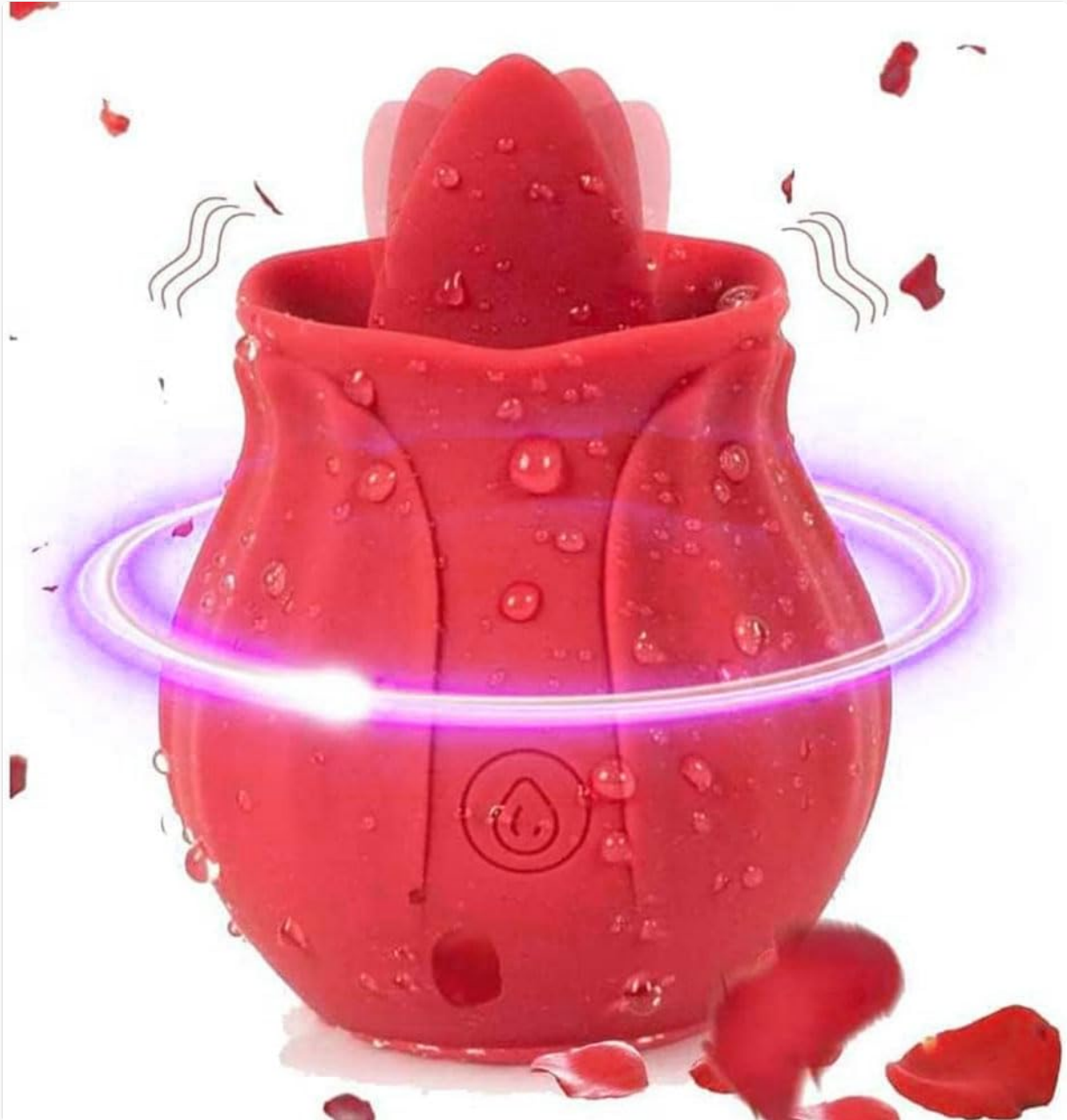
Figure 1: Front view of the VK5028 Rose Stimulator, showing the rose-shaped head and control button.

Refer to the image below for a visual representation of the device.