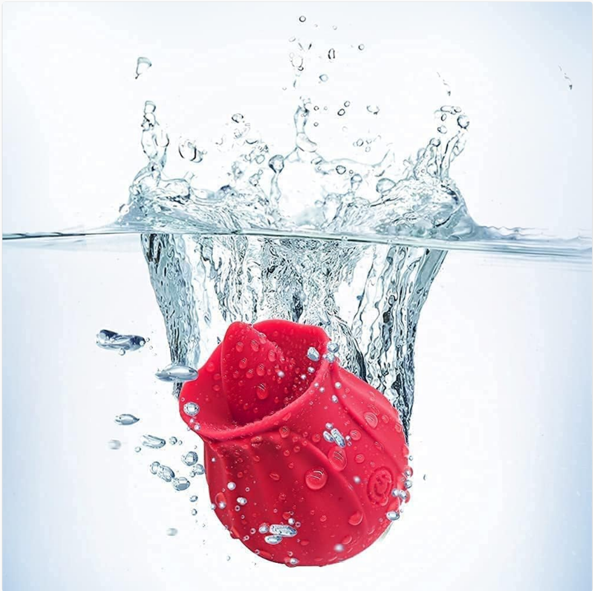
Figure 4: The VK5028 Rose Stimulator demonstrating its waterproof design during cleaning.