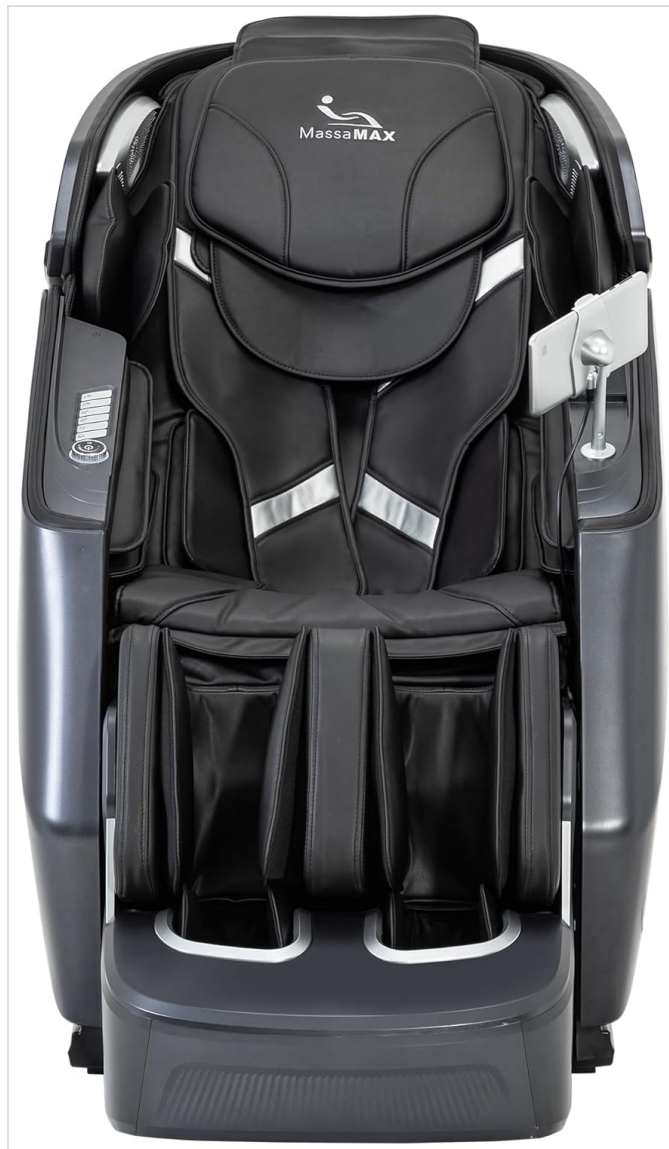
Image 7.1: Front view of the MassaMAX A675 Massage Chair, showcasing its design and features.