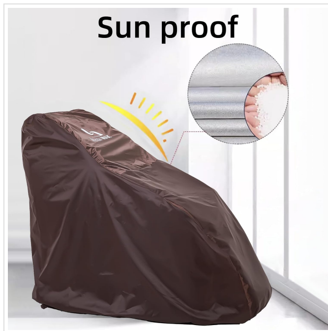
Image 3.2: The sun-proof material of the protective cover, designed for durability and protection.