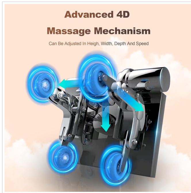
Image 4.1: Diagram illustrating the adjustable range and flexibility of the i-OPEN SL Track.