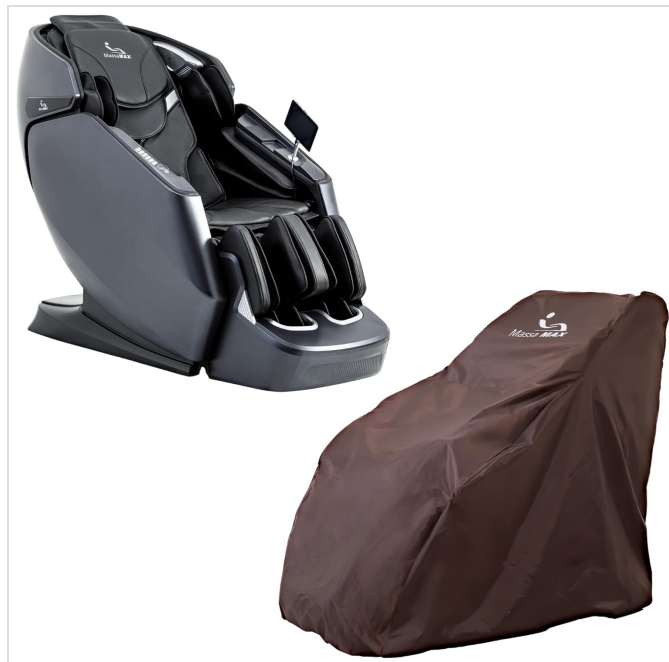
Image 1.1: The MassaMAX A675 Massage Chair and its accompanying protective cover.

The MassaMAX A675 massage chair is designed to provide a comprehensive and customizable massage experience, featuring advanced technologies such as 4D massage, an i-OPEN FLEXIBLE SL Track, and full-body airbag compression. The included cover helps protect your investment from dust and wear.