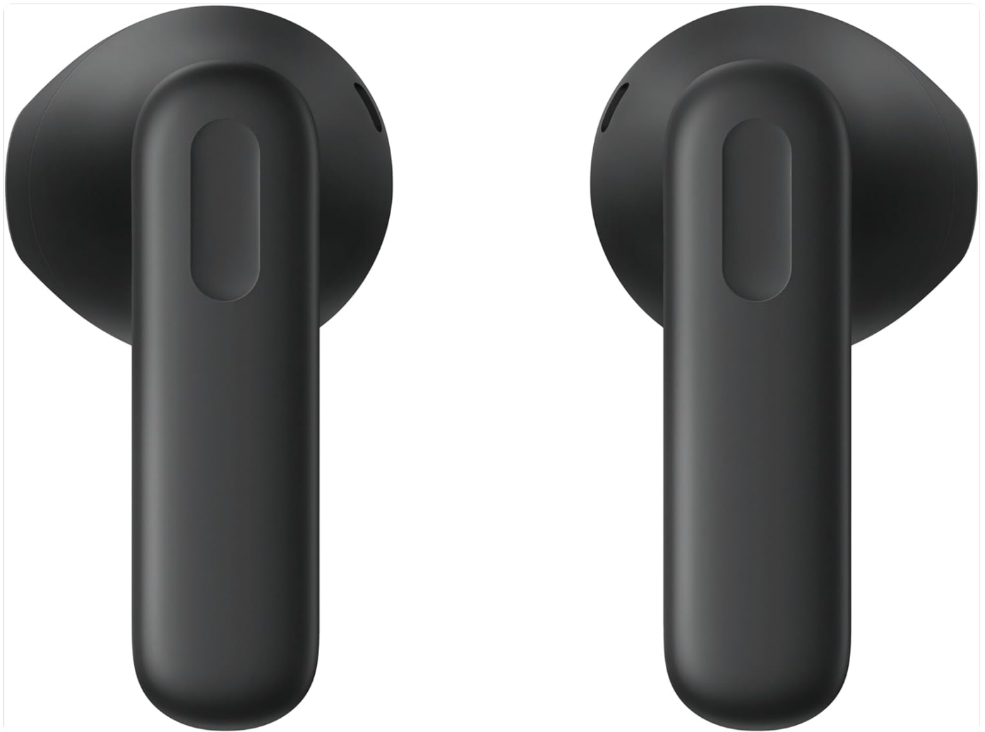
Image: Side view of two individual OPPO Enco Buds3 earbuds, highlighting their ergonomic design.