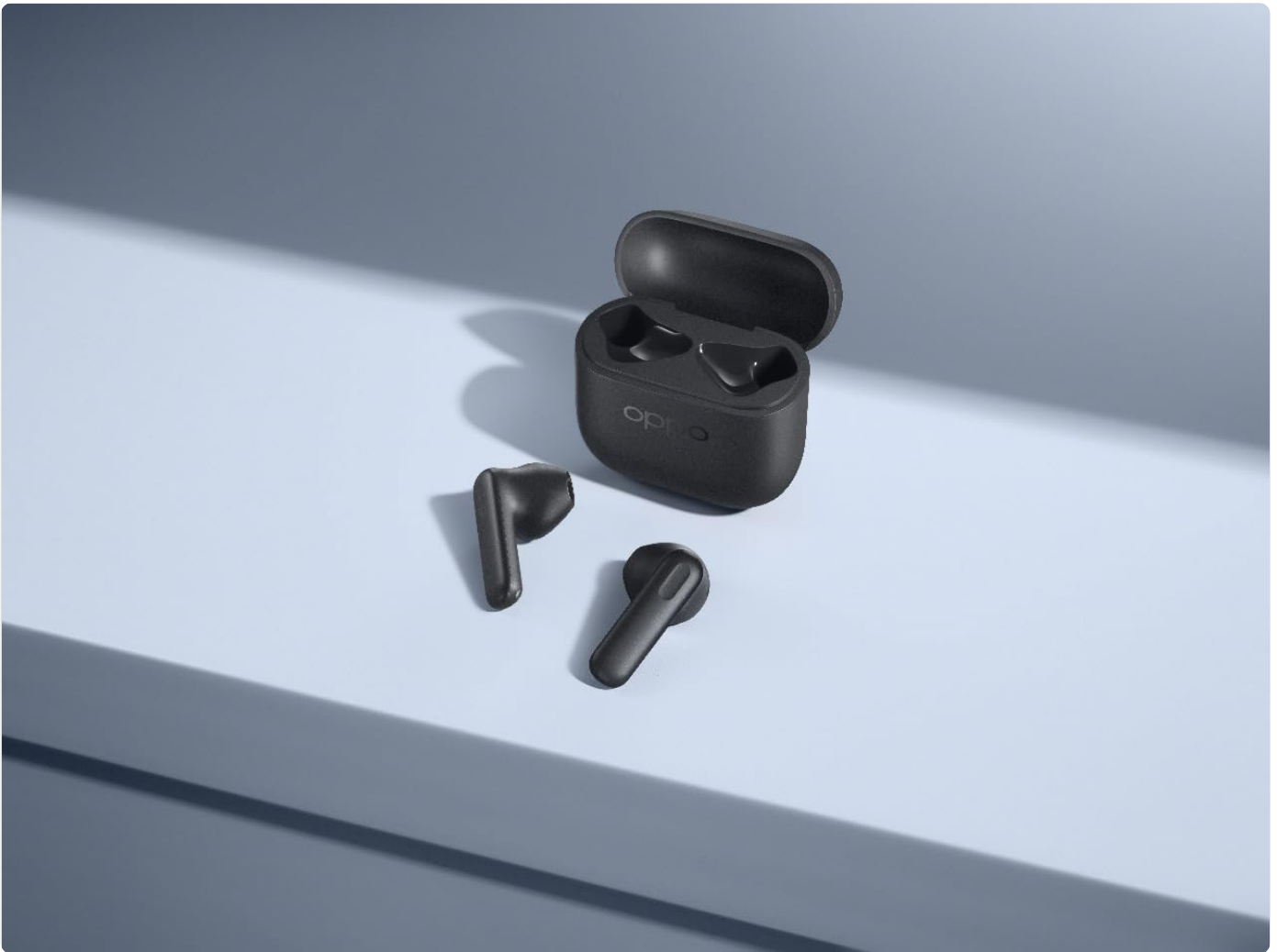
Image: OPPO Enco Buds3 earbuds and charging case, illustrating the contents of the package.