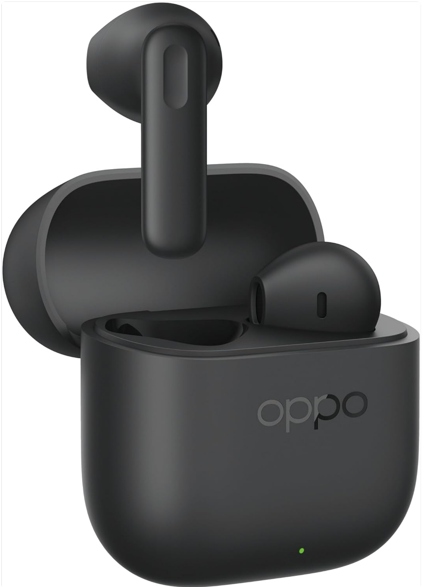
Image: Front view of the OPPO Enco Buds3 earbuds placed inside their open charging case, showing the 'oppo' branding on the case.