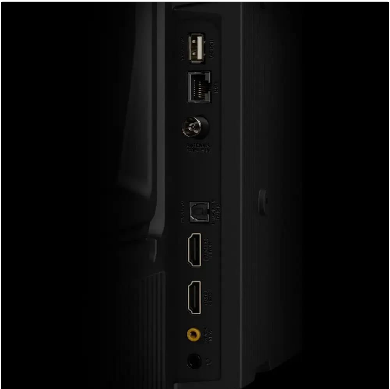
Figure 4.3: Detailed view of the side-mounted input ports on the TCL 32Q3K, illustrating the various connectivity options available for external devices.