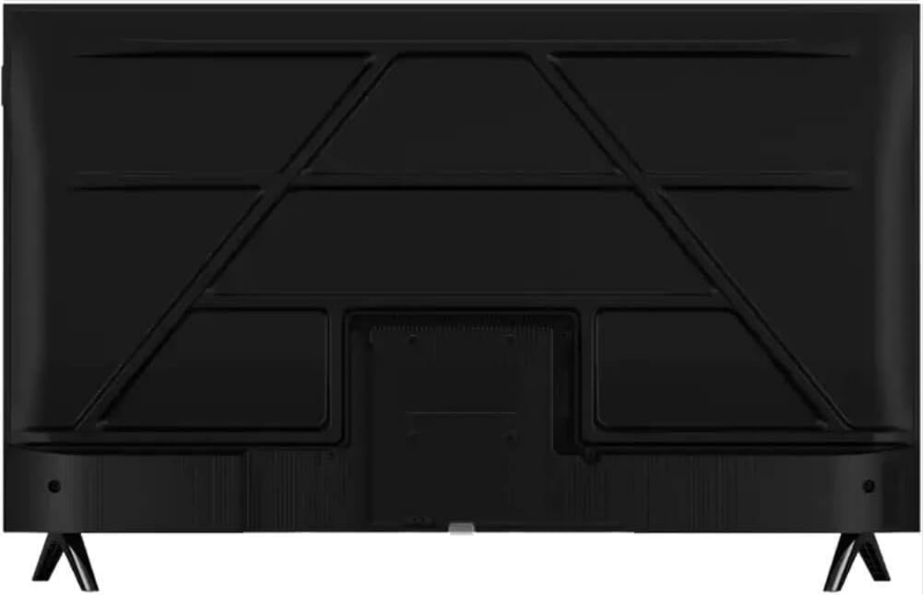
Figure 4.2: Rear panel of the TCL 32Q3K TV, highlighting the VESA mounting points for wall installation and the layout of the input/output ports.