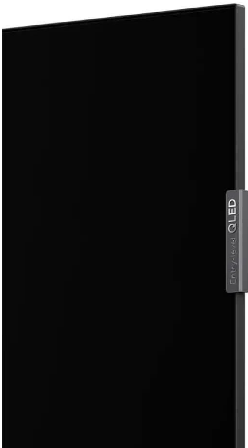
Figure 8.1: The 'Entry-level QLED' branding on the side of the television, indicating its display technology.