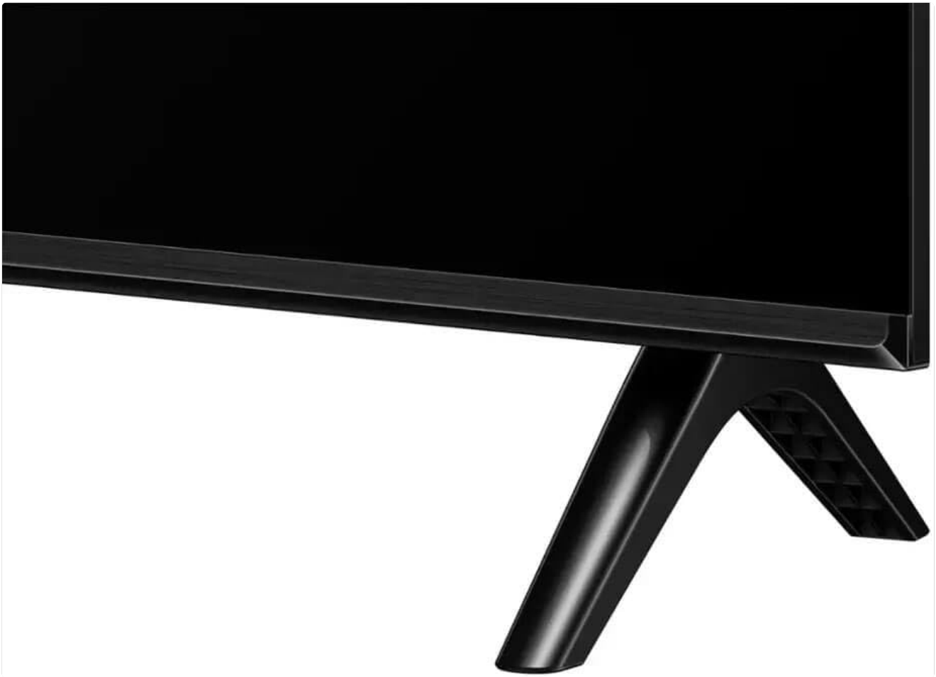
Figure 4.1: Detail of the TV stand attachment point, showing how the stand connects to the television's base.