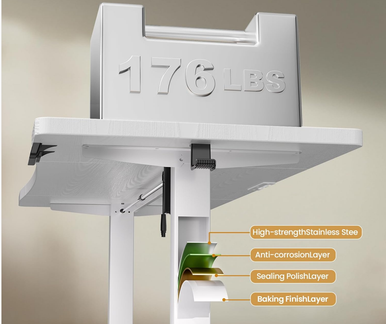
Image 2.1: Illustration of the desk's robust construction, indicating an ultra-high load-bearing capacity of 176 lbs and detailing the high-strength steel, anti-corrosion, sealing polish, and baking finish layers.