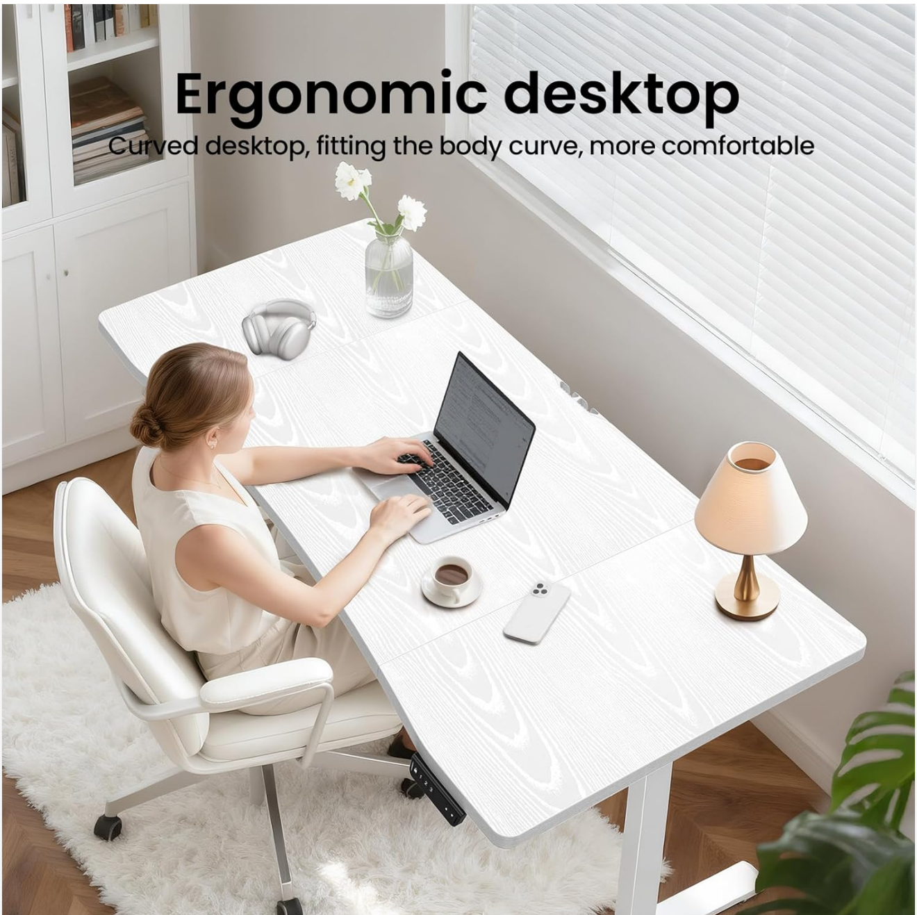
Image 5.1: A user operating the Veken Electric Standing Desk in a sitting position, demonstrating the ergonomic curved edge for comfortable use.

Curved desktop, fitting the body curve, more comfortable