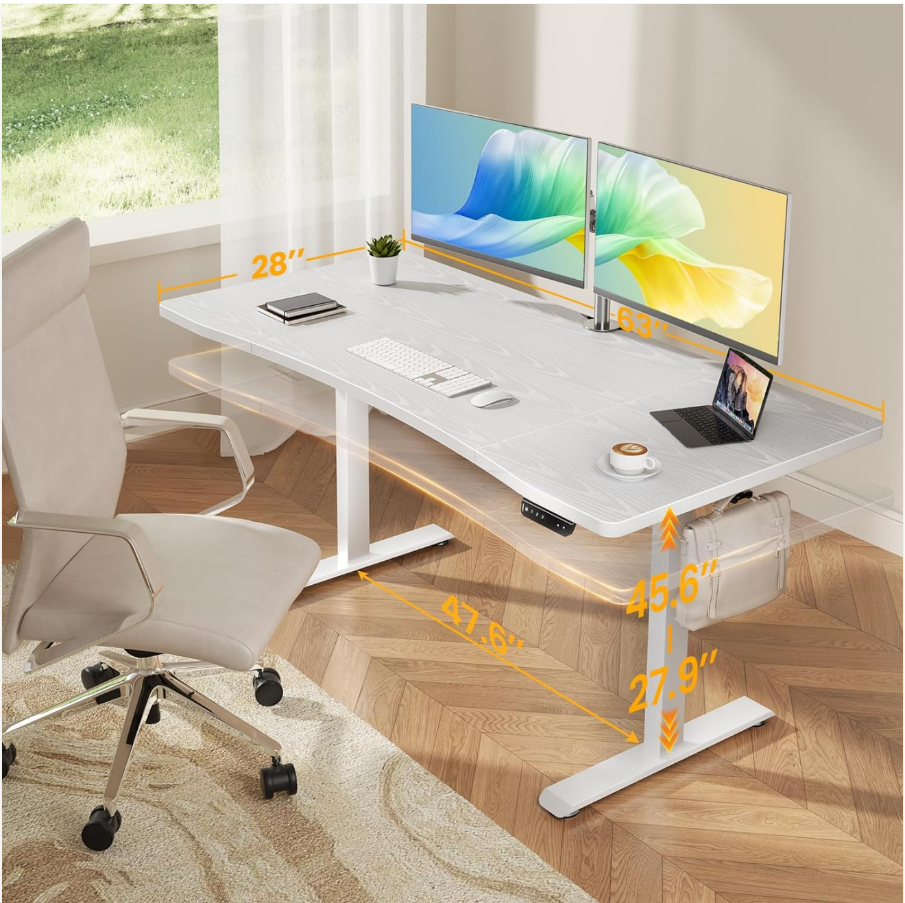
Image 1.1: Veken Electric Standing Desk showcasing its dimensions (63"W x 28"D) and adjustable height range (27.9" to 45.6"). The control panel is visible on the right side of the desk.