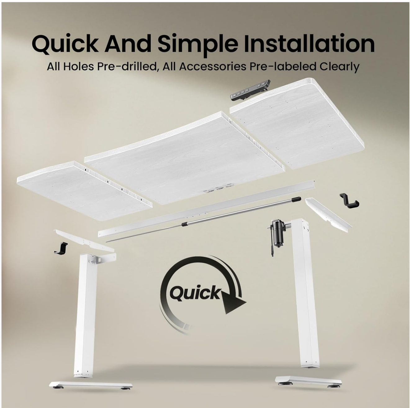
Image 4.1: Exploded view demonstrating the quick and simple installation process, showing pre-drilled holes and pre-labeled accessories.