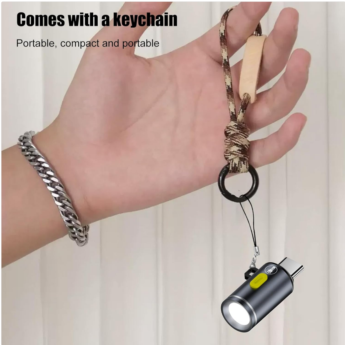
Figure 3: The flashlight featuring its keychain loop for portability.