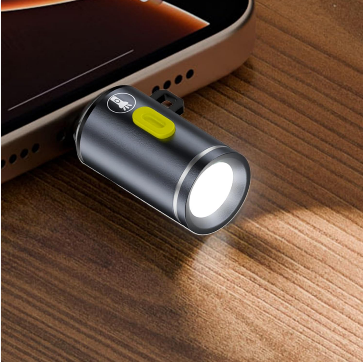
Figure 4: Flashlight in operation, providing illumination.

The flashlight may offer a single brightness mode or multiple modes. Repeatedly pressing the power button may cycle through available modes if applicable. Refer to product packaging for specific mode details if not covered here.