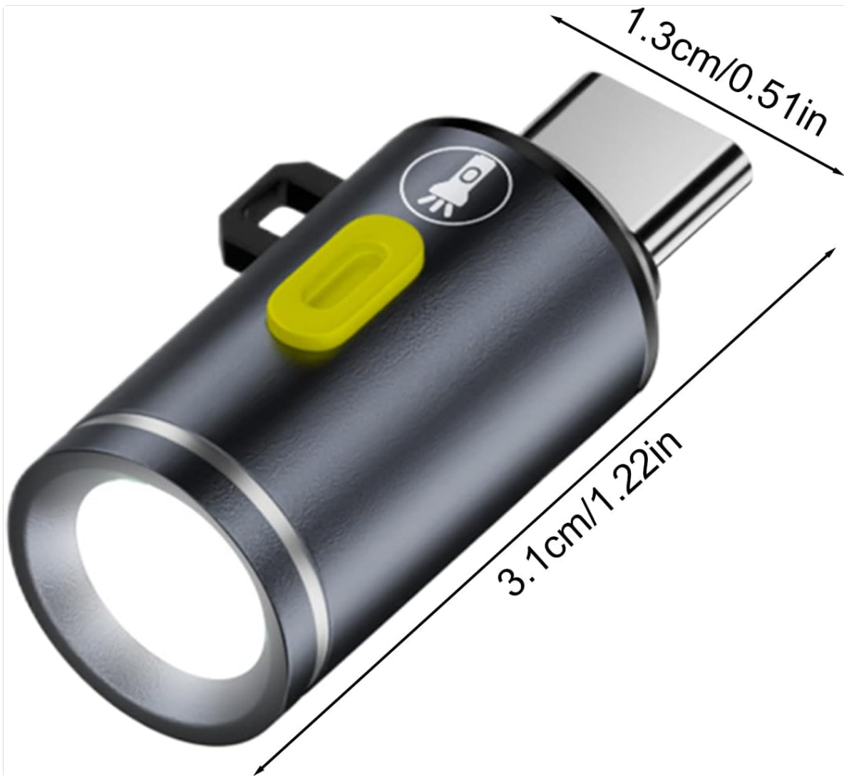
Figure 7: Approximate dimensions of the flashlight.