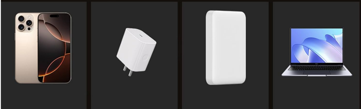
Figure 1: Safety warnings and examples of compatible Type-C power sources (phone, wall adapter, power bank, laptop).

Can be connected through the Type-C port any Type-C power supply for charging it