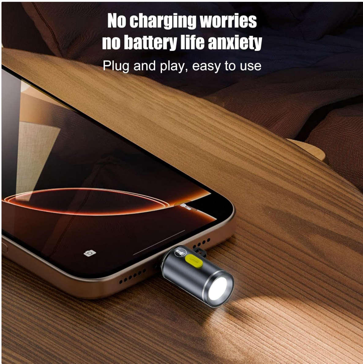
Figure 6: Direct charging via a smartphone, highlighting ease of use.