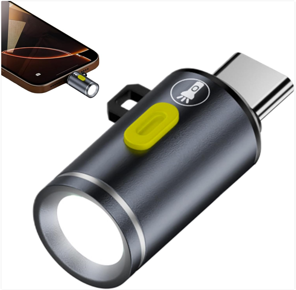
Figure 2: The flashlight connected to a smartphone via its Type-C port.