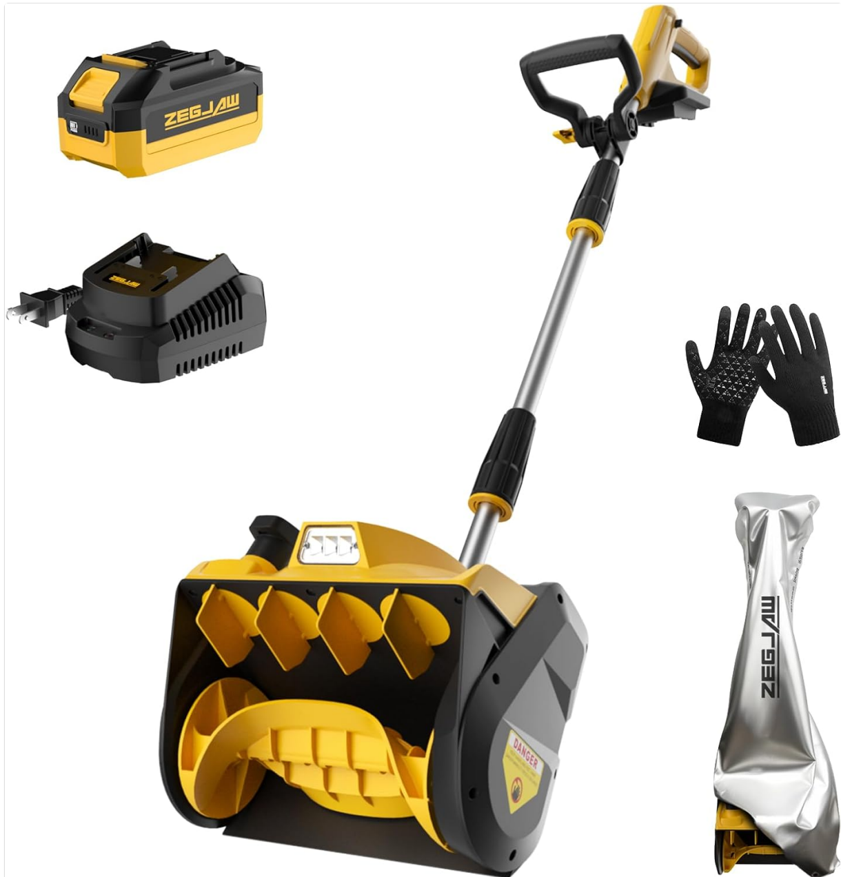
Figure 3.1: Complete package contents of the ZEGJAW Cordless Snow Shovel.