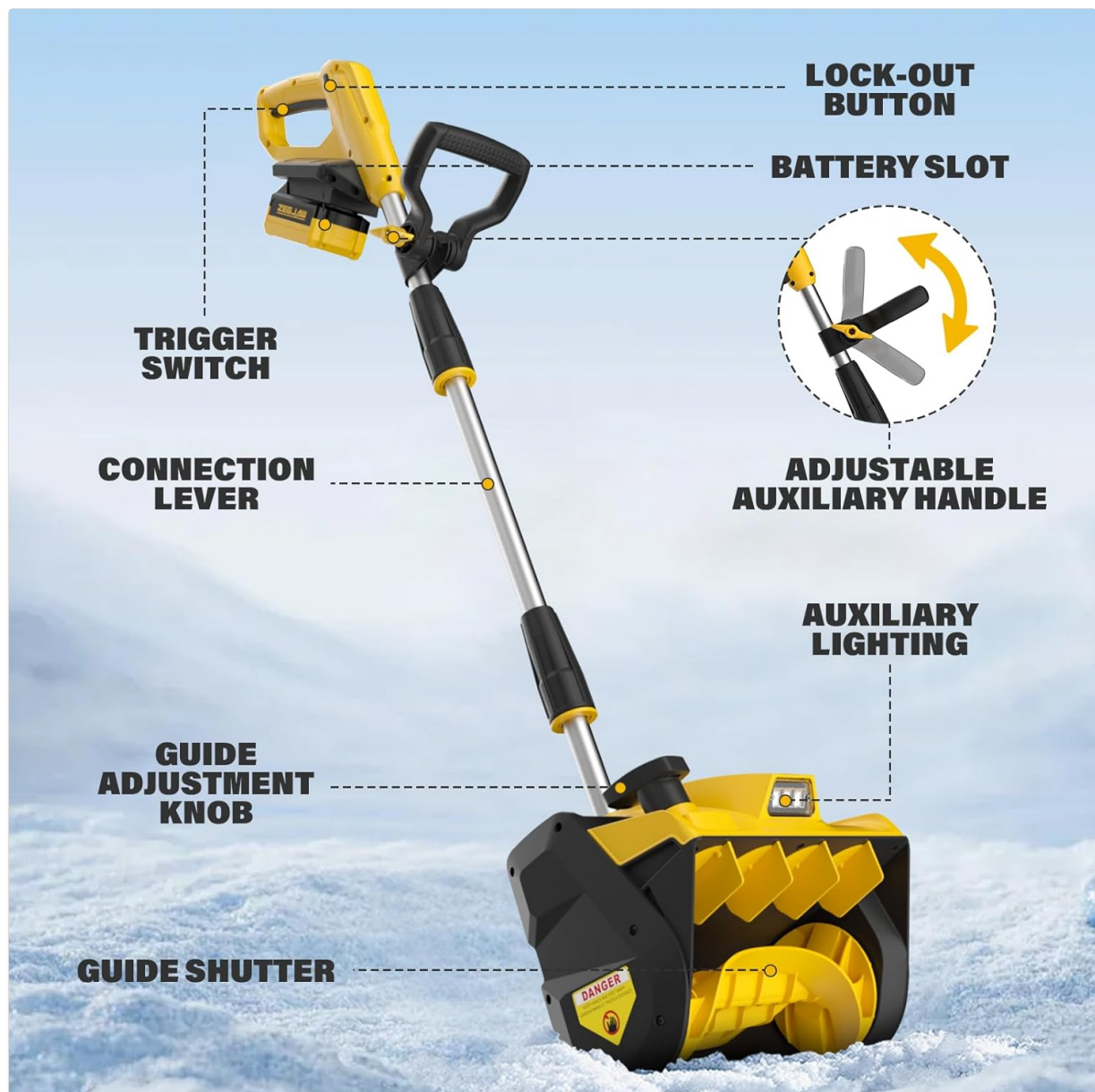
Figure 4.2: Labeled components of the ZEGJAW Cordless Snow Shovel.

For a visual guide on assembly and initial setup, please refer to the demonstration video below: