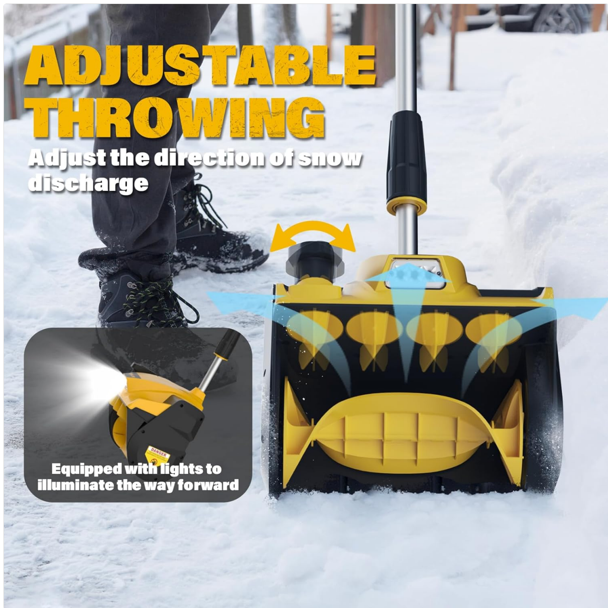
Figure 5.3: Snow throwing distance of 23 feet.