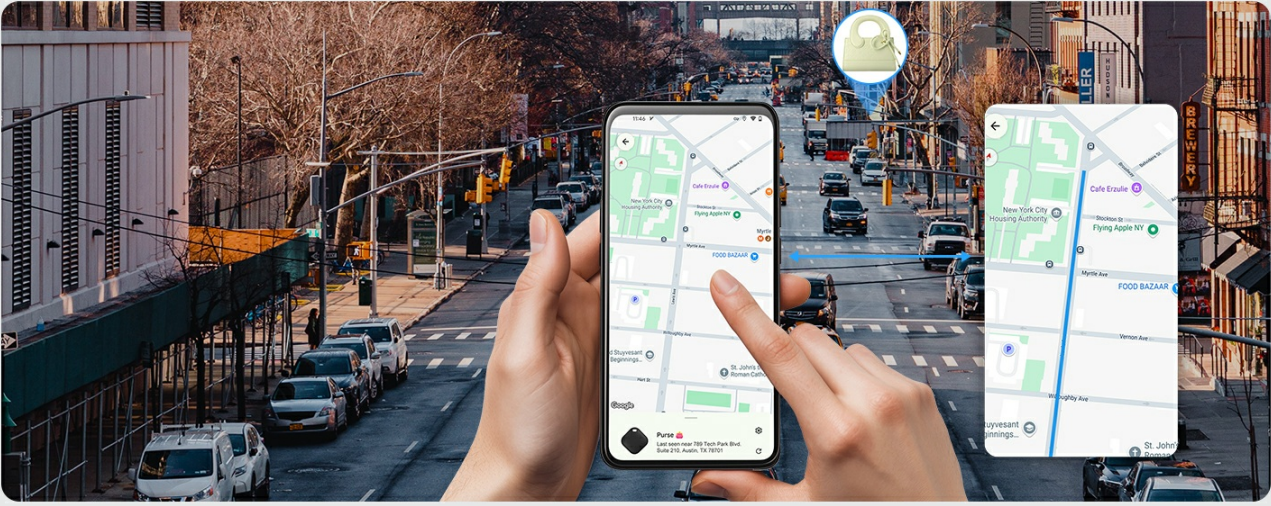
Image: A smartphone displaying the tracker's location on a detailed street map in an urban environment.