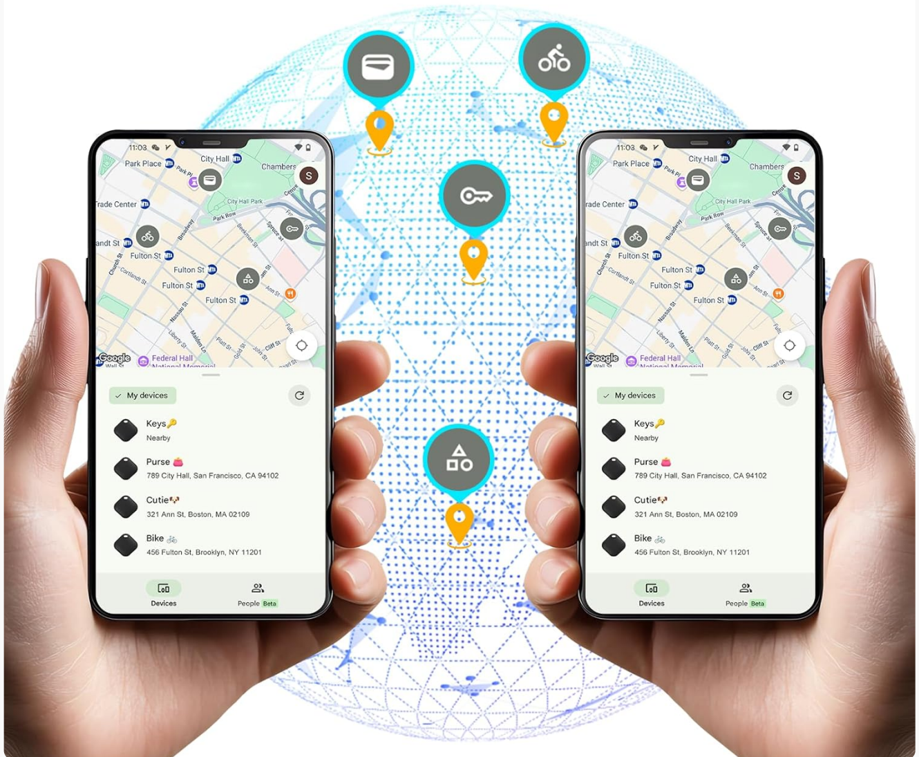
Image: Two smartphones showing the global tracking capability of the Beyamis tags on a map, indicating real-time location sharing.

Real-time location sharing with worldwide coverage