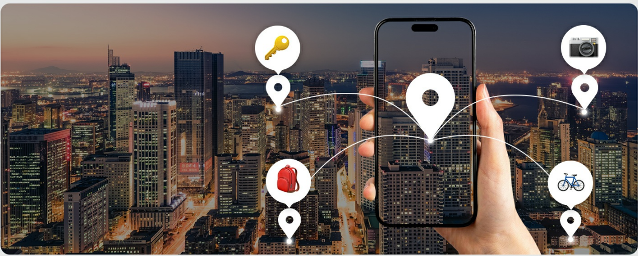
Image: An illustration of global tracking, showing a smartphone with various item icons linked to locations across a city skyline.