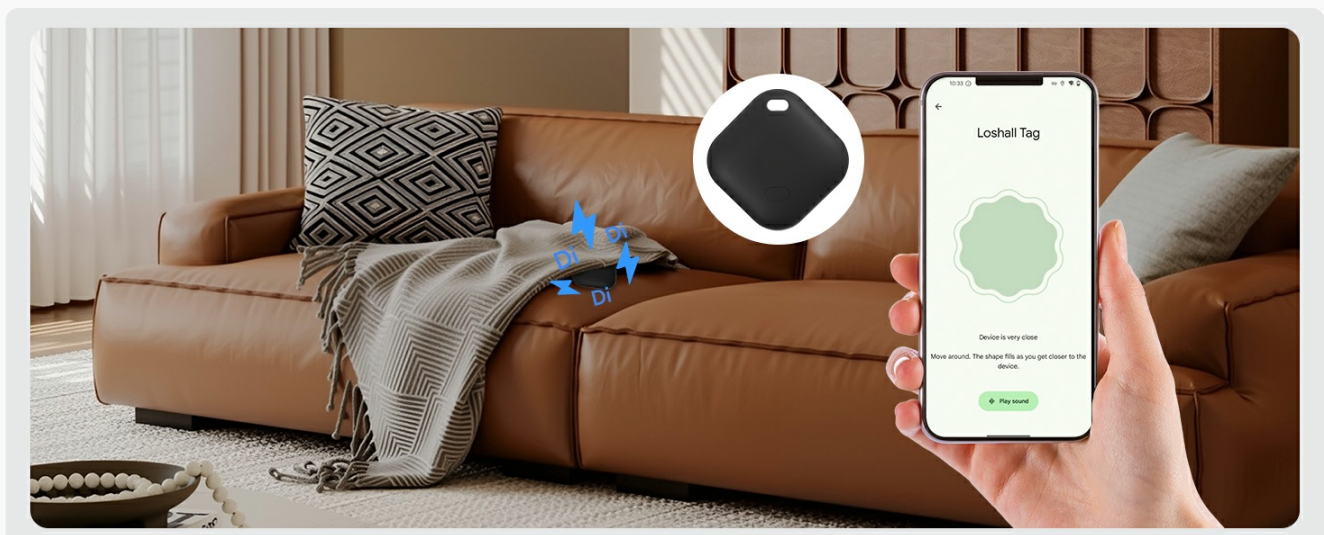
Image: The tracker tag placed on a couch, with a smartphone screen showing the app's interface for finding the device nearby.