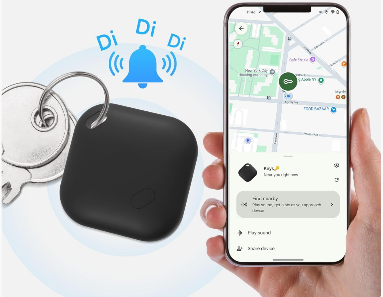
Image: A Beyamis tracker tag on a set of keys, demonstrating how to activate the loud alarm via the Find My Device app on a smartphone.

Find anything instantly with 100dB tracker alarm