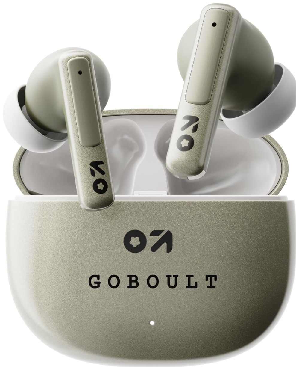
Image: GOBOULT W60 True Wireless Earbuds in their green charging case, showcasing the product's design.