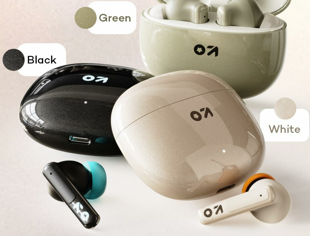
Image: Displays the GOBOULT W60 earbuds and their charging cases in three available colors: Green, Black, and White.