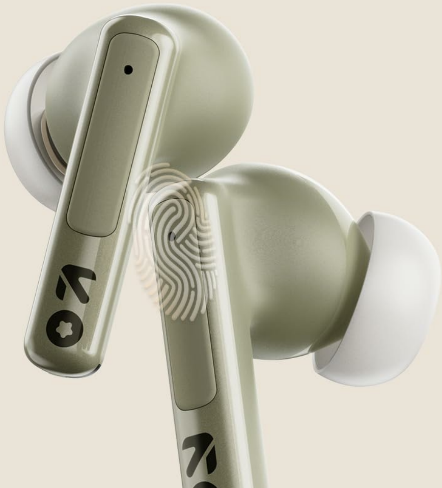
Image: Illustrates the "Tap to Command" feature, highlighting user-friendly touch controls and seamless multitasking capabilities of the earbuds.