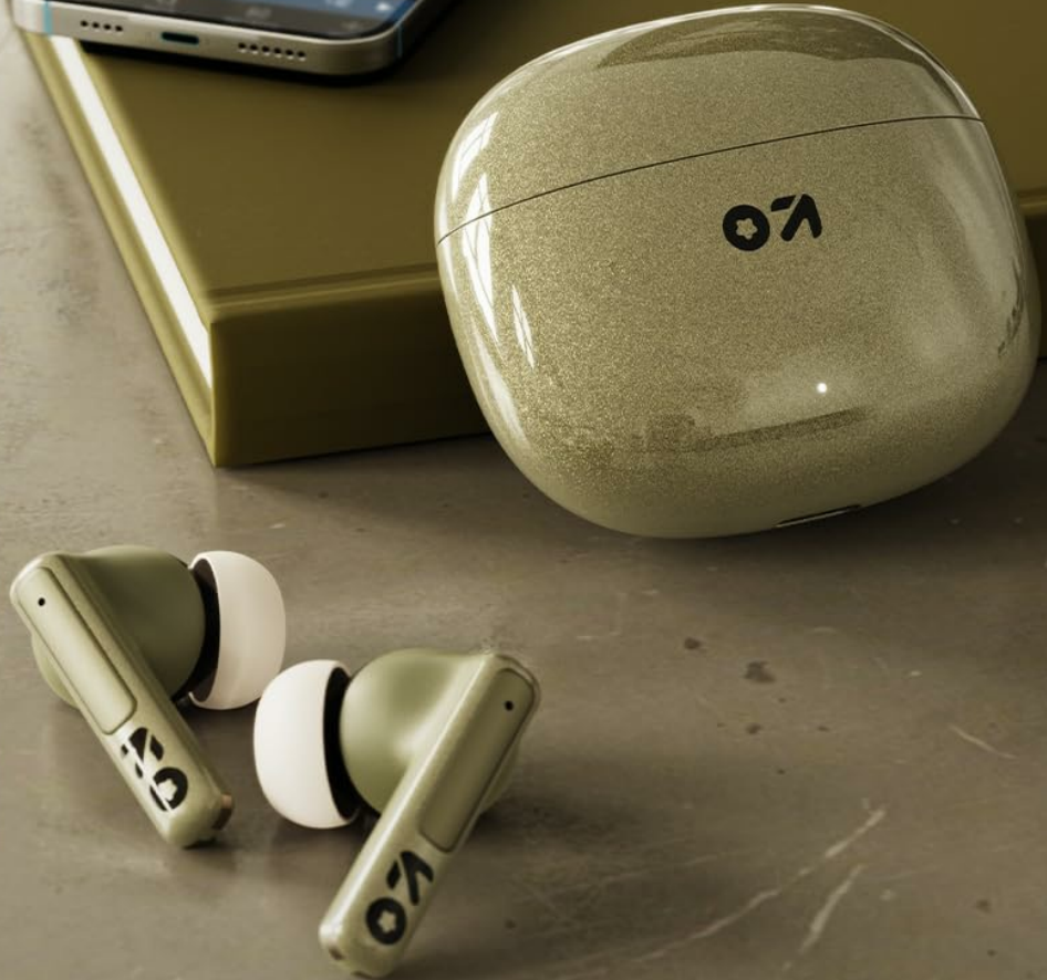
Image: Highlights the new generation Bluetooth 5.4 technology, emphasizing instant "Blink & pair" functionality, support for SBC & AAC codecs, and a drop-free stable connection.