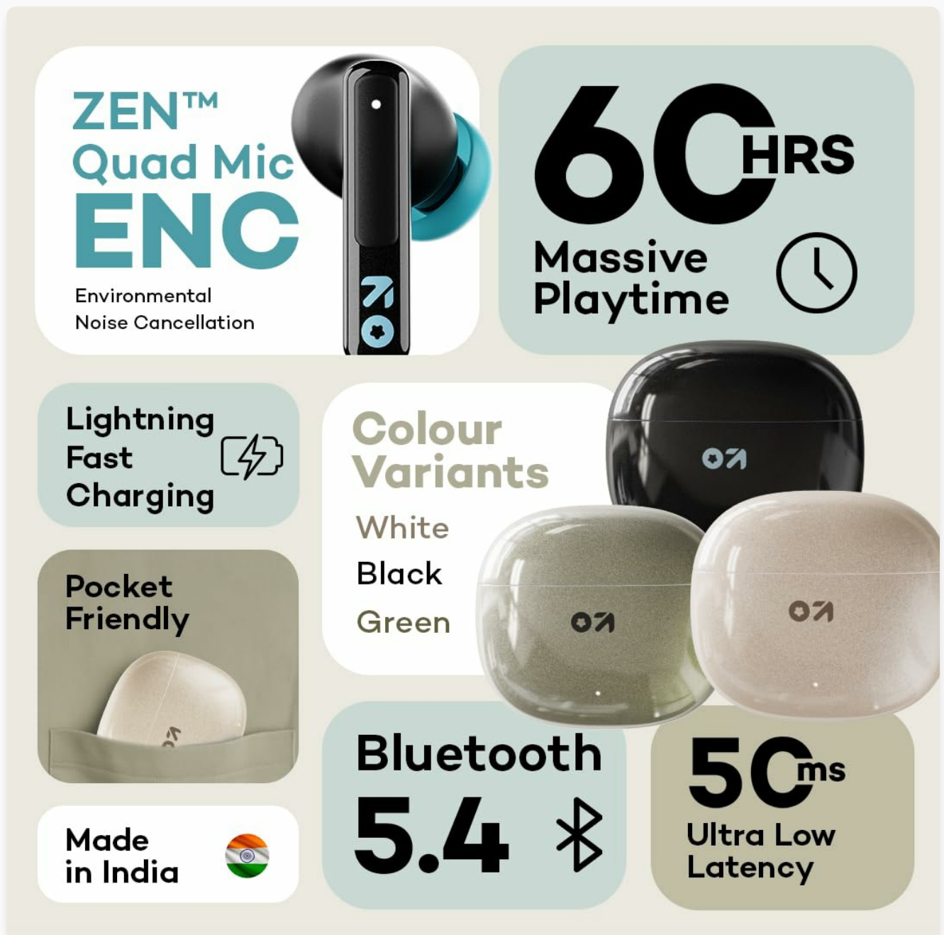
Image: An overview of key features of the GOBOULT W60 earbuds, highlighting 60 hours playtime, ZEN Quad Mic ENC, Lightning Fast Charging, Pocket Friendly design, Made in India, Bluetooth 5.4, and 50ms Ultra Low Latency.