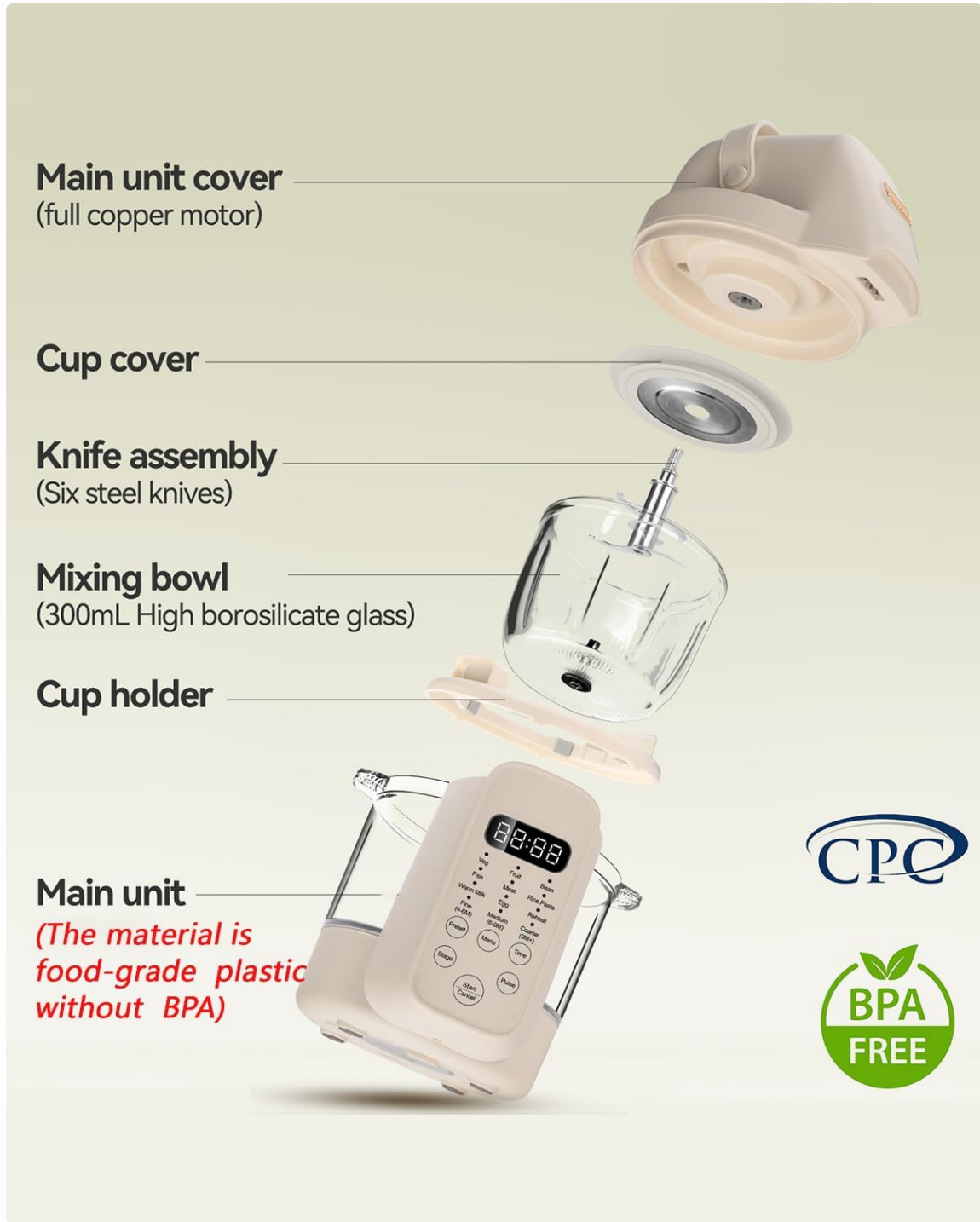
Figure 1: Exploded view showing main unit cover, cup cover, knife assembly, mixing bowl, cup holder, and main unit.