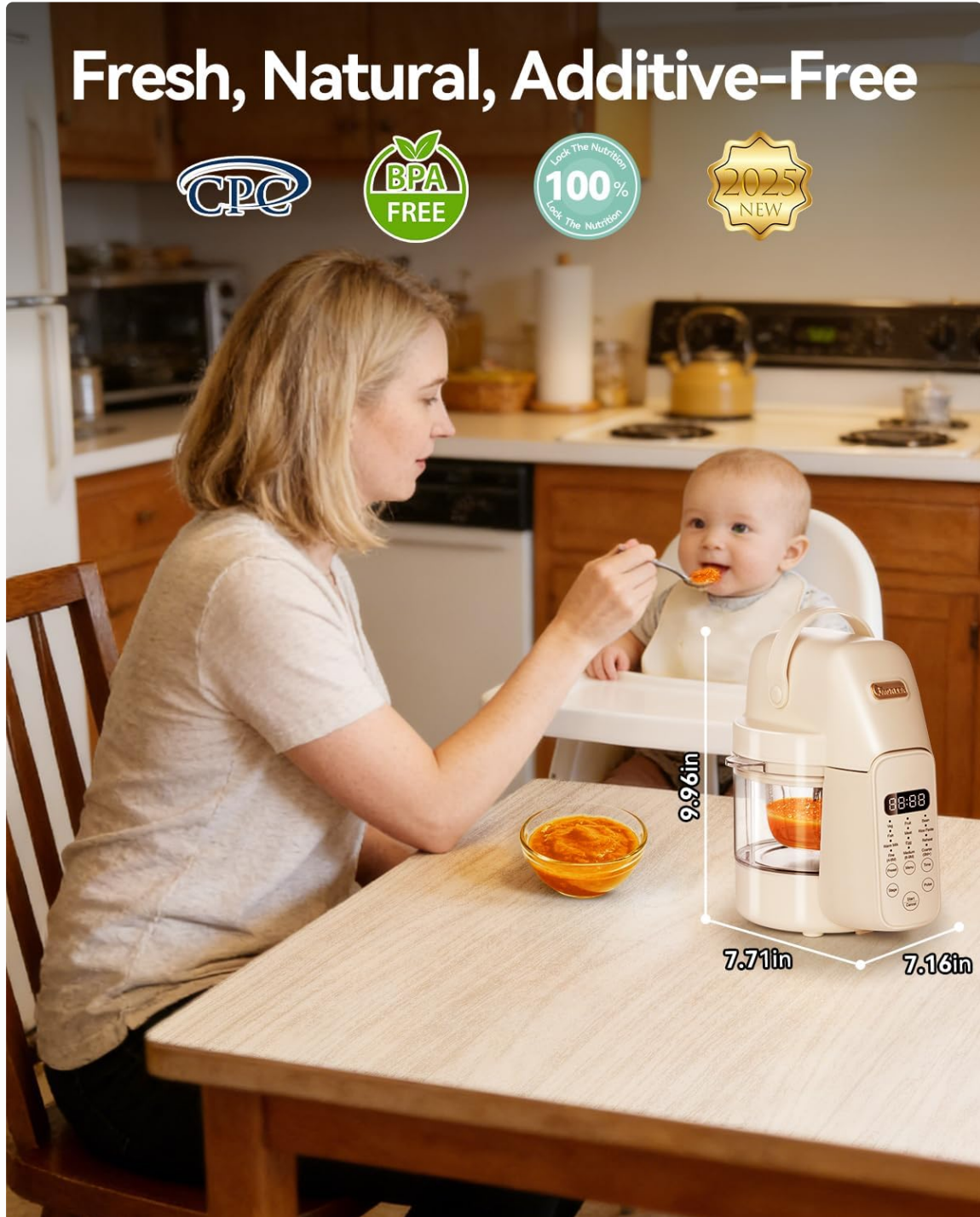
Figure 11: Front view of the IAGREEA BFM001 Baby Food Maker, highlighting its compact dimensions.