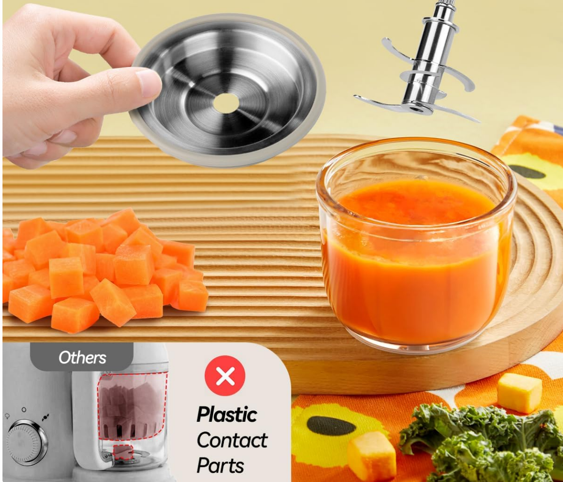
Figure 2: Illustrates the food-safe stainless steel blades and glass bowl, ensuring no plastic contact with food.