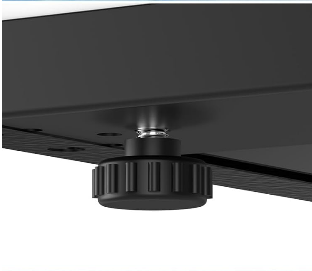
Adjustable Front Leveling Legs