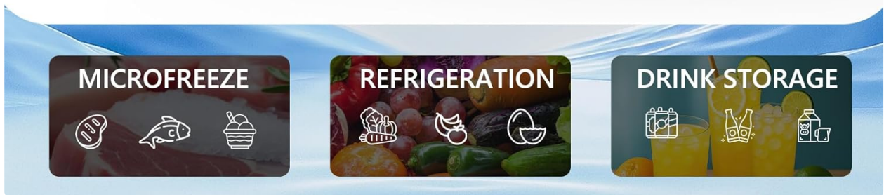
Image: An illustration of the mini fridge's interior, detailing the microfreeze compartment, main refrigeration area, and door storage for drinks, along with overall dimensions.