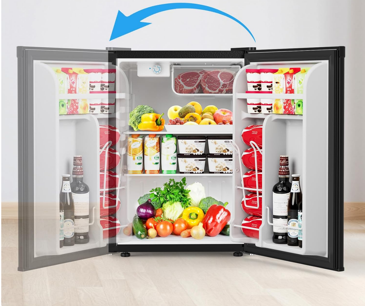
Image: The mini fridge with its door open, illustrating how the reversible door design allows for opening from either side, adapting to different space requirements.

A Thoughtful Design for Your Convenience