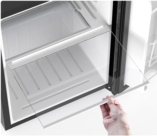
Removable Glass Shelves