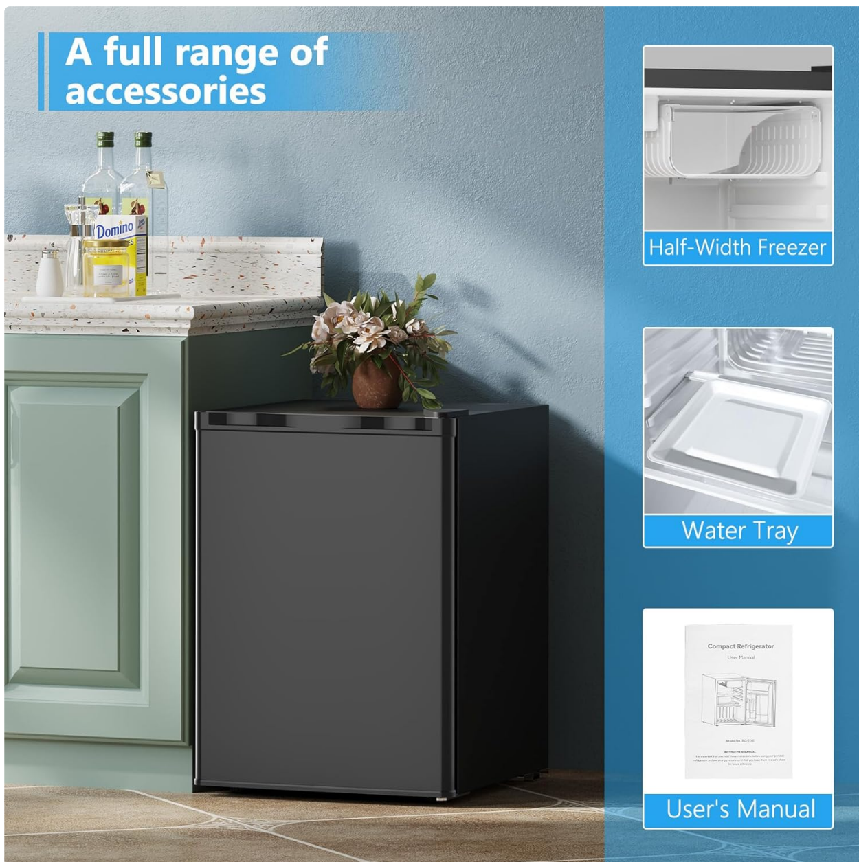
Image: A display of the included accessories, featuring the half-width freezer compartment and the water tray, which is useful during the manual defrosting process.