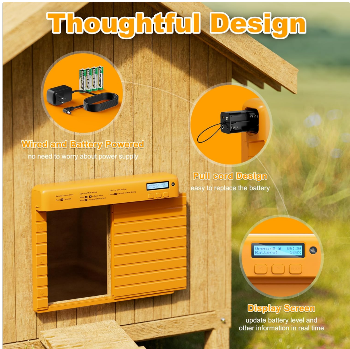
Image 4.2: Detailed view of the door's thoughtful design, highlighting the dual power options (wired and battery), the convenient pull-cord for battery access, and the clear display screen.