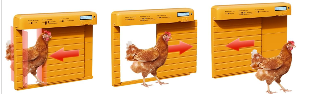
Image 2.1: Visual representation of the anti-pinch safety feature, demonstrating how the door detects an obstruction and reopens to protect poultry.