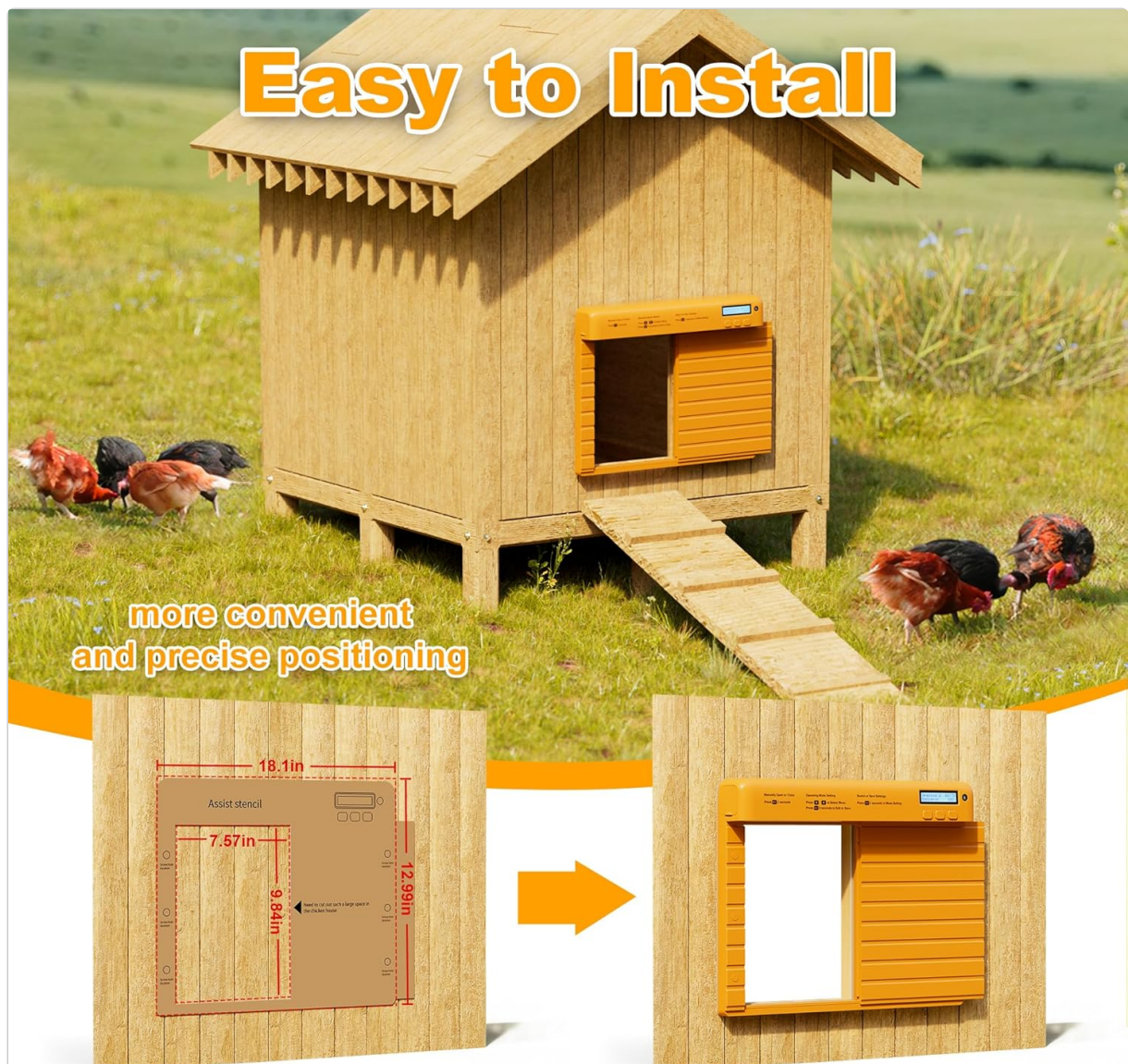
Image 4.1: Step-by-step guide for installing the automatic chicken coop door, from marking the opening to securing the unit.