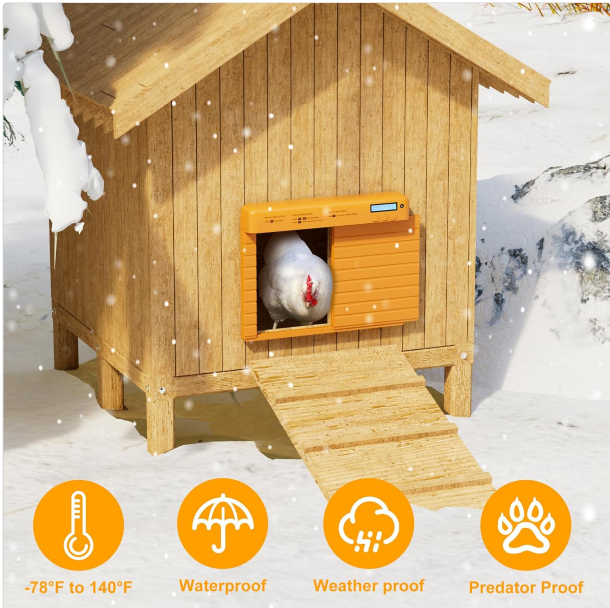
Image 6.1: Illustration of the door's durability, showcasing its ability to withstand extreme temperatures, water, and deter predators.