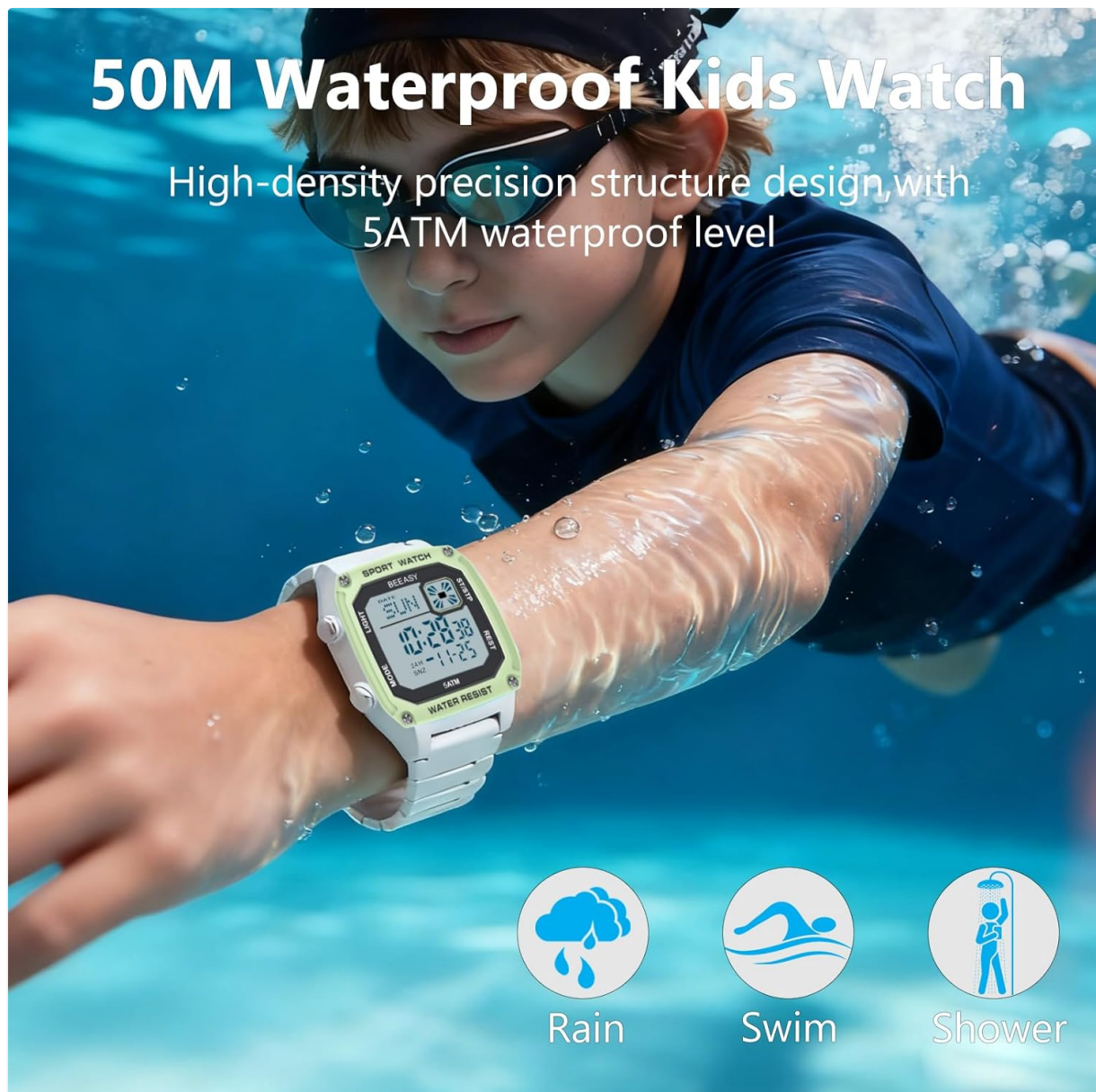
Image: A child wearing the Beesy Kids Digital Watch while swimming, demonstrating its 50M water resistance for various water activities.