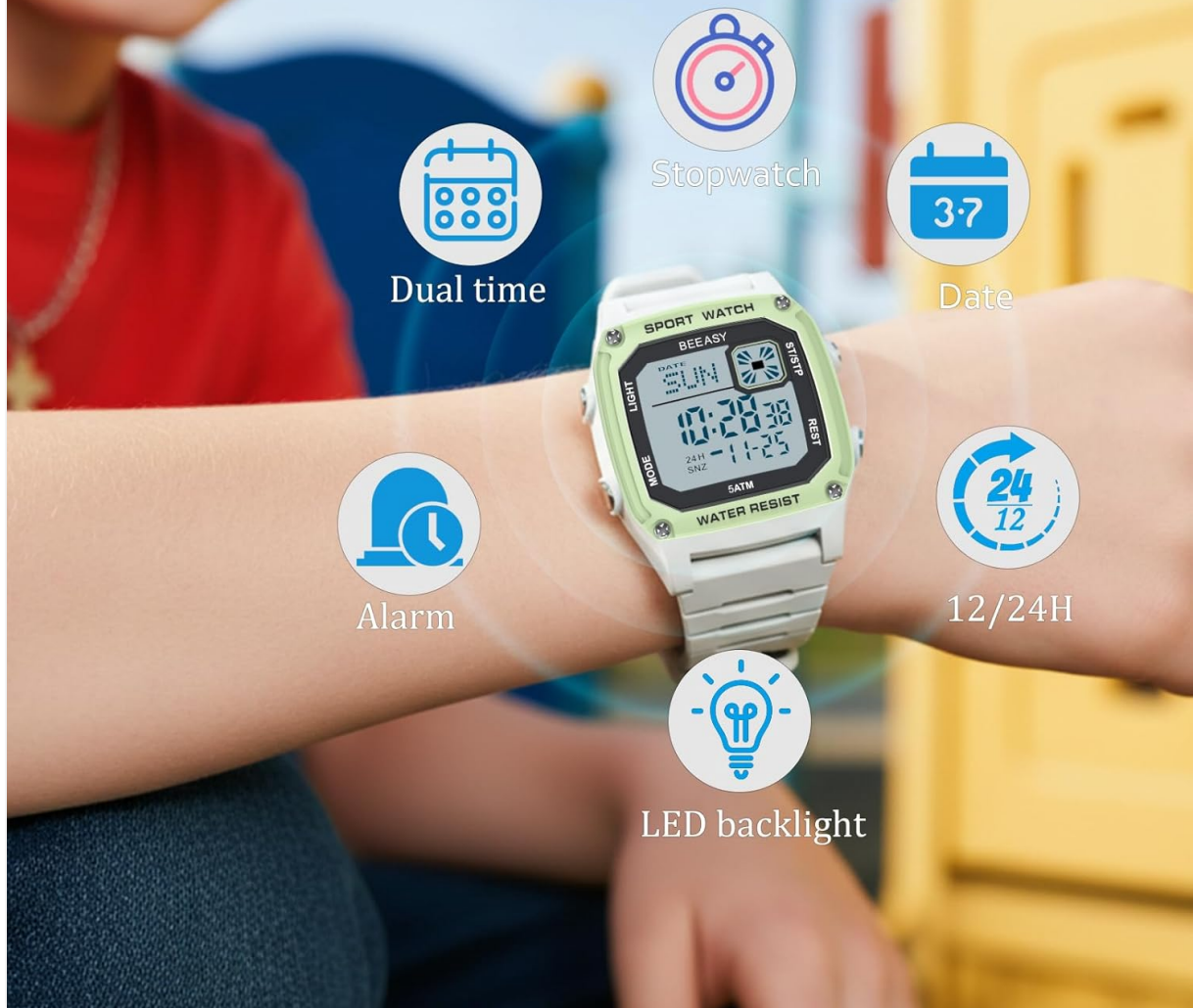
Image: The Beeasy Kids Digital Watch showcasing its various functions including dual time, stopwatch, date, alarm, and LED backlight.