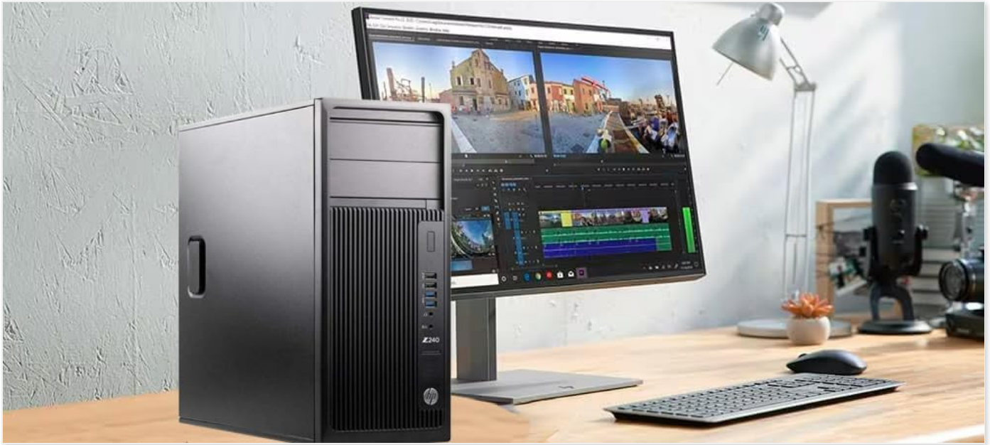
Image: The HP Z240 Tower Workstation integrated into a typical office or home desktop setup with a monitor, keyboard, and mouse.