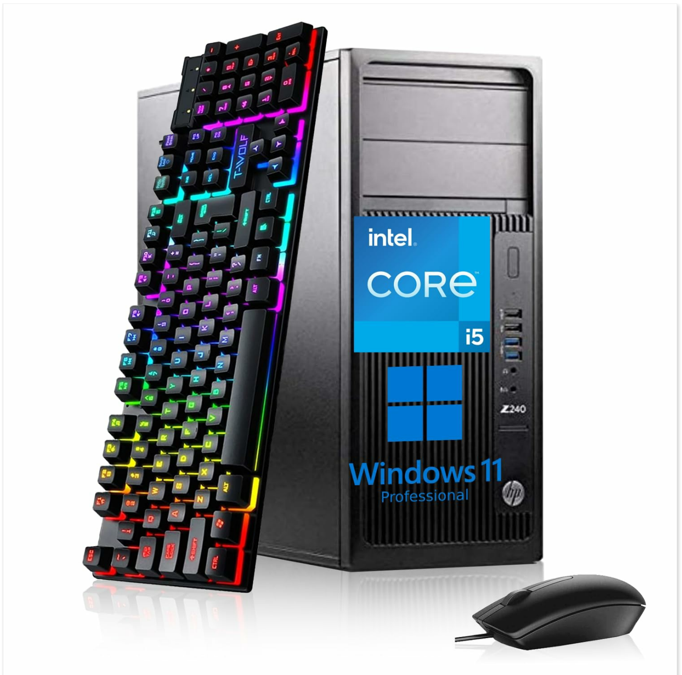
Image: Front and side view of the HP Z240 Tower Workstation Desktop Computer.