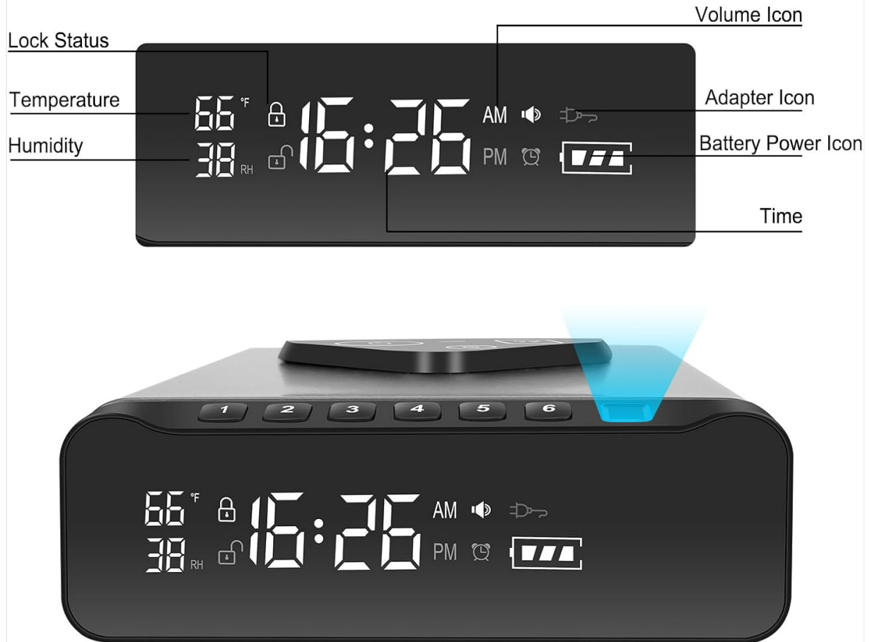
Figure 3: The LCD display on the safe's front panel, indicating current time, temperature, humidity, lock status, volume icon, adapter icon, and battery power icon.