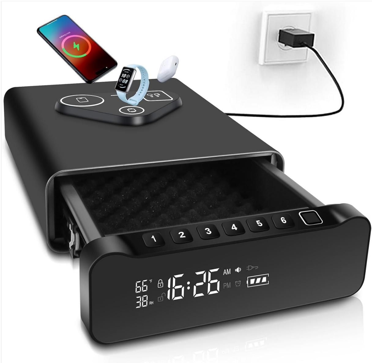
Figure 1: Front view of the BBRKIN CTC01 safe, showing the open drawer, digital display, and wireless charging pad on top. A phone, smartwatch, and earbuds are shown charging wirelessly.

The BBRKIN CTC01 safe combines robust security with modern convenience features. Familiarize yourself with its components: