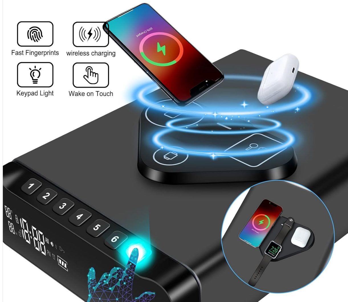
Figure 2: Detail of the wireless charging area, highlighting the fast fingerprint access, wireless charging capability, keypad light, and wake-on-touch feature.