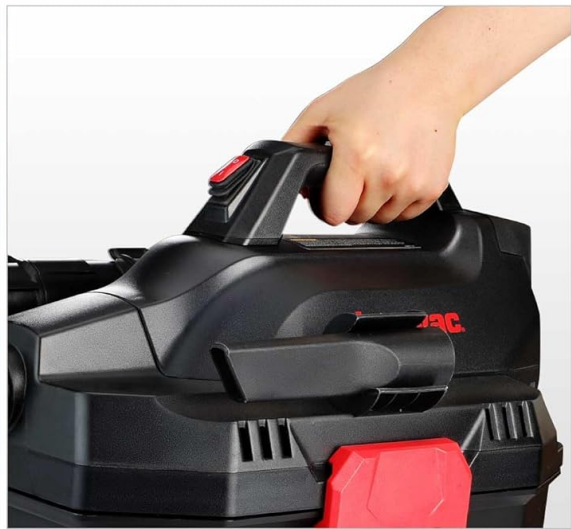
Image: Detailed views highlighting the compact nature of the vacuum, its integrated accessory storage, and the ease of carrying the unit.