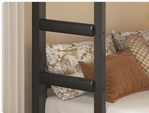
Image 4.1: Detail of the bunk bed ladder, highlighting its robust design for safe access.

Note: Two adults are recommended for assembly. Do not overtighten screws. Protective plastic floor caps are pre-installed to prevent scratches and reduce noise.