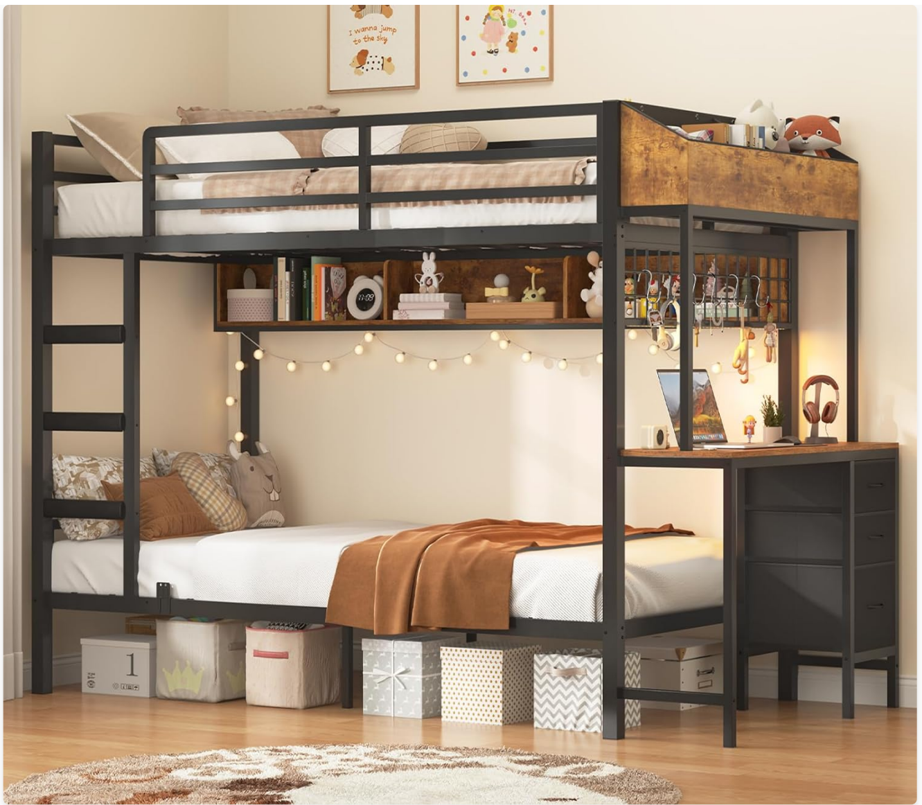
Image 1.1: Fully assembled VIAGDO Twin Over Twin Bunk Bed, showcasing the integrated desk, storage, and LED lighting.