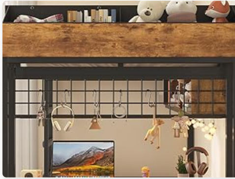
Image 5.6: Detail of the S-hooks, demonstrating their utility for hanging accessories.