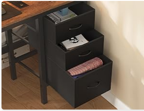
Image 5.5: Detail of the three fabric storage drawers, illustrating their practical use for organization.