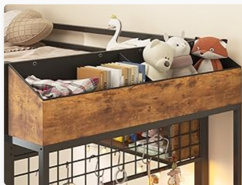
Image 5.4: Detail of the bedside storage boxes, providing convenient access for items on the top bunk.