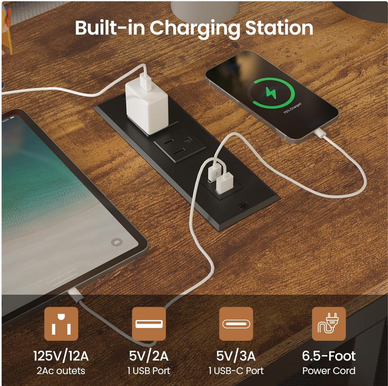
Image 5.1: Detail of the charging station, showing its various power outlets and ports.