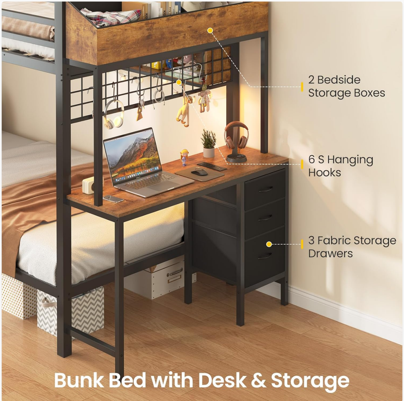
Image 5.3: Overview of the desk and integrated storage solutions, including drawers, hooks, and bedside boxes.