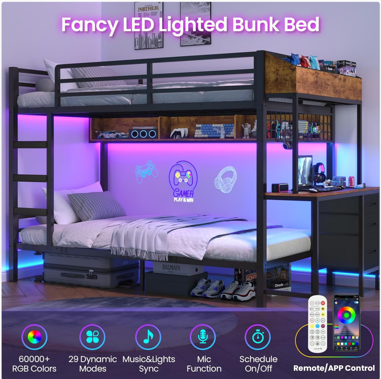
Image 5.2: The bunk bed with its LED lights active, demonstrating color options and control methods.