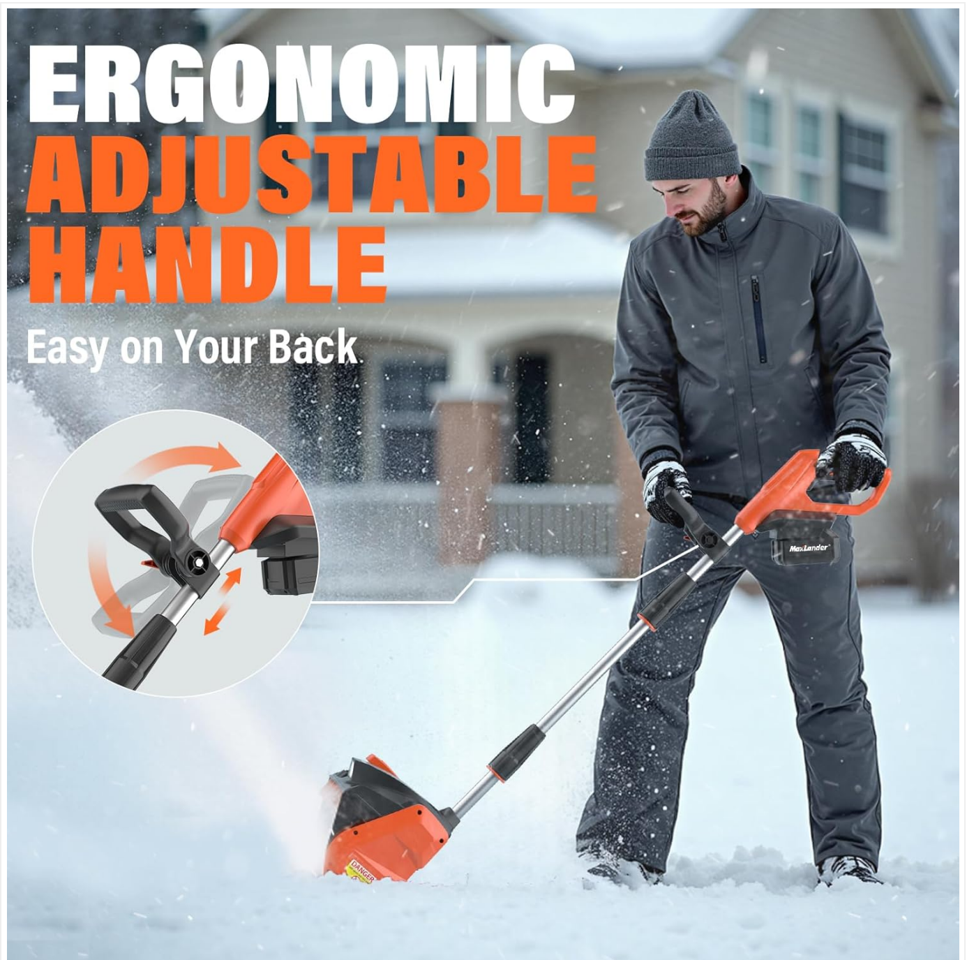
Image 8: A user adjusting the ergonomic handle, designed for comfortable operation and reduced back strain.