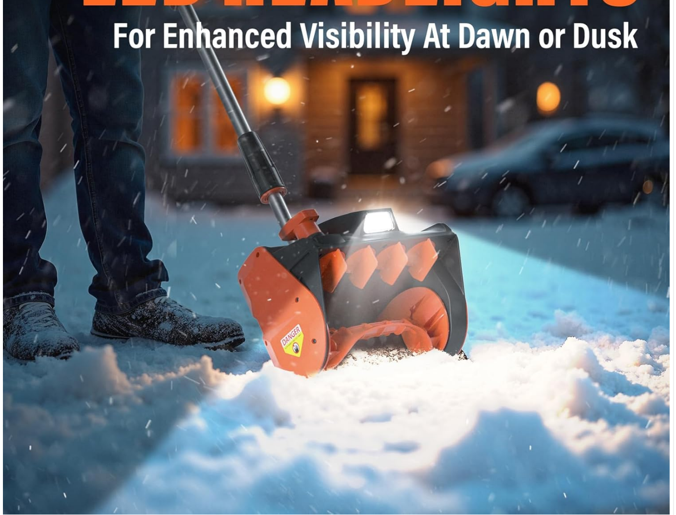
Image 6: The snow shovel in use during low light conditions, with its high-intensity LED headlights providing enhanced visibility.