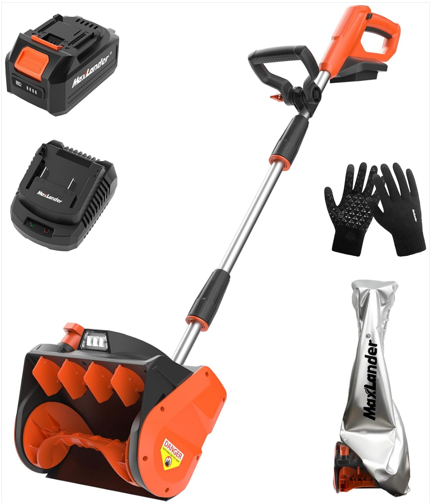
Image 1: Overview of the MAXLANDER Cordless Snow Shovel and its included accessories: the main shovel unit, a 20V 4.0Ah battery, a quick charger, a pair of protective gloves, and a storage cover.