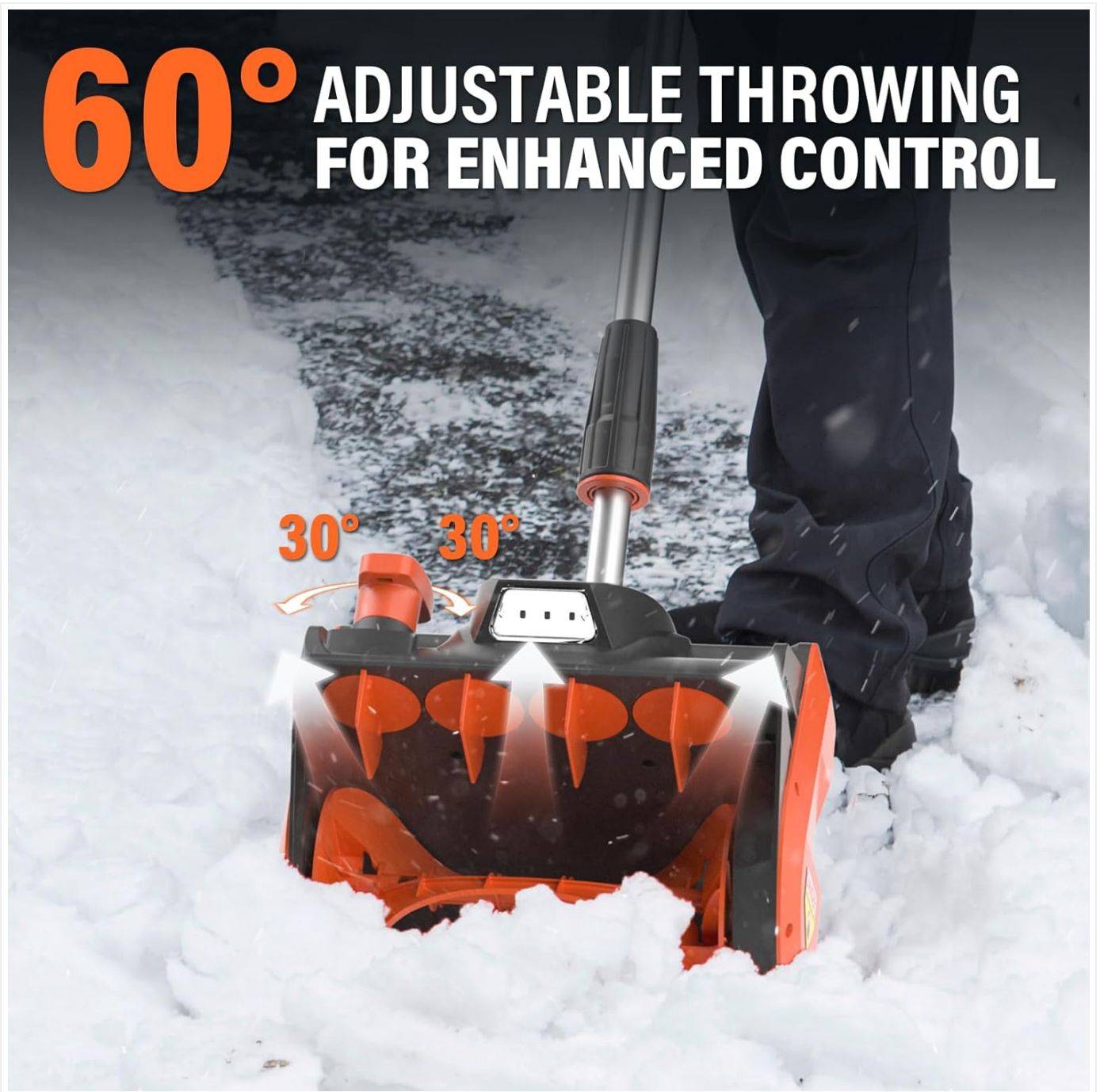
Image 7: Detail of the adjustable directional plate, indicating its 60-degree range for controlling snow throwing direction.