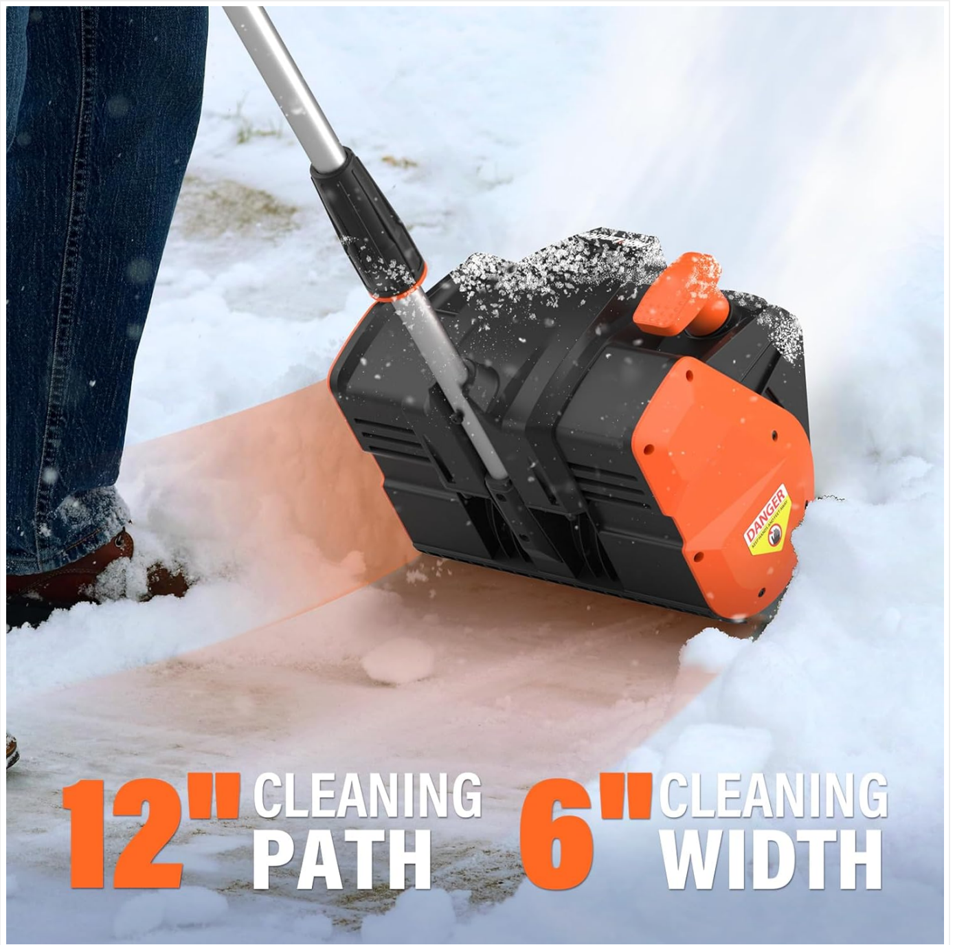
Image 5: The snow shovel clearing a path, illustrating its 12-inch cleaning width and 6-inch cleaning depth.