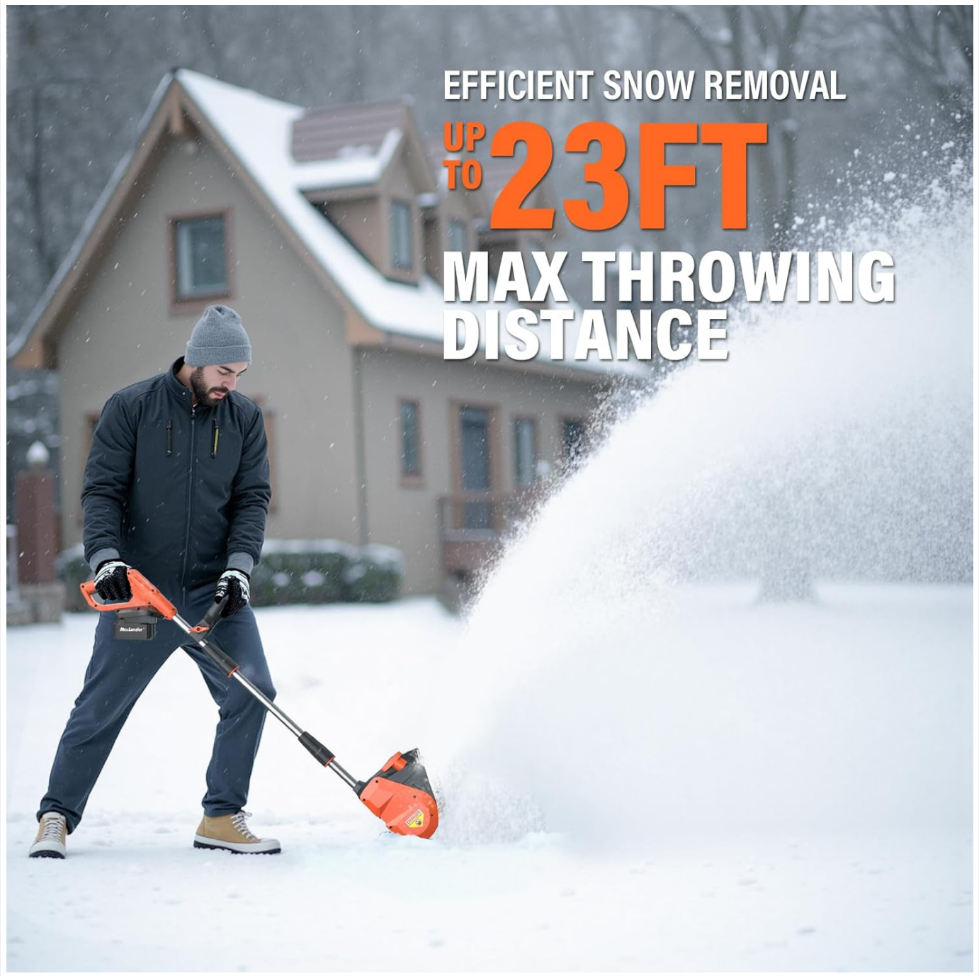
Image 4: A user demonstrating the snow shovel's efficient snow removal, showing snow being thrown a significant distance.