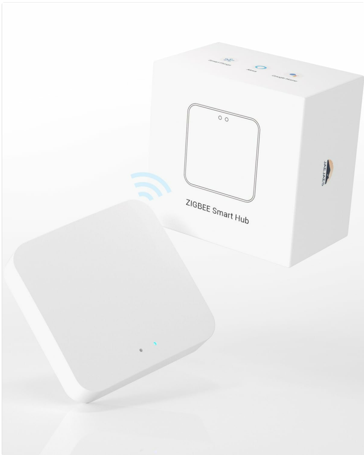
Image: The compact JaeJaes Smart Hub, a central component for smart blind control.