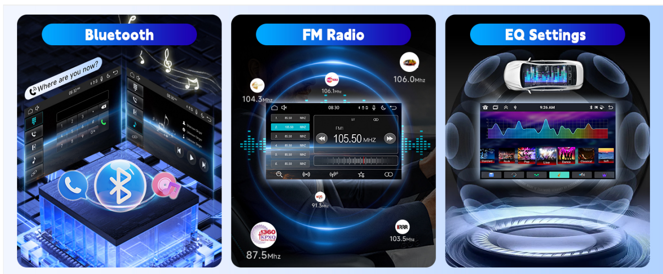
Figure 5.2: Built-in Bluetooth functionality for hands-free calling and wireless music playback.