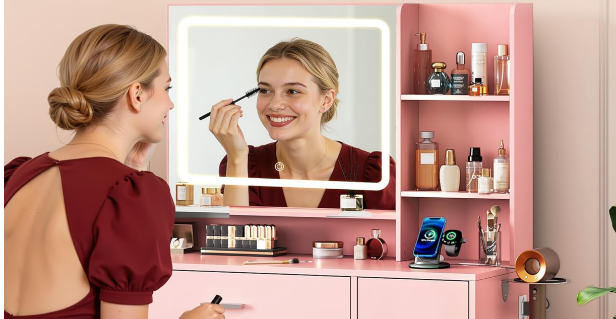
Image: The fully assembled WLIVE Pink Vanity Desk.