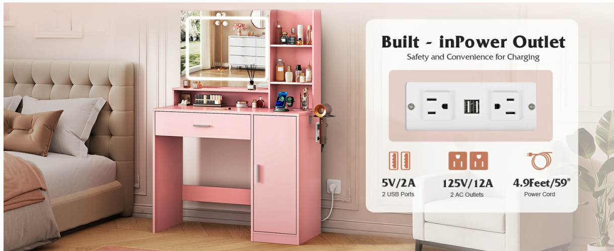
Image: Close-up of the integrated power outlet and hair dryer holder on the vanity desk.

The side of the vanity desk includes two AC outlets (125V/12A) and two USB ports (5V/2A). Use these to power and charge your electronic devices. A built-in holder is provided for your hair dryer.