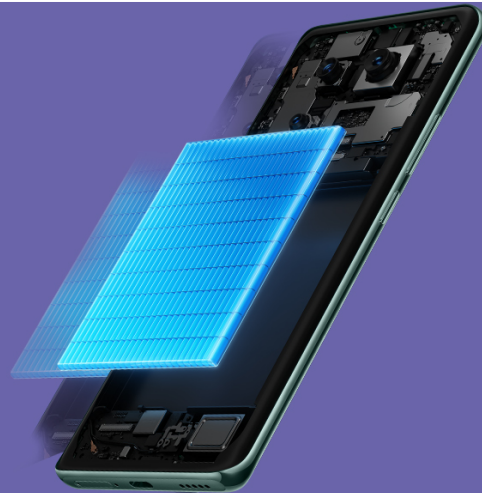
Image: An internal view of the Redmi Note 14 Pro 5G, illustrating the large 5500mAh battery component.