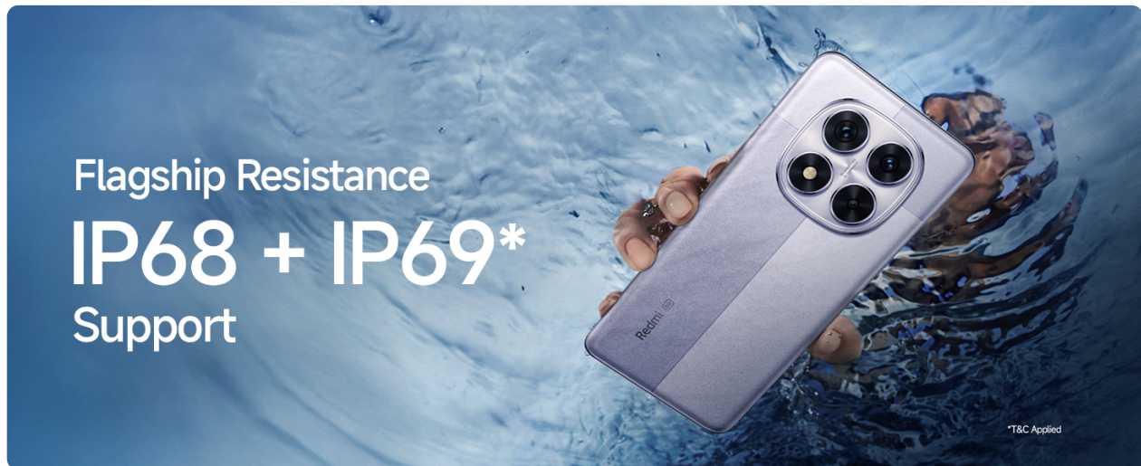
Image: The Redmi Note 14 Pro 5G submerged in water, demonstrating its IP68 and IP69 water and dust resistance capabilities.

The Redmi Note 14 Pro 5G features IP68 and IP69 protection, providing resistance against dust and water. While it offers protection, avoid intentional submersion or exposure to high-pressure water jets.