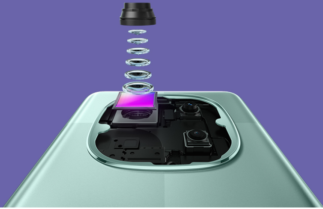
Image: The camera module of the Redmi Note 14 Pro 5G, highlighting the 50MP sensor with OIS for stable imaging.