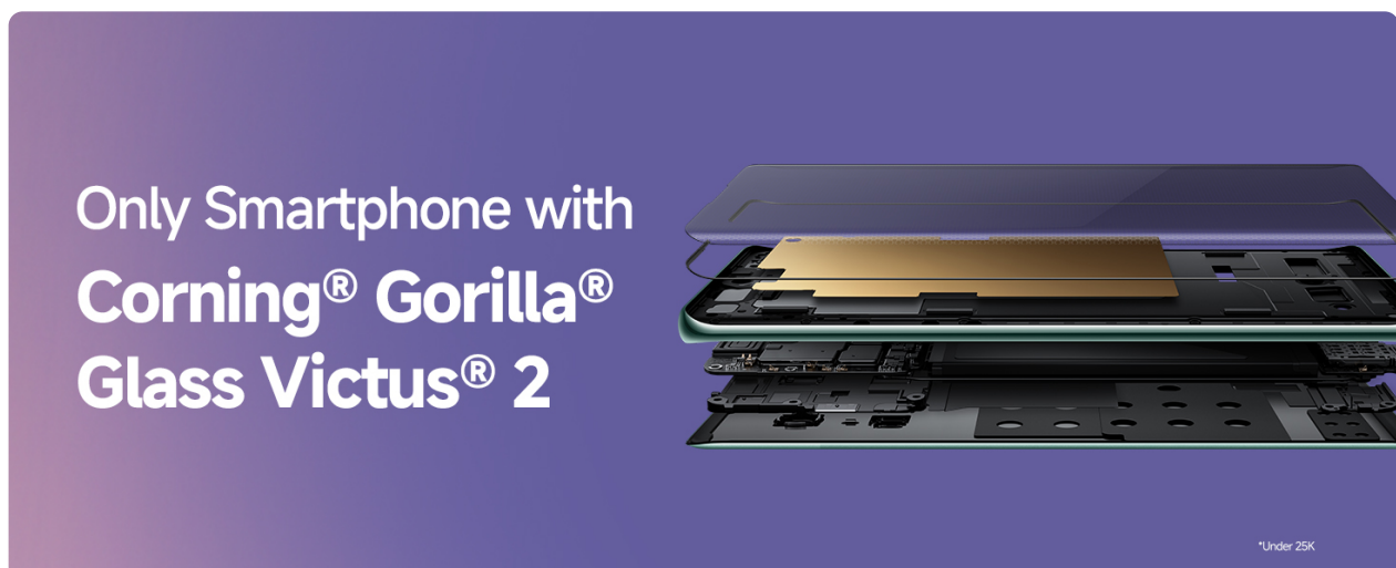
Image: A visual representation of the Corning Gorilla Glass Victus 2 protection on the Redmi Note 14 Pro 5G, emphasizing its durability.

The device is equipped with Corning Gorilla Glass Victus 2 for enhanced durability. While robust, using the provided protective case and a screen protector is recommended for additional safeguarding against drops and scratches.