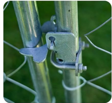
Lockable Design Safety

Image Description: A detailed display of various aspects of the enclosure, including a durable metal bottom, strong connecting buttons, and a lockable design for safety. Silhouettes of small, medium, and large dogs are shown, indicating suitability for different sizes.