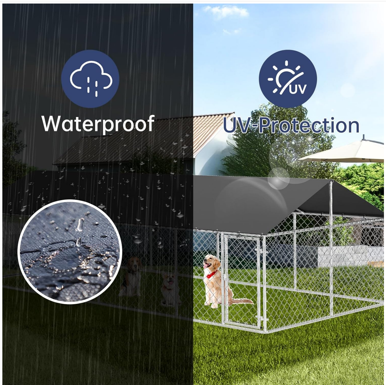
Image Description: This image illustrates the waterproof and UV-protection capabilities of the enclosure's roof cover. One side shows rain falling on the cover, with a close-up of water beading, while the other side shows the kennel under sunlight, emphasizing its UV-protective qualities.