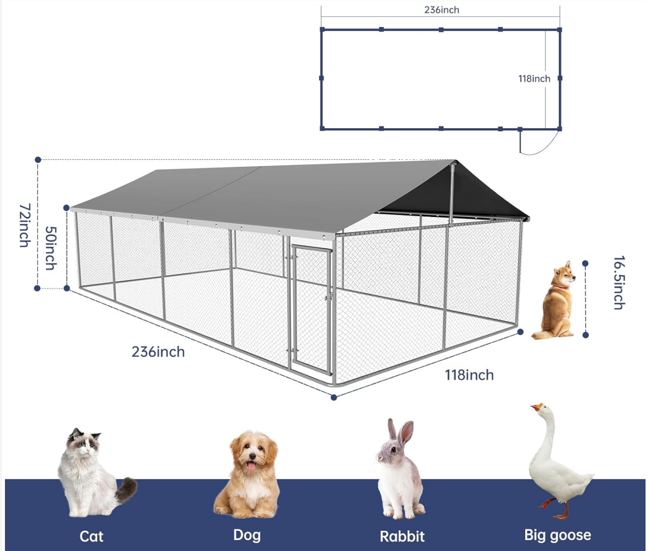
Image Description: A technical diagram showing the overall dimensions of the Petony Outdoor Dog Enclosure: 236 inches wide, 118 inches deep, and 72 inches high. It also indicates suitability for various pets including cats, dogs, rabbits, and geese, with a small dog shown for scale.