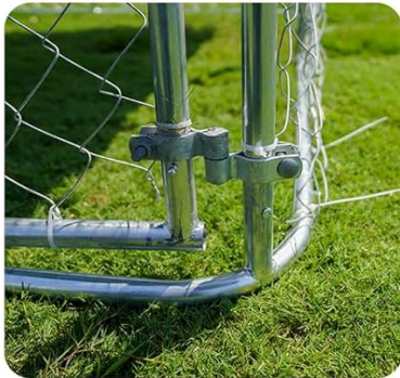
Durable Metal Bottom