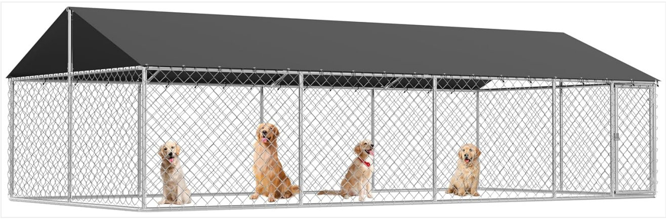
Image Description: A wide shot of the Petony Outdoor Dog Enclosure, showcasing its full length and width. Several dogs are comfortably situated inside, demonstrating the spaciousness of the kennel under its protective roof cover.