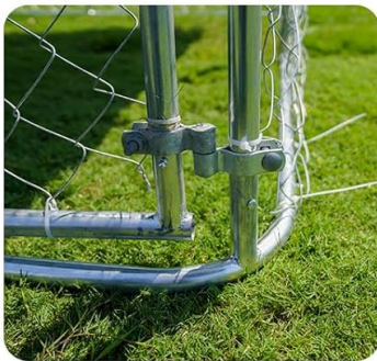
Durable Metal Bottom