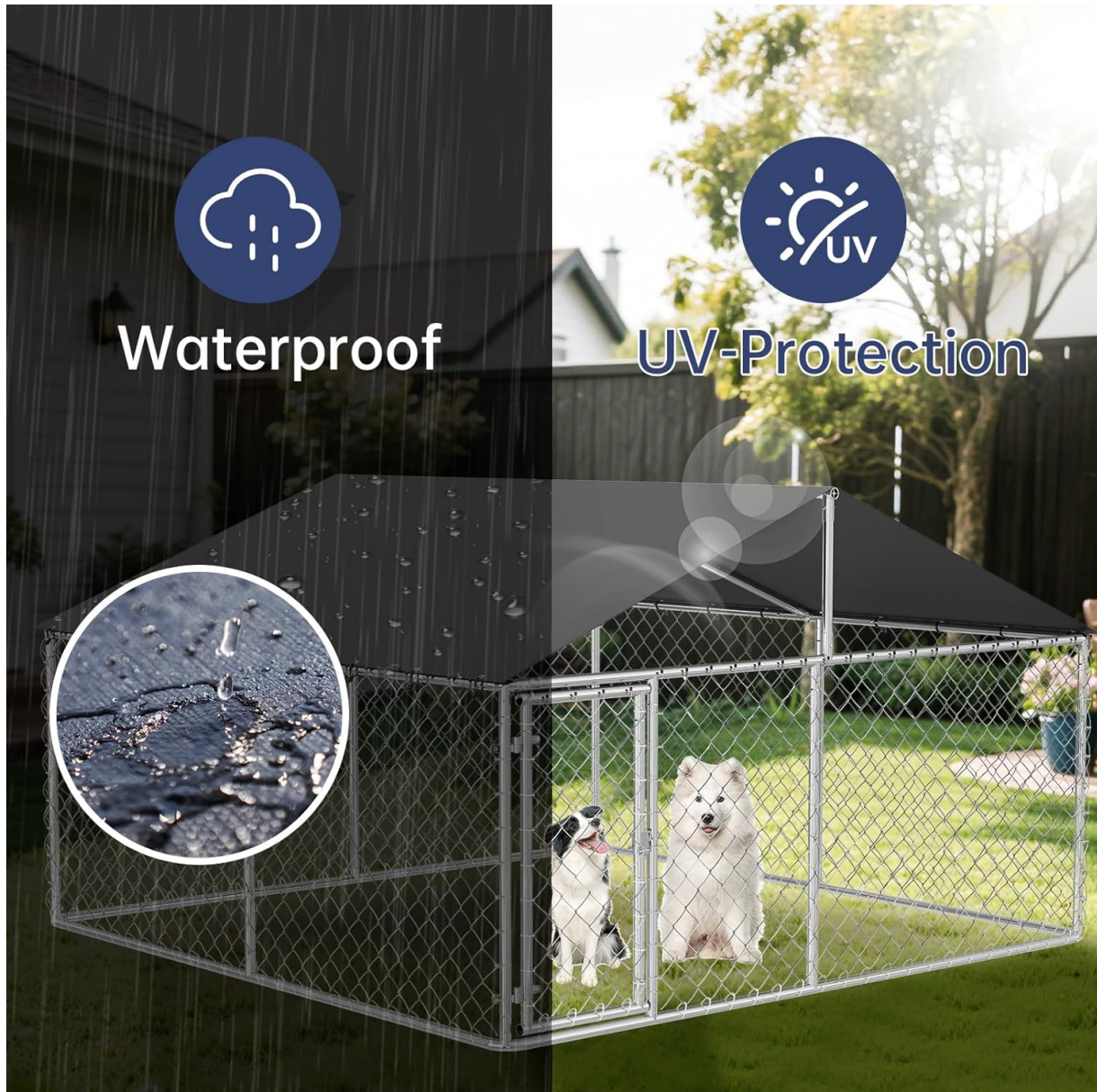
Image: Close-up view highlighting the waterproof and UV-protective features of the enclosure's roof cover.