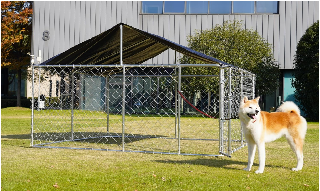
Image: The completed dog enclosure with the black PE fabric roof cover installed, providing shade.