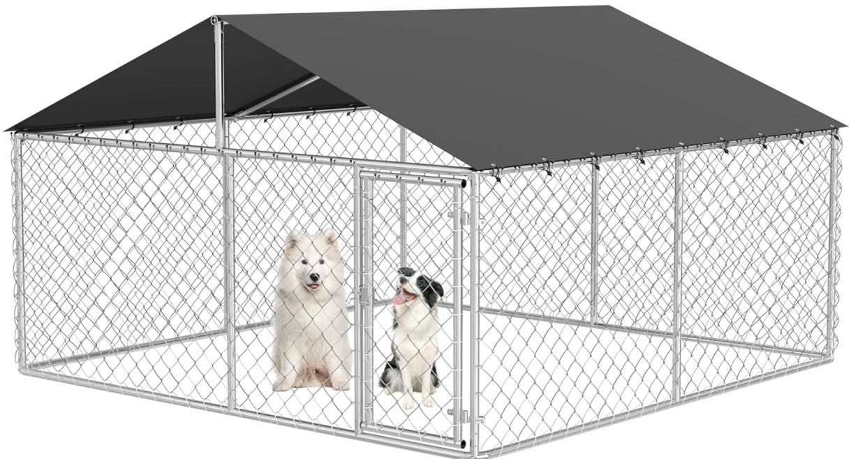
Image: Two dogs comfortably resting inside the spacious Petony Outdoor Dog Enclosure.

The Petony Outdoor Dog Enclosure provides a safe and spacious area for your pets. It is suitable for small, medium, and large dogs, offering an ideal space for training, resting, and outdoor play. The secure lock on the door ensures your pets remain safely contained.