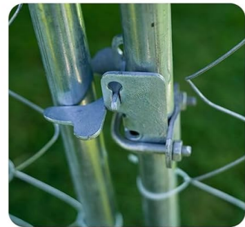
Lockable Design Safety

Image: Detailed part list from the instruction manual, showing various pipe types and accessories.