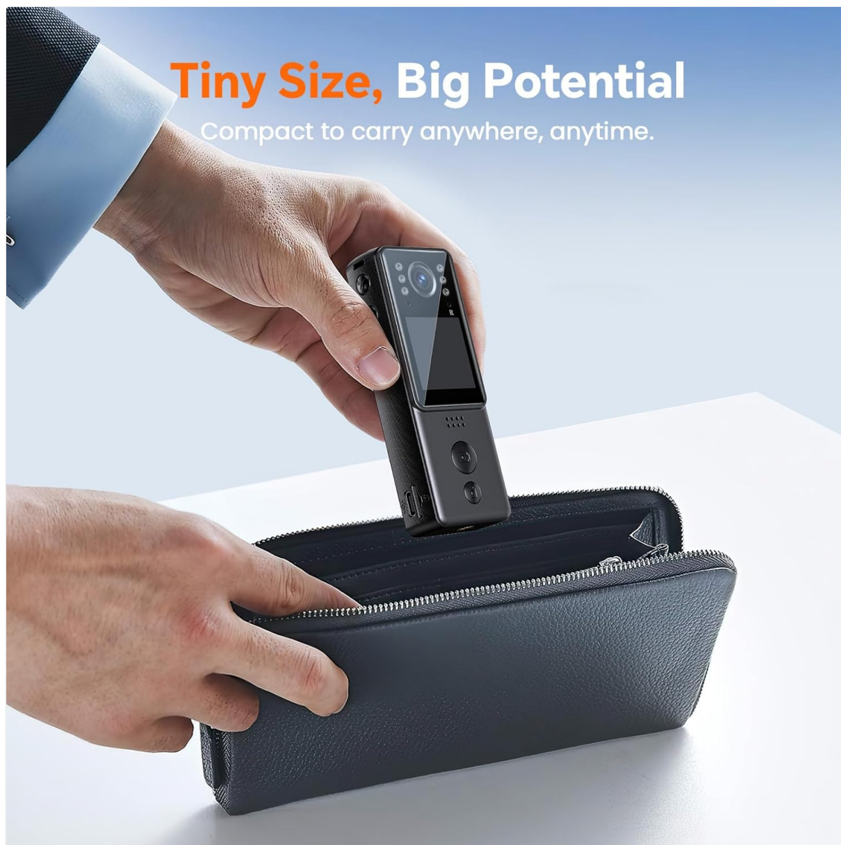
Figure 4: Versatile wearing options for the Losfom Z11 body camera.