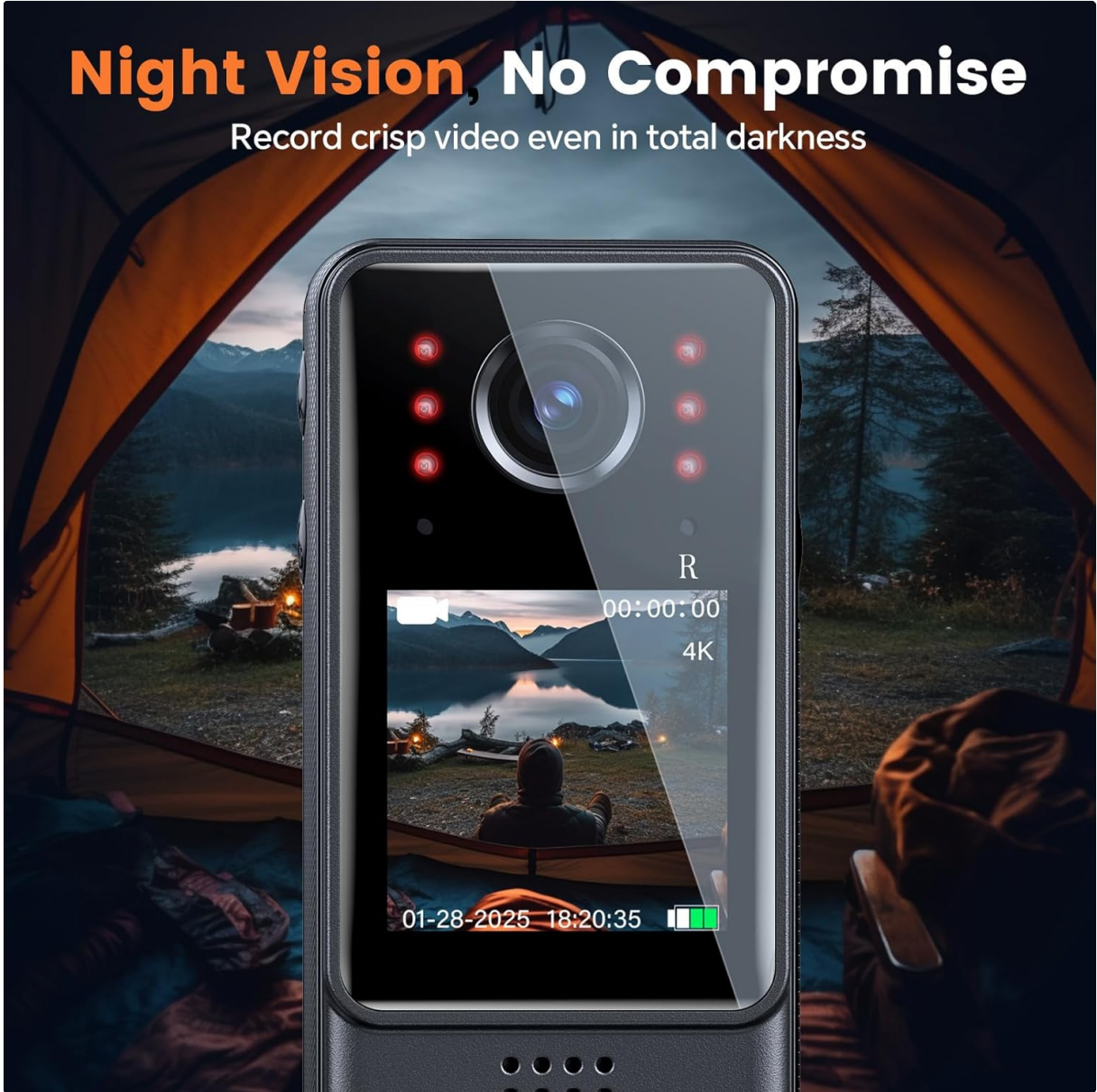
Figure 9: The compact design of the Losfom Z11 allows for easy portability.