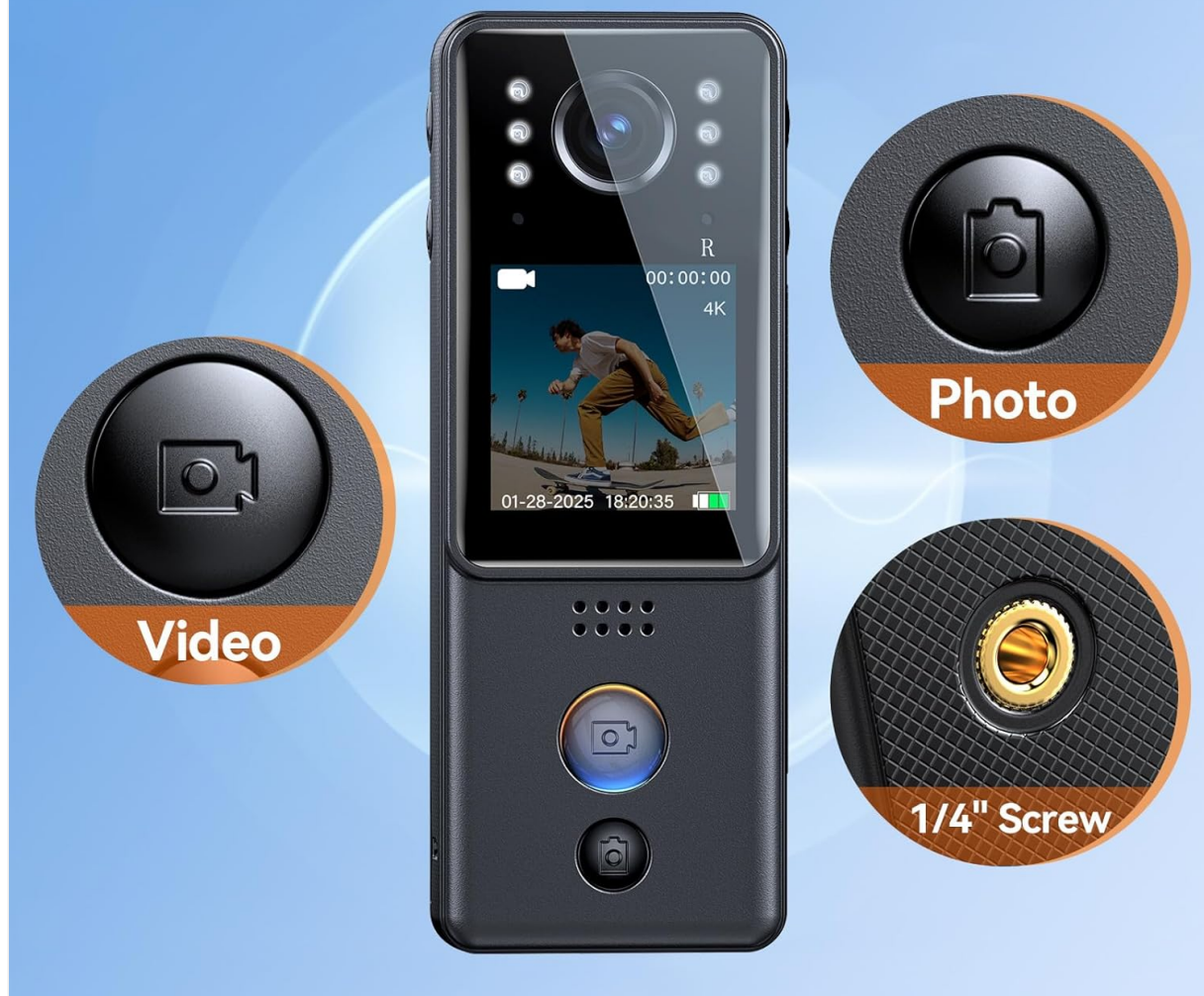
Figure 7: The Losform Z11's intuitive control buttons for easy operation.