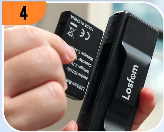
Figure 2: Replacing the Losfom Z11 battery. Press the latch, pop out the battery, and insert a new one.