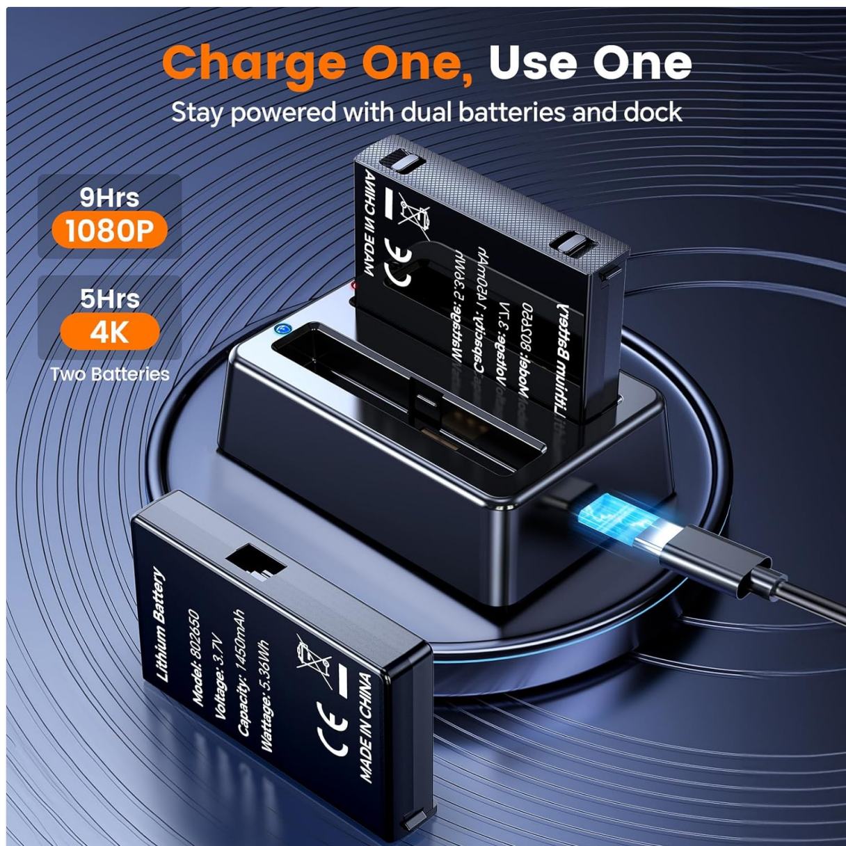
Figure 3: The charging dock allows for simultaneous charging of both batteries.

Your browser does not support the video tag.