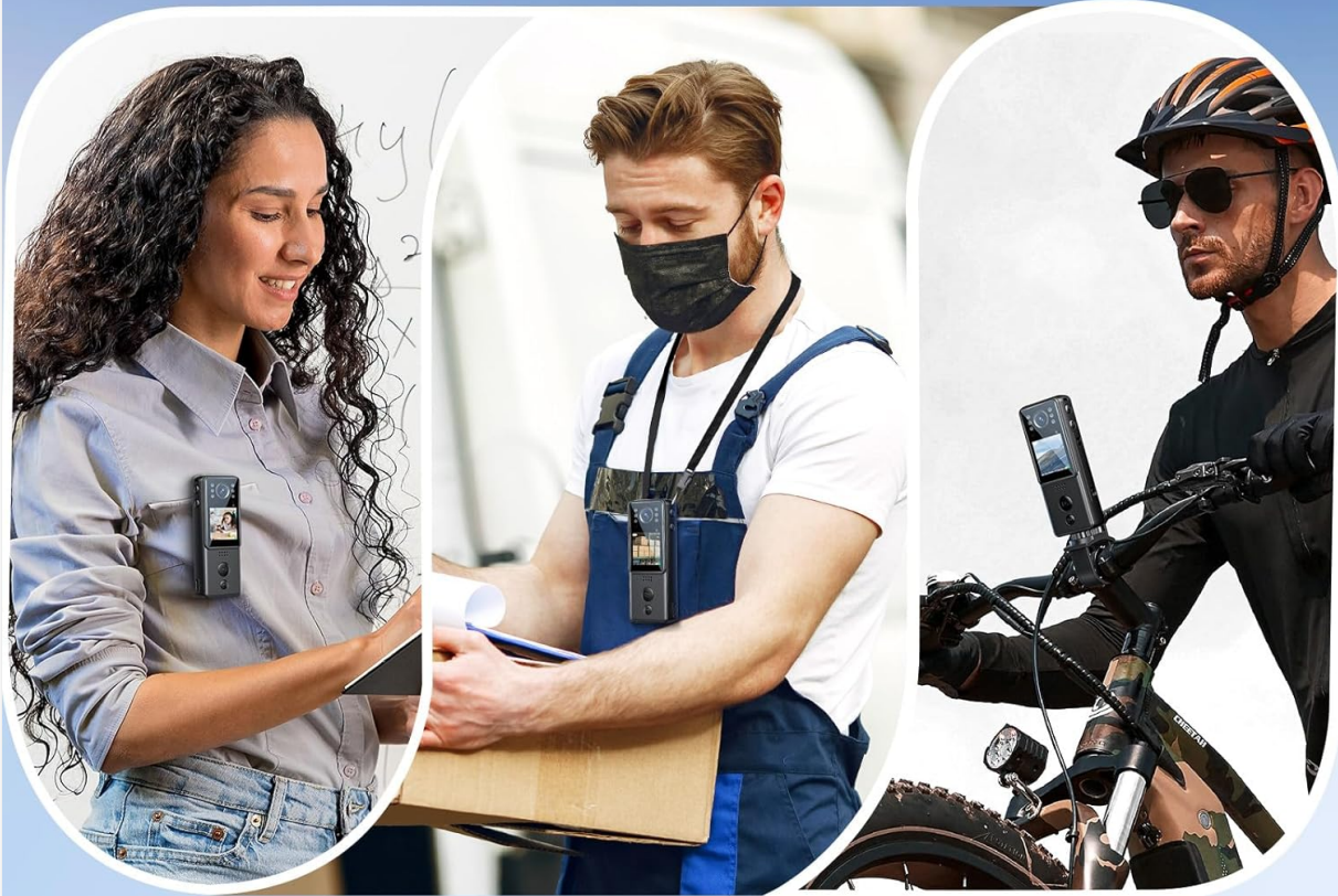
▲ Back Clip