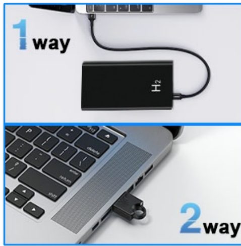
Image: Two methods for data transfer: direct connection via USB cable and using a USB adapter for the MicroSD card.