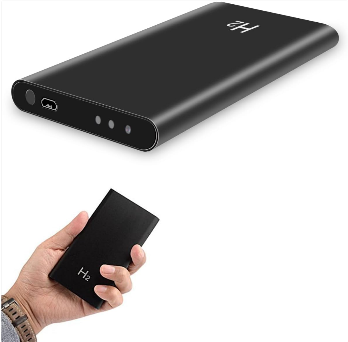
Image: Front view of the Jigayao H2 Hidden Camera Power Bank, showing its sleek design, USB port, and indicator lights.

features a 1080P camera and night vision capabilities.