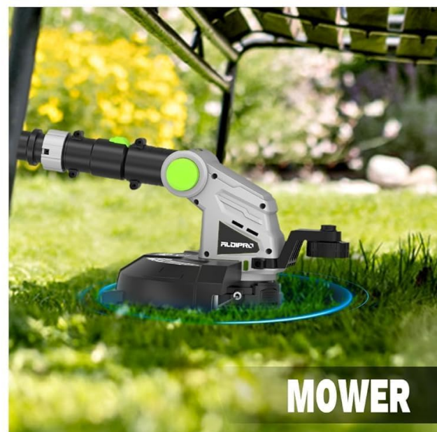
Image: Illustration of the ALDIPRO string trimmer demonstrating its use as a trimmer, edger, and mower.