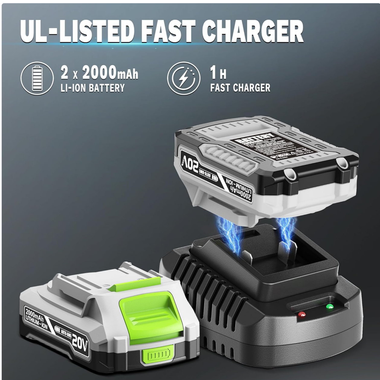
Image: The UL-listed fast charger and two 20V 2000mAh lithium-ion batteries.