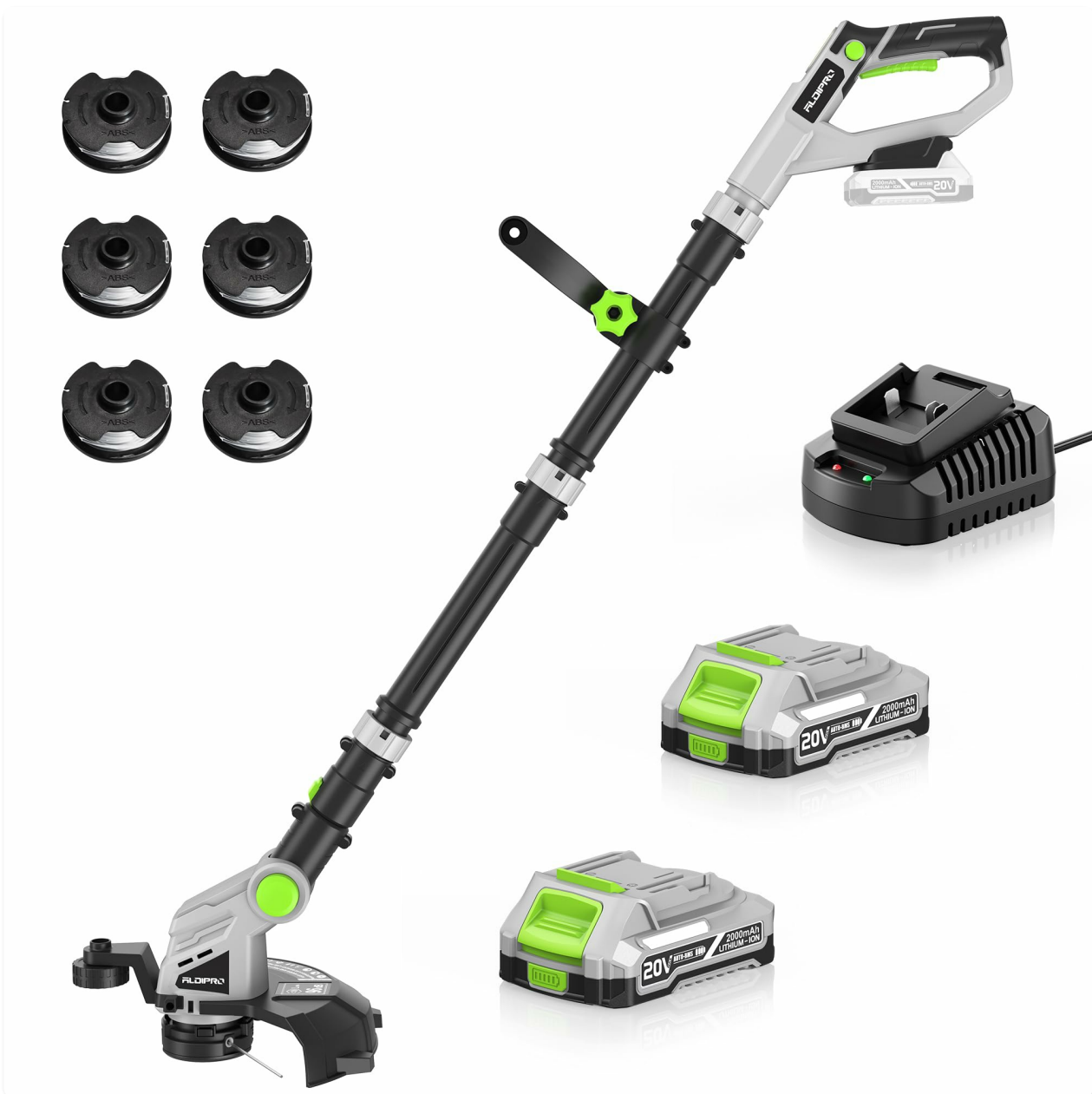
Image: The ALDIPRO Cordless 20V 12" Electric String Trimmer with battery and charger.