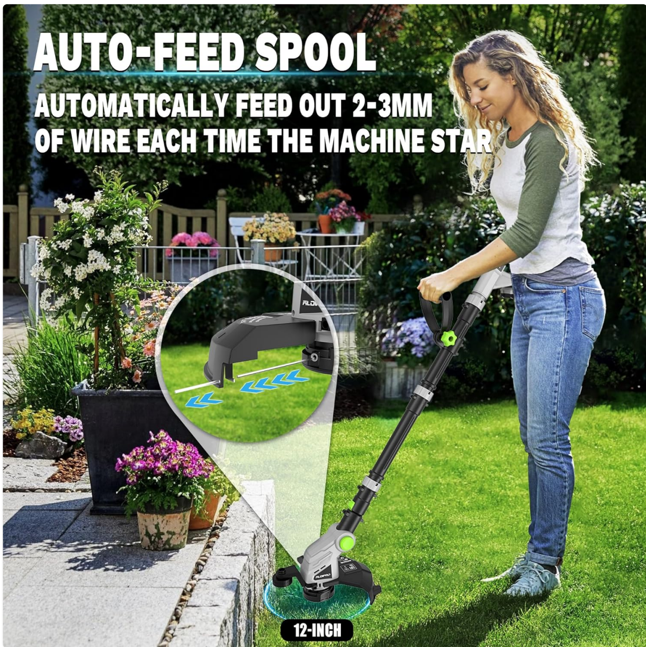
Image: Diagram showing the automatic line feed spool mechanism in action, extending the cutting line.