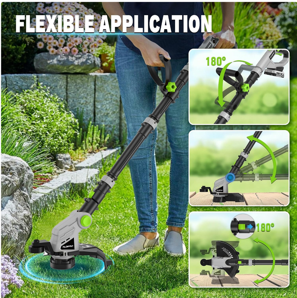
Image: Demonstrates the flexible application of the trimmer, highlighting the 180° head rotation, 60° up/down adjustment, and 180° handle swivel.