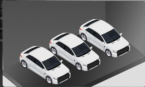
2-3 Car Garage