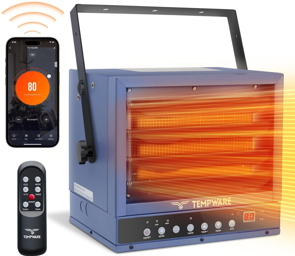
Image: Overview of the three control methods: remote, WiFi app, and touch panel on the heater.