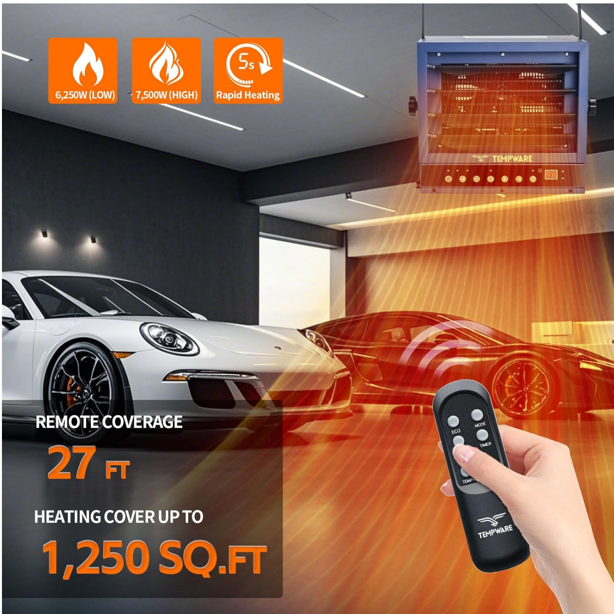
Image: A hand holding the remote control, illustrating its range and convenience for operating the heater.