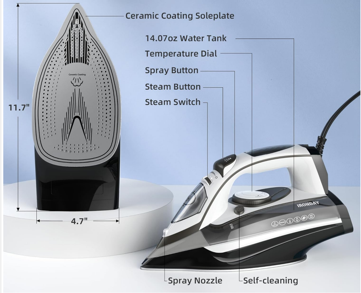
Image: Detailed diagram of the IRONDAY steam iron, labeling its key components such as the ceramic coating soleplate, water tank, temperature dial, spray button, steam button, and steam switch.