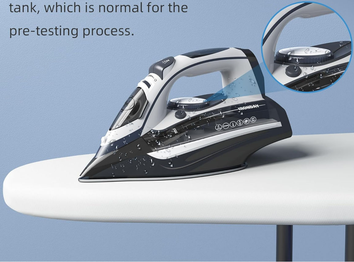
Image: The IRONDAY steam iron, highlighting a note about factory water testing and the presence of residual water.

Each IRONDAY steam iron is water tested before leaving the factory to ensure the quality and safety of the product. Some water may remain in the water tank, which is normal for the pre-testing process.