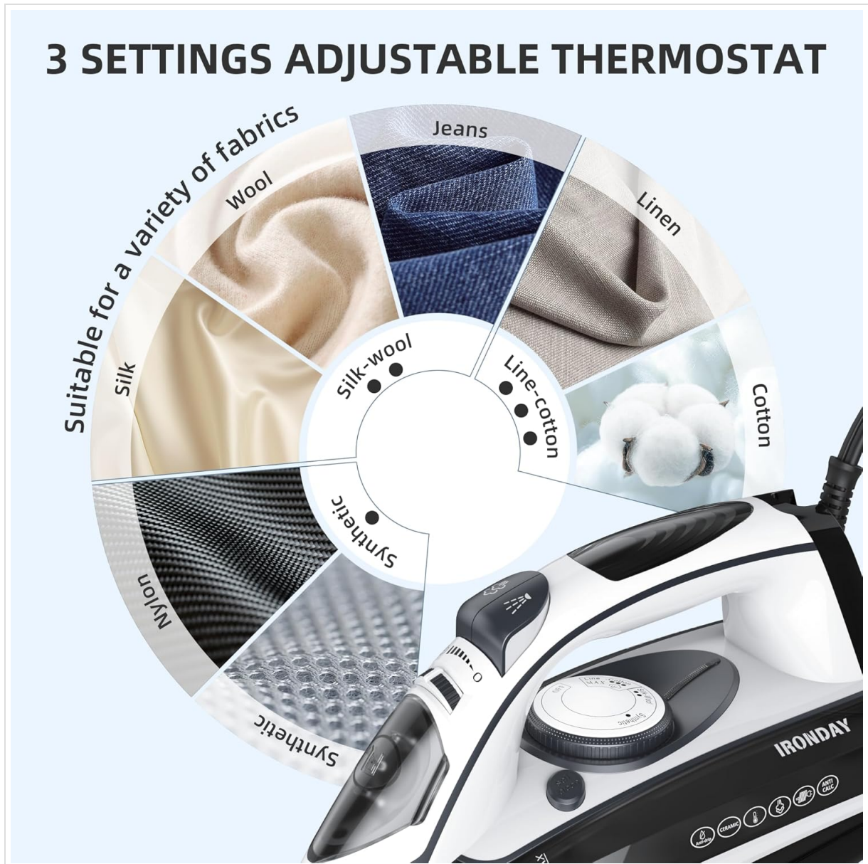
Image: Close-up of the iron's temperature dial, illustrating settings for synthetic, silk-wool, and linen-cotton fabrics.